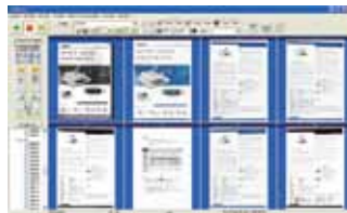
The AvScan 5.0 main screen

-The Intelligent Document Management Tool