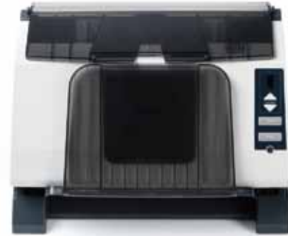
Input and output paper tray can be fold when not in use.