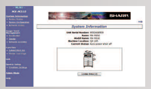
Embedded Web Page.