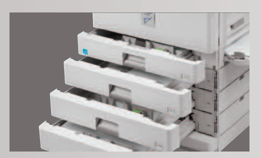
On-line paper capacity stores up to 2,100 sheets with options.