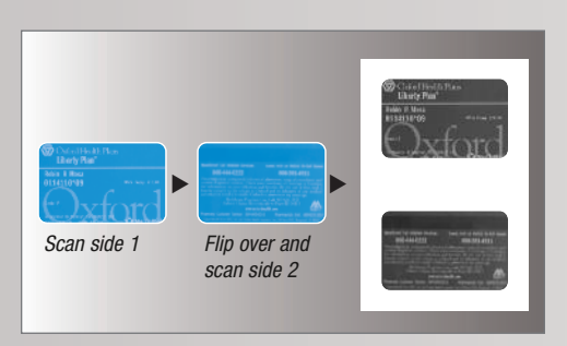
The Card Shot feature conveniently copies both sides of an ID or insurance card onto a single sheet of paper.