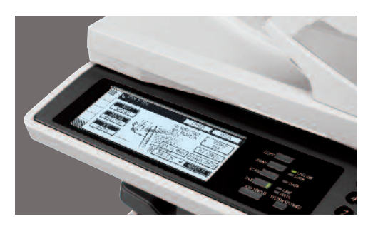
The optional Super G3 Fax module provides high-speed facsimile functions in a powerful LAN environment.