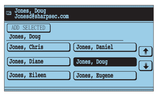
With the MX-M260/M310 Document Systems Network Scanning Kit with LDAP, users only need to enter the first few characters of the destination e-mail address.