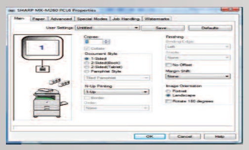
Increase network printing functionality and performance with Sharp's PCL6-compatible optional Print Controller.