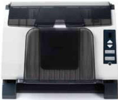
Input and output paper tray can be fold when not in use.