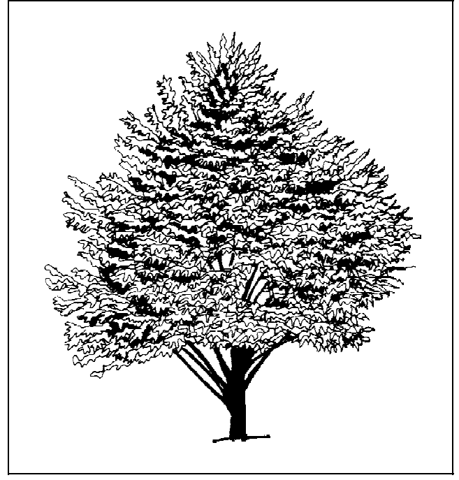
Figure 1. Middle-aged Katsuratree.