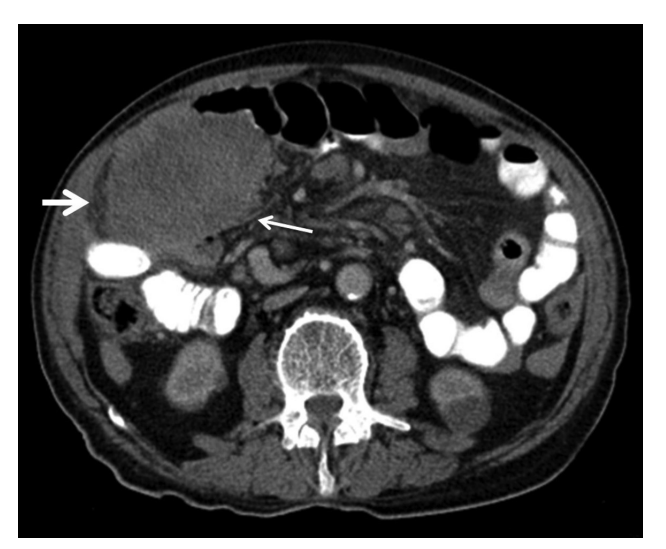
Figure 2. A 85-year-old man with GIST in high-risk group. Axial contrastenhanced CT scan shows mesenteric heterogeneity (thick arrow) and irregular contour (thin arrow) of ileal tumor.