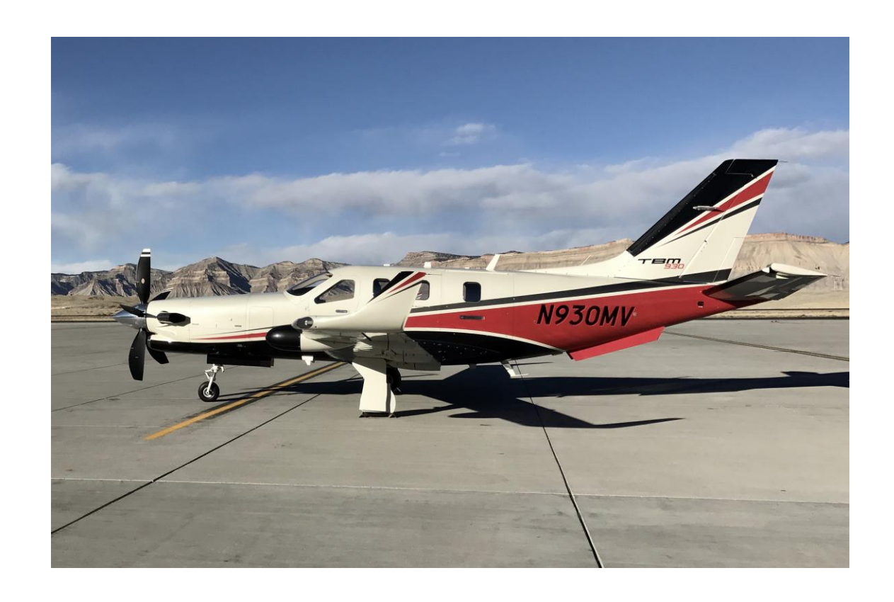
2016 Daher-Socata TBM 930 N930MV sn 1136 Pilot Door – Elite Edition