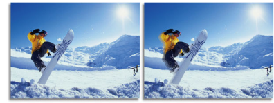
2ms GtG response time > 2ms GtG response time

SmartResponse is an exclusive Philips overdrive technology that when turned on, automatically adjusts response times to specific application requirements like gaming and movies which require faster response times in order to produce judder, time-lag and ghost image free images