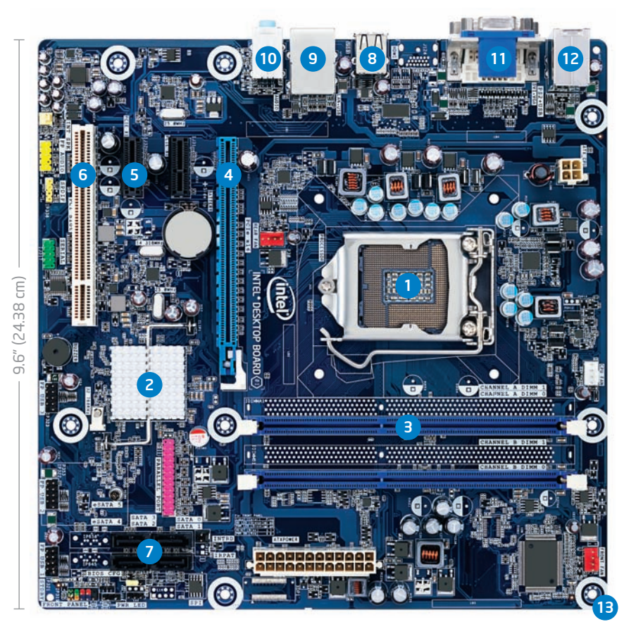
9.6" (24.38 cm)