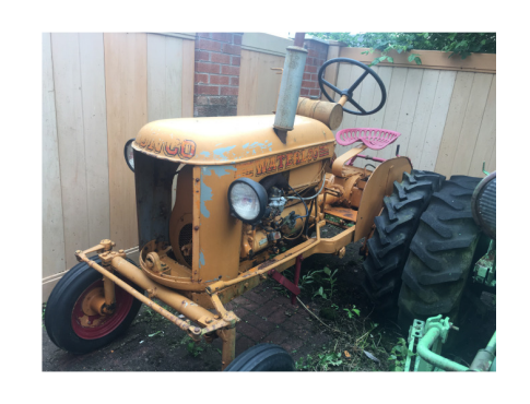
Lot 14 Waterloo Bronco 1948 Model (121) Started at 100 with Single Furrow Plough

Lot 15 Oliver 440 – 1960 – offset with full 3 point Hydraulics and Rockshaft Hydraulic