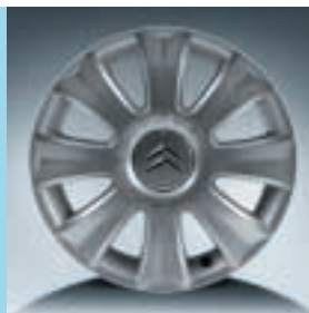
Suzuka 16" Alloy Wheels (3.0L V6 Exclusive)