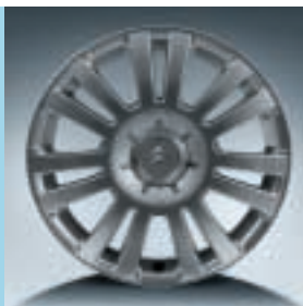
Hungaro 16" Alloy Wheels