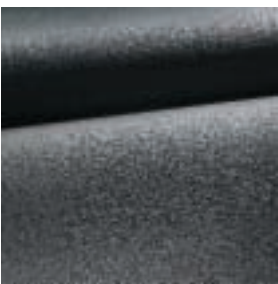
Luxury 'Tramontane' Leather