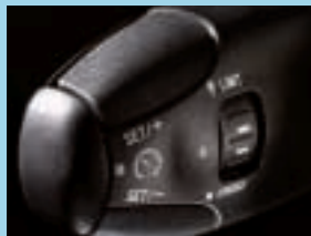
A speed limiter coupled with the cruise control prevents you from going beyond your set speed unless you deliberately "kick-down" the throttle or cancel it.