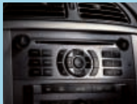
The audio volume adjusts itself automatically, to provide you with a consistent level of sound, irrespective of the speed at which you are driving.