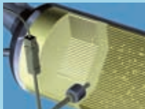
As part of the exhaust system, a state-of-the-art Particulate Filter periodically burns off the carbon particles that remain, virtually eliminating diesel smoke, thereby exceeding current EU environmental standards.