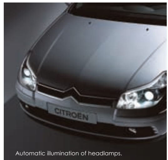
Automatic illumination of headlamps.

EuroNCAP. The New Look Citroën C5 achieved 36 from a maximum possible 37 points in the tough EuroNCAP independent crash tests, including full marks for the front impact test.