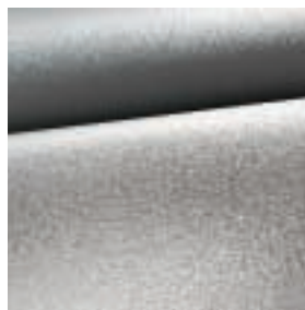
Luxury 'Matinal' Leather