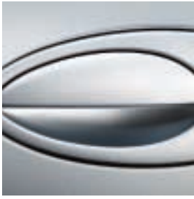
Gris Aluminium (Metallic)