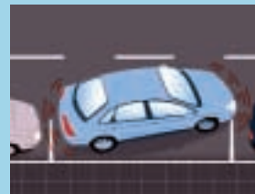
On the 3.0L V6 Exclusive, the front and rear electronic parking sensors, have both an audible and visual directional alert feature.