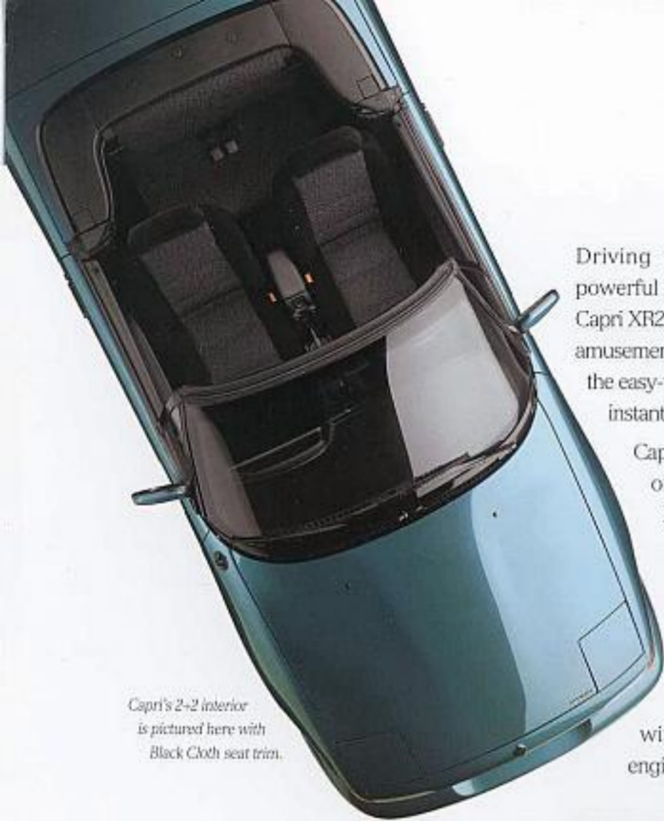
Capri's 2+2 interior is pictured here with Black Cloth seat trim.