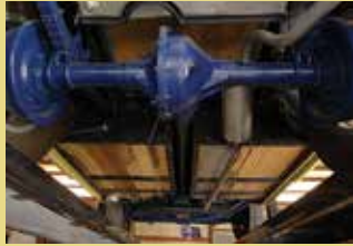
This rear view reveals that the truck's suspension down to the U-bolts is painted blue, and the floors are real pieces of wood.