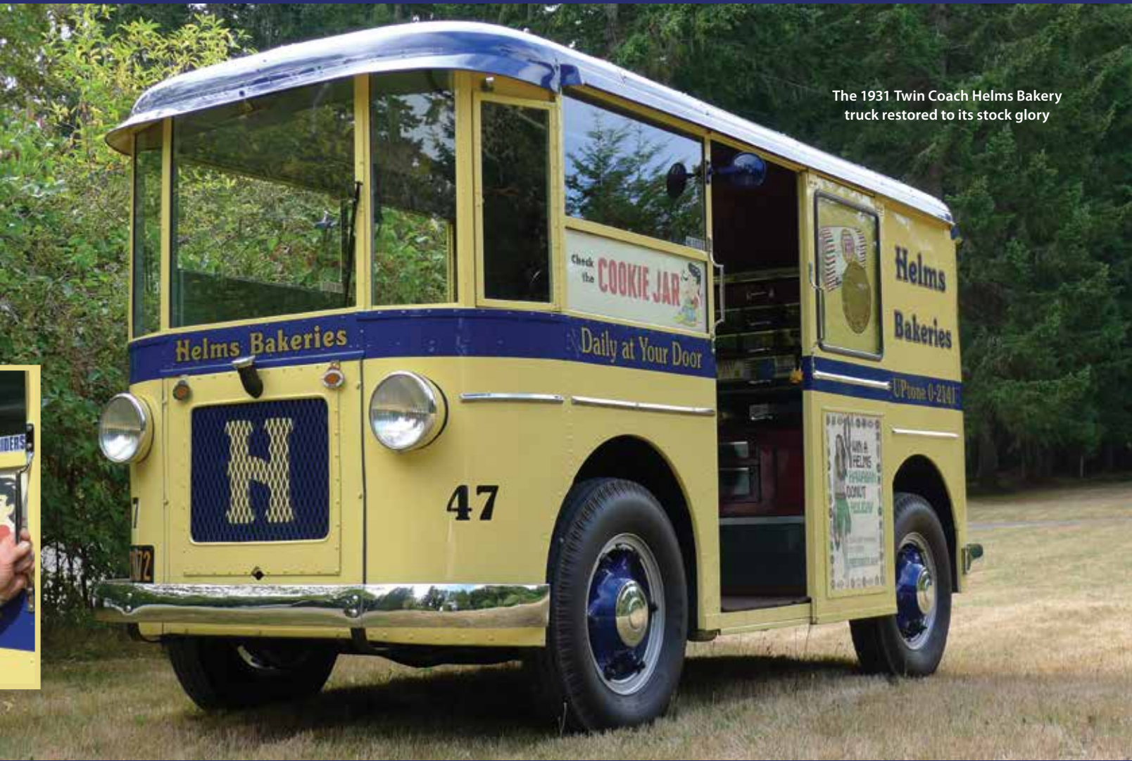
The 1931 Twin Coach Helms Bakery truck restored to its stock glory