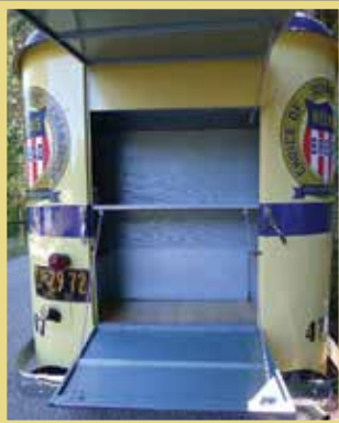
This back hatch functioned as a versatile storage area with many uses.