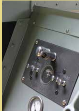
A view of the simple instrument panel

Customers were encouraged to board the truck to personally select their pastries from the drawers.