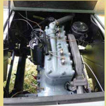
The original 4-cylinder Hercules OOB engine was rebuilt with parts from the OOC engine version, which was commonly used in Cletrac crawlers.