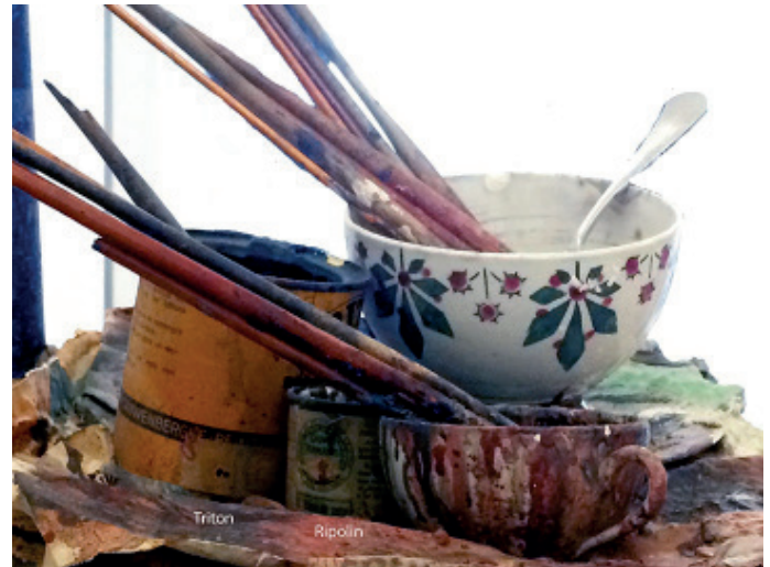
3. Detail of a chair with paint material from one of Picasso's studios in the South of France showing a can of black Triton paint and a can of Ripolin blanc de neige © Succession Picasso, 2016

the painting vocabulary of the artist, including brands such as Valentine, Triton, and Avi, whose cans can be seen in the many photographs of Picasso's homes of the South. Some examples of actual cans—the paint sometimes still viscous to this day, pulsating with its endless possibilities—remained in Picasso's many studios and are in the possession of the family, with one specimen of black Triton and one of Ripolin blanc de neige currently on display in the reopened Musée national Picasso-Paris (fig. 3).