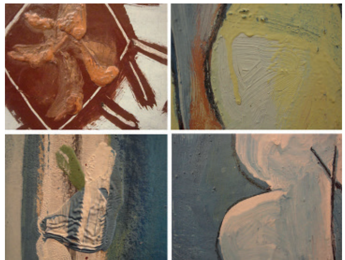
1. Selected examples of surface characteristics typically associated with enamel paints, as captured on the surfaces of the Antibes paintings. From top left, clockwise: fluidity of paint; drips; marbling and incorporation of dried bits of paints; wrinkling. Details taken from, top left: Nature morte aux volets noirs ; top and bottom right: La Joie de Vivre ; bottom left: Ulysse et les sirènes