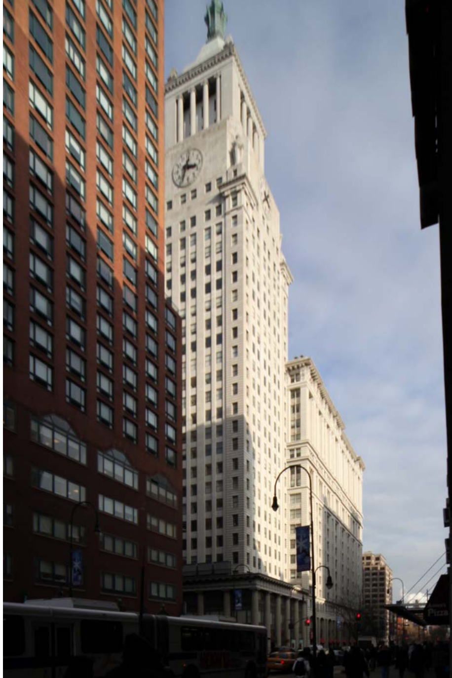
Consolidated Edison Building 4 Irving Place (aka 2-12 Irving Place, 121-147 East 14 th Street, 120-140 East 15 th Street), Manhattan