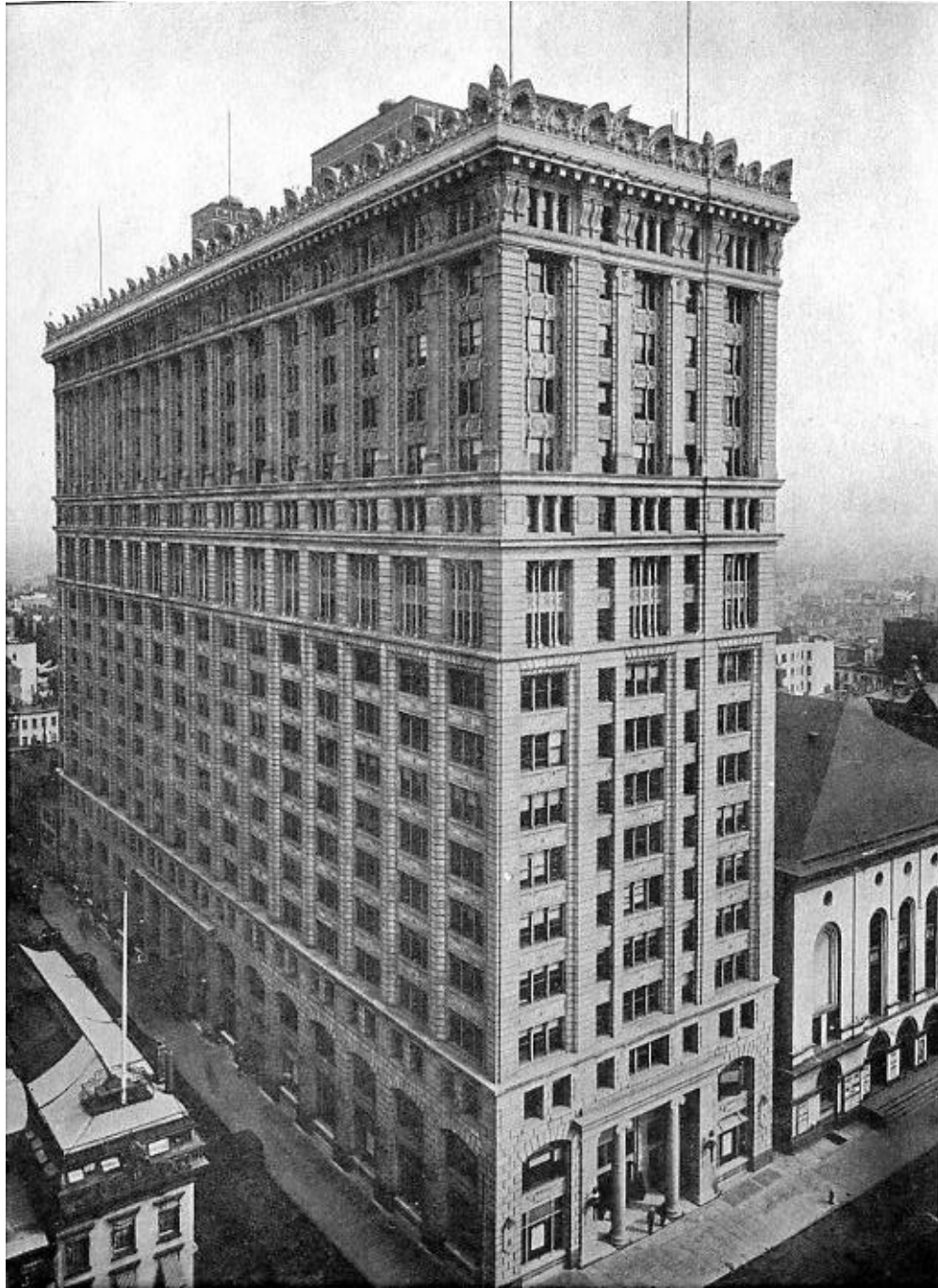
Consolidated Edison Building, formerly Consolidated Gas Company Building, c. 1914