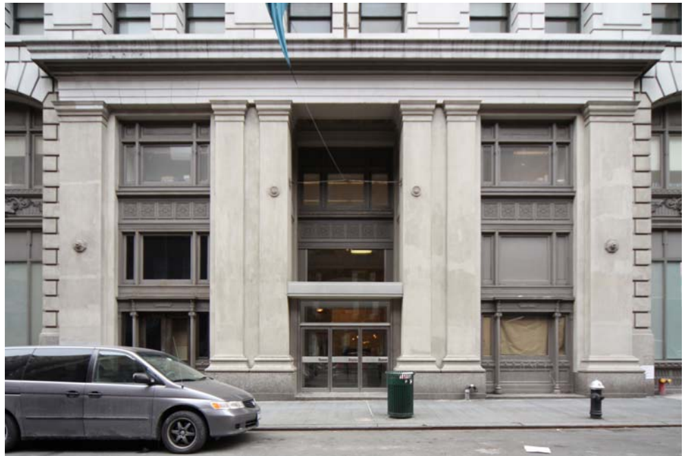
Consolidated Edison Building, formerly Consolidated Gas Company Building Details Fifteenth Street façade