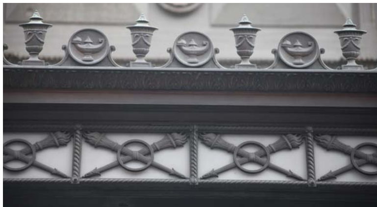
Consolidated Edison Building, tower base Photos: Christopher D. Braze, 2008-09