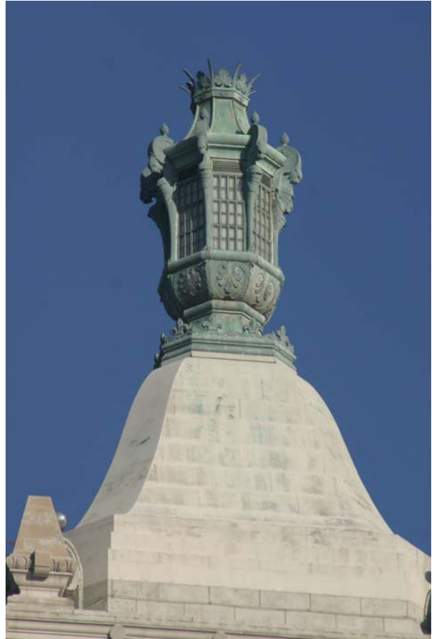
Consolidated Edison Building, tower Photo: Christopher D. Brazee, 2008