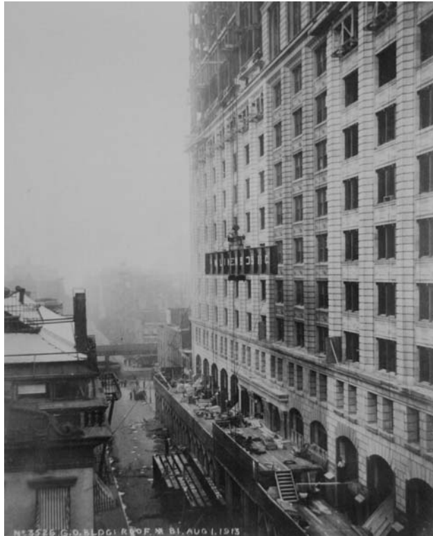
Top: Consolidated Edison Building, formerly Consolidated Gas Company Building First phase as built, c. 1912