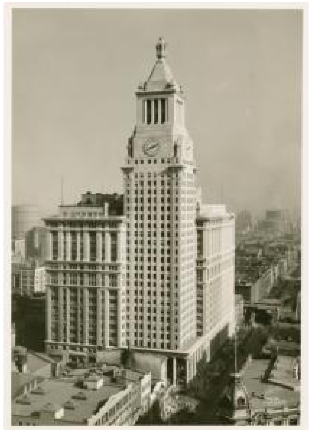
Consolidated Edison Building with Warren & Wetmore additions of 1926-29