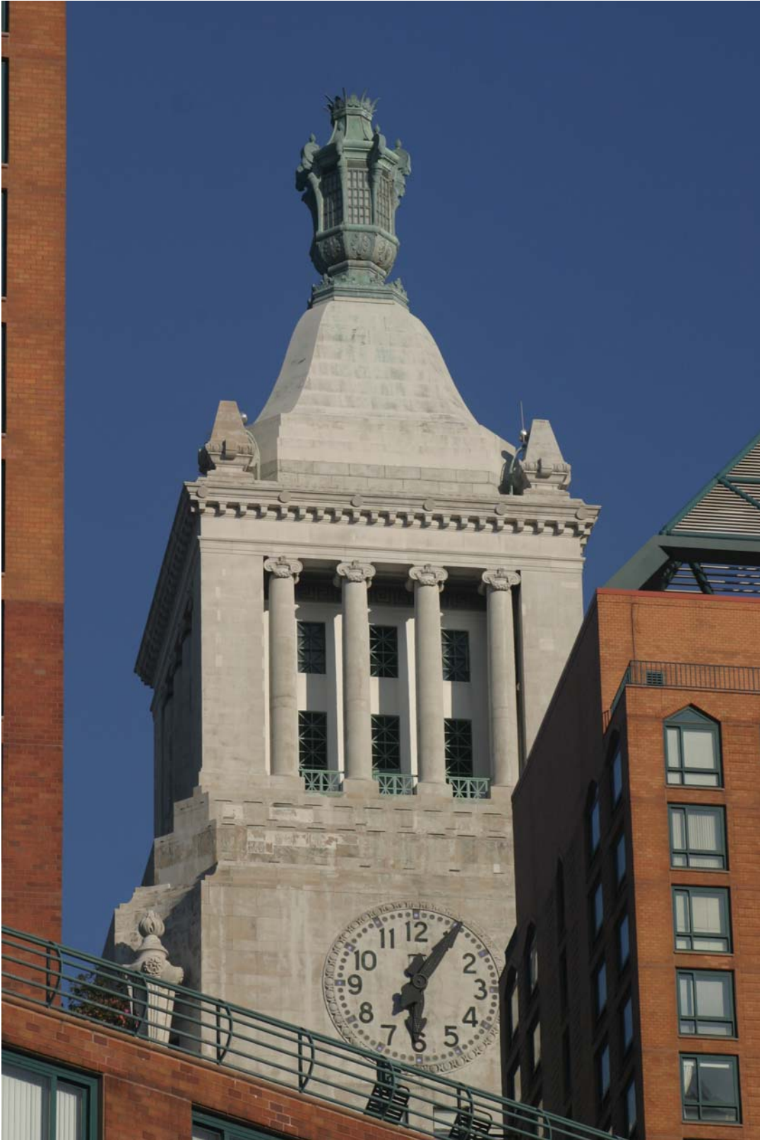
Consolidated Edison Building, tower