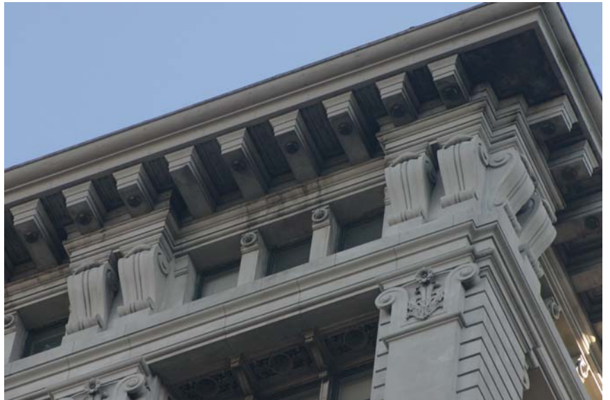
Consolidated Edison Building, formerly Consolidated Gas Company Building Details Fifteenth Street façade Photo: Christopher D. Brazee, 2008