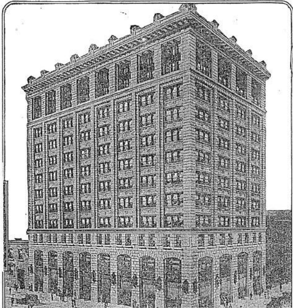
Henry Hardenbergh, Design for the Consolidated Gas Company Building, now Consolidated Edison Building, 1910