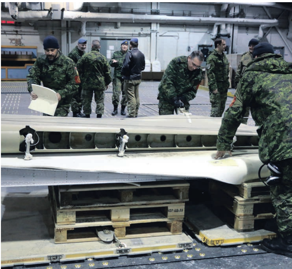
Members of 2 Air Movement Squadron load the tail fin of Nimrod XV 239 into a CC-177 Globemaster at 8 Wing Trenton on Jan. 9.