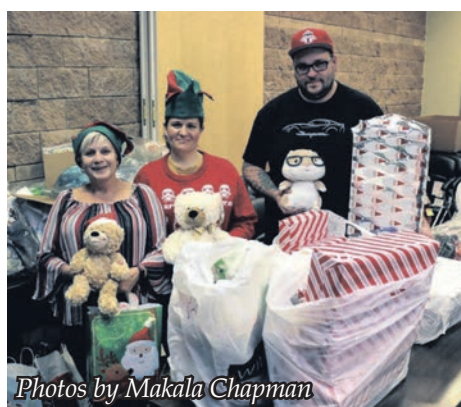
Members of the Angela Hayden Adopt a Family Christmas Program stand amongst the hundreds of gifts donated by both the military and civilian community in December 2019.

the non-profit initiative calls upon the 8 Wing Community to "adopt" a military family in need. The result is an amazing collaboration of folks who care and wish to make the holiday season special for the children of the military community. To help close off the end of the year in an even more special way, members of 8 Wing Trenton welcomed five families from Make-A-Wish Canada to the area. The children were treated to an unforgettable experience as they got a behind-the-scenes look at Canada's largest military air base in action. Their visit included a ride aboard a CC-130 Hercules and a special catered lunch by 8 Wing Foods Services.