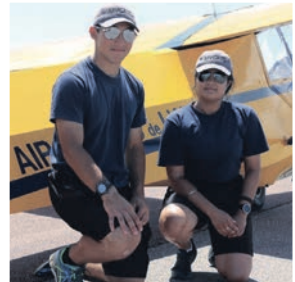
TOP: A team from 424 Transport and Rescue Squadron arrived in a CH-146 Griffon Helicopter on Aug. 10 where they discovered the downed aircraft in a forested area near Gravenhurst, Ont.