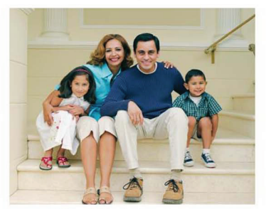
The clear choice for your family's medical needs

Florida Community Health Centers, Inc. "Working Together for Healthier Communities" www.fchcinc.org