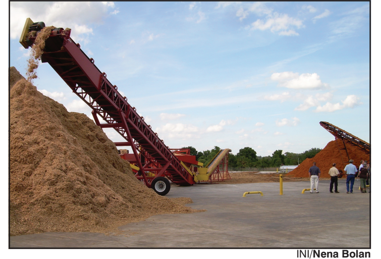
A new division of Lykes Bros., Inc., 7L Brands, began its eucalyptus and pine harvest mulch processing plant in October. During open house, May 6, in Palmdale, Glades County, visitors were given an indoor and outdoor tour.