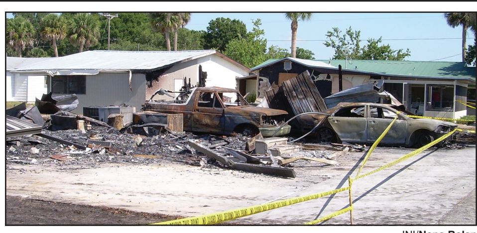
This shows the west end of the 3 house fire on Lowry Lane, off C.R. 721, in Lakeport.

and a lot of man power was expended. He believes the local volunteer fire department saved the rest of the homes on that block