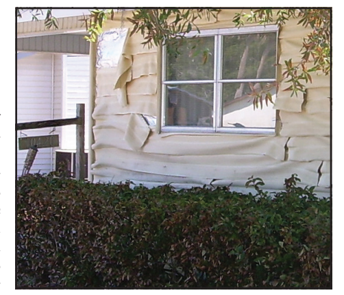
INI/Nena Bolan The siding on this house was warped during the intense heat of fire across the street, early May 6.

Three structures were a total loss, and minor to moderate damage was done to structures adjacent to the fire. Siding on a house across the street was warped from the heat. Mr. Chapman explained that it was very hot