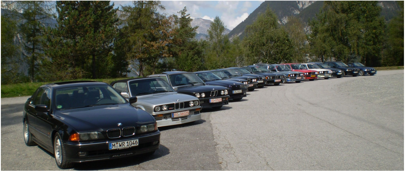
Group photo in front of a breathtaking scenery

We couldn't believe our eyes when we discovered that the place had hardly changed in 31 years.