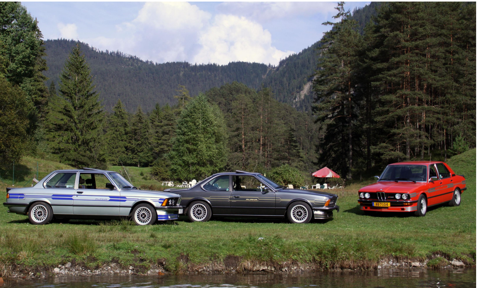
ALPINA-Gemeinschaft e. V. at the reenacted photo shooting at the picturesque Fernsteinsee

BMW Clubs International Council Newsletter