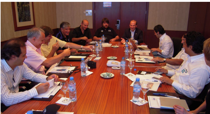
In conversation with highly motivated Latin American delegates

Top of the list for consideration was again budgetary matters and it was confirmed we have maintained our budget although it is still possible some funds may have to be reallocated later in the year, but we are hopeful this will not be the case. We also considered some website changes and updating as well as other communication tools such as stickers and flags for distribution along with some of the tools used in the past including pens and writing pads.