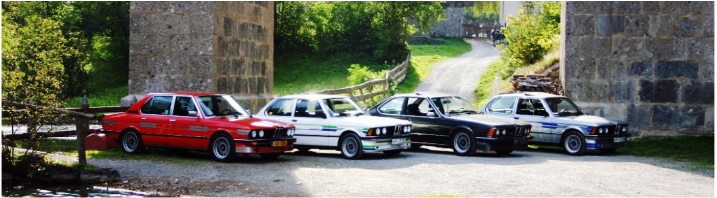
Cars of the club members on the peninsula near the Hotel Schloss Fernsteinsee