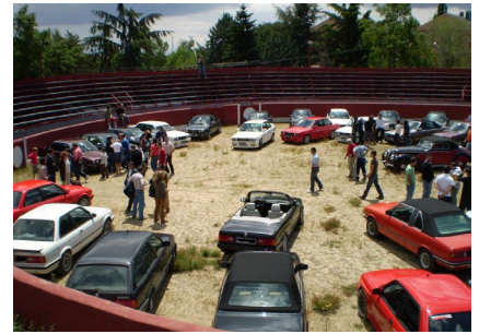
BMW classics in the arena

You will also find a current calendar of events on our website at www.bmw-clubs-international.com