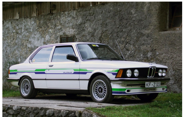
Alpina C1 2.3 in front of a true-to-the original scenery

We selected a beautifully restored B7 Turbo Sedan, a B6 2.8 which was very similar to the car in the original photograph, a black B7 Turbo Coupé and a particularly striking white C1 2.3 with green and blue stripes.