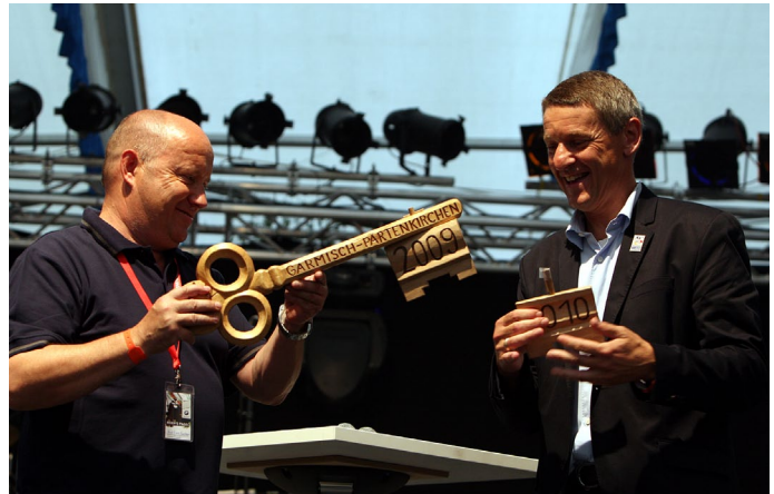
Symbolic handover of the BMW Motorrad Days 2010 in Garmisch-Partenkirchen

The exhibitors turn to the tourist information regarding room inquiries in Garmisch-Partenkirchen. For this a special e-mail address has been set up for you: bmw-motorrad@gapa.de