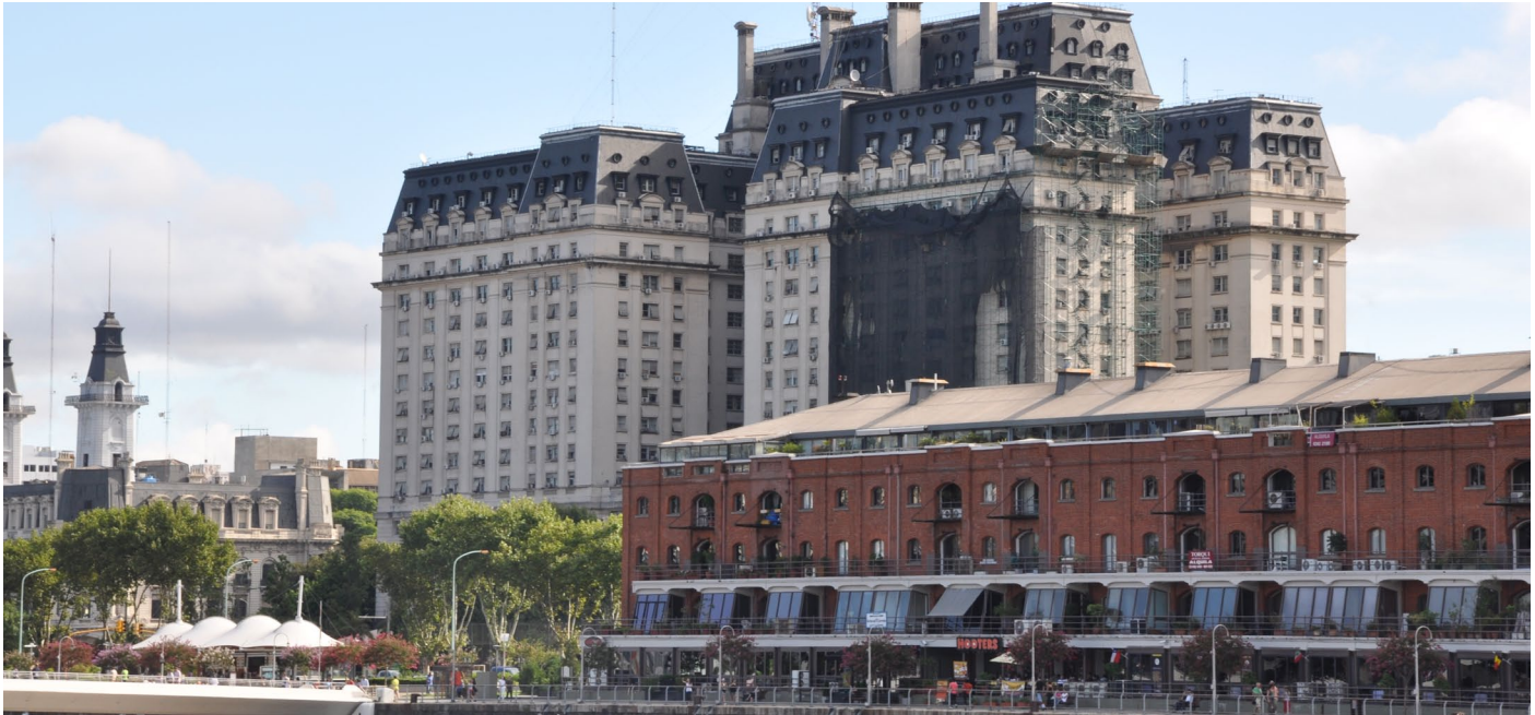
Buenos Aires – a city full of contradictions

All in all it was a full agenda and as usual has created plenty of work for the Board and the Club Office as we move towards the Annual Meeting in October.