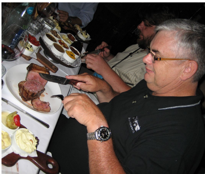
Beefsteak – one of Argentina's specialties

Immediately following the Working Meeting, the Board of the Latin American umbrella met and worked through its own issues. For a couple of hours there was productive discussion between the Council Board members and the delegates and from the questions asked it was apparent an area of strong interest related to advice on the development of mutually beneficial relationships between clubs and the BMW organization or dealerships/importers.