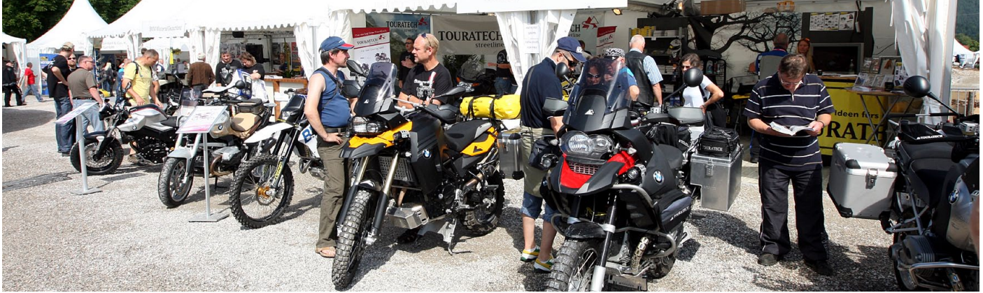
Many BMW motorcycle enthusiasts are expected to join the event this year