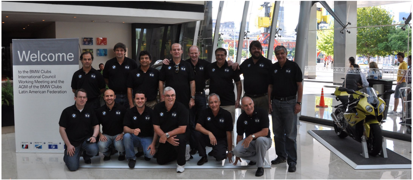
Combined Working Meeting of the Council Board with the first Annual General Meeting of the Latin American umbrella organization