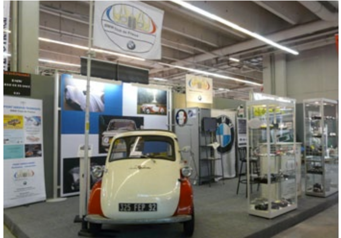
The club will attend the Le Mans Classic this summer