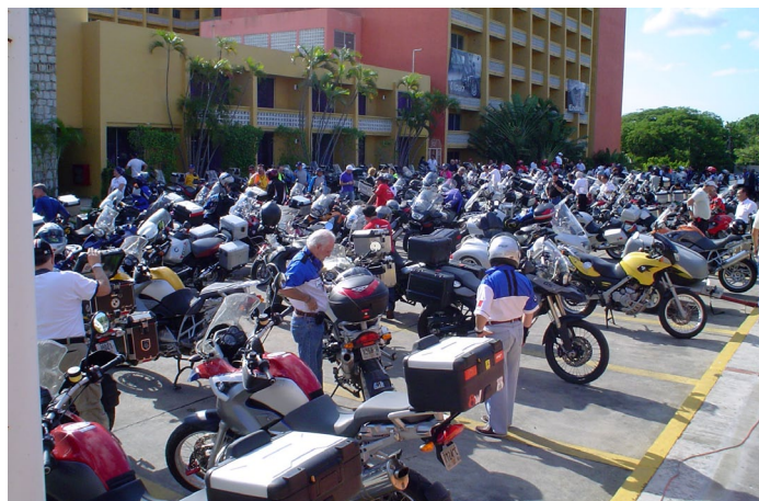
The event attracted participants from North and Central America

Our events are quite different from the ones from other countries. What we usually do is to ride together to some nearby towns to have lunch. After this kind of day tours, we get back to the host hotel to have presentations or just to party. We do not camp. People from Canada and the US have told us that they really enjoy our events, because we all go together everywhere. So, we had to ride 1,000+ km from home, but decided to visit the El Tajín archaeological site in the North of the State of Veracruz.