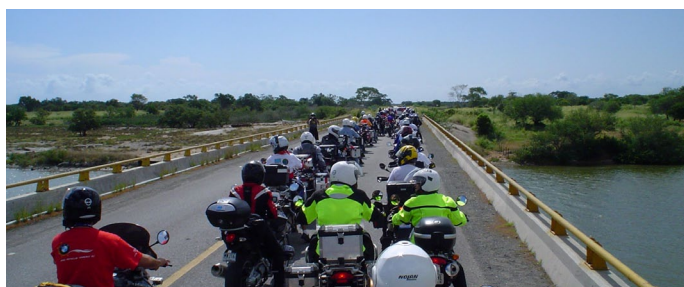
Riding together is an important part of the event

We arrived Thursday in Tampico among 550 participants and something like 450 bikes. During that evening we had the opening ceremony and some spirits with friends from many States from my country, and North and Central America fellows.