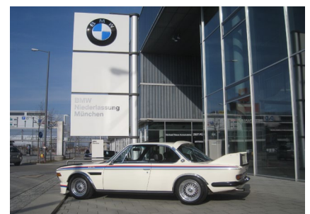
Current highlight at the BMW Munich subsidiary – a club member's BMW 3.0 CSL