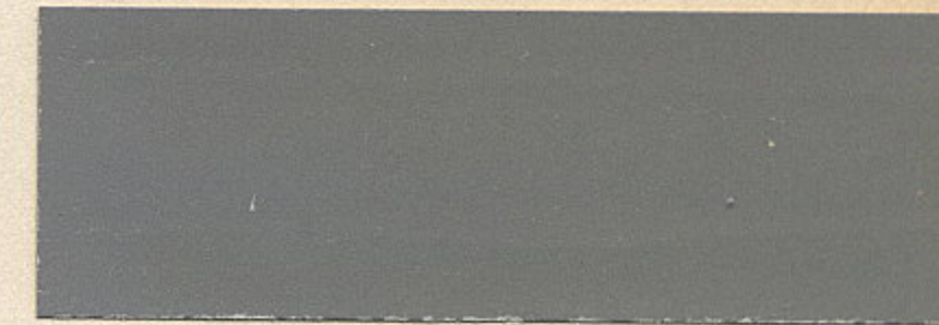
181-24097 Silver Fox Gray Metallic

181-24167 Saddle Bronze Metallic Supplied In DULUX Only No Mixing Formula Available