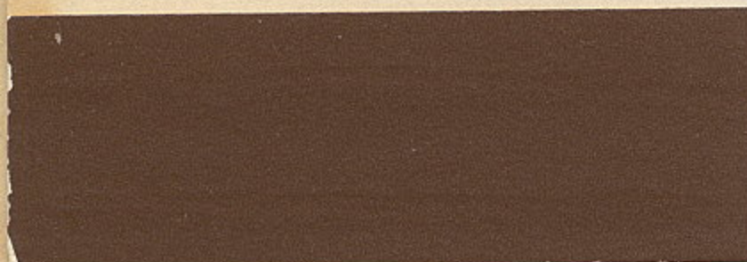
181-22393 Sportsman Beige Metallic

181-22391 Ocean Spray Green Metallic Supplied In DULUX Only No Mixing Formula Available