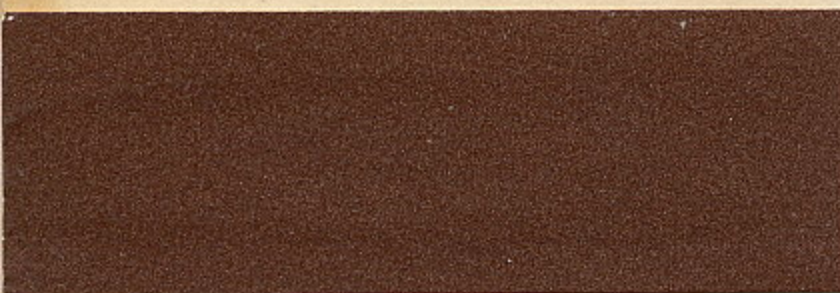
202-81348 Hickory Brown Metallic

202-81347 Crystal Green Metallic No Mixing Formula Available