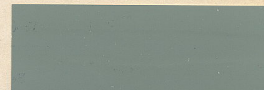
246-55178 Adirondack Gray