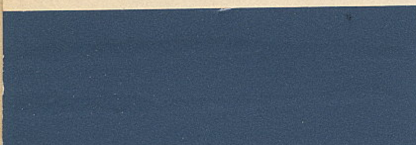
181-24094 Horizon Blue Metallic

181-22395 Caribbean Coral Metallic Supplied In DULUX Only No Mixing Formula Available