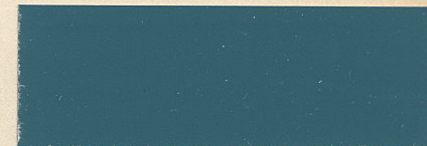
246-54846 Teal Blue