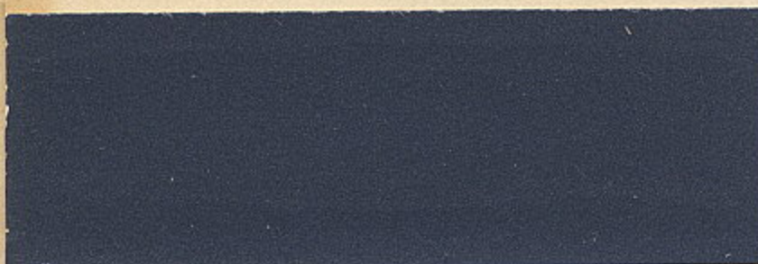
181-22368 Wedgewood Blue Dark Metallic

202-81349 Ranger Gray Metallic No Mixing Formula Available