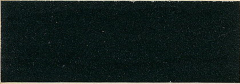
202-81347 Crystal Green Metallic

202-81327 Garden Green Metallic No Mixing Formula Available