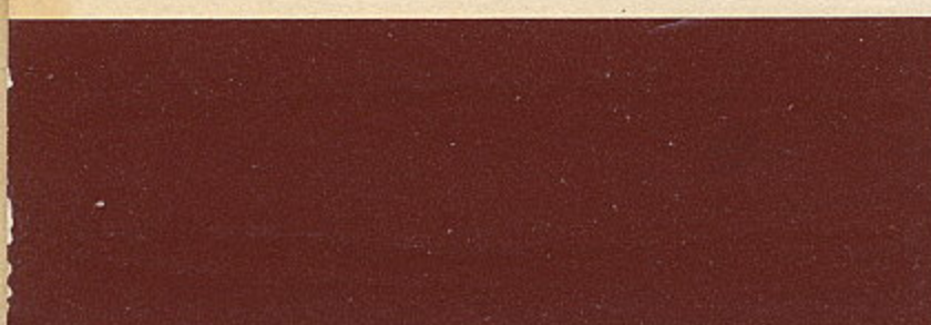
181-22395 Caribbean Coral Metallic

181-22393 Sportsman Beige Metallic Supplied In DULUX Only No Mixing Formula Available