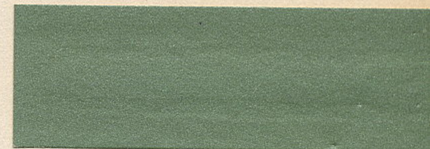
181-24096 Linden Green Metallic

181-24097 Silver Fox Gray Metallic Supplied In DULUX Only No Mixing Formula Available