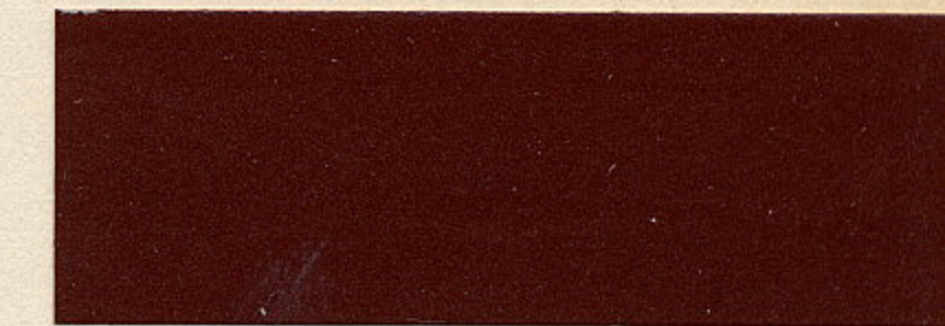
181-24167 Saddle Bronze Metallic

93-55076 Wedgewood Blue Supplied In DULUX Only No Mixing Formula Available