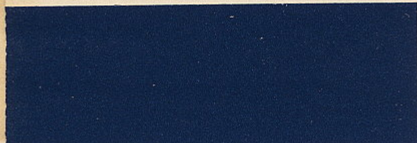
202-81288 Yale Blue Metallic