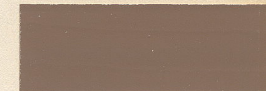
93-55212 Sportsman Beige

NOTE—Formulas in this bulletin are shown by volume (fluid ounces) and approximate 1 quart, or 32 ounces.