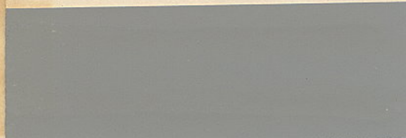
246-81310 Pearl Mist Gray