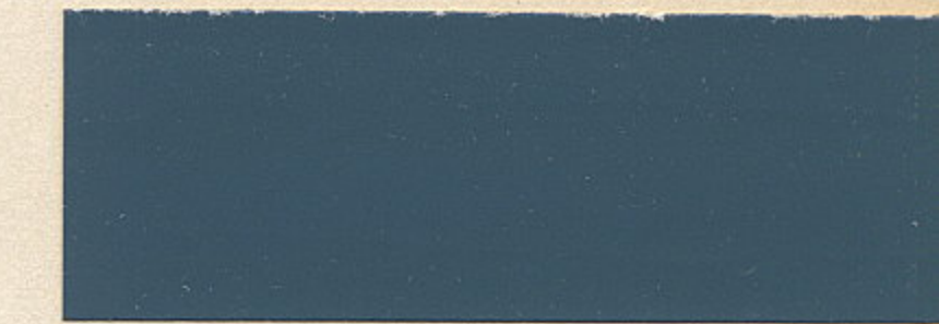
93-55079 Horizon Blue

93-55212 Sportsman Beige Supplied In DULUX Only No Mixing Formula Available