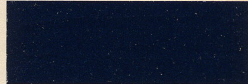
202-34610 Academy Blue Metallic