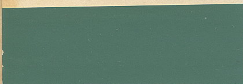
181-22391 Ocean Spray Green Metallic

181-22368 Wedgewood Blue Dark Metallic Supplied In DULUX Only No Mixing Formula Available