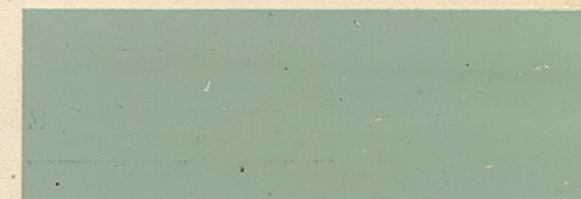
246-55123 Green Spray