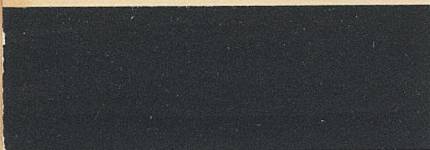
202-81349 Ranger Gray Metallic

202-81348 Hickory Brown Metallic No Mixing Formula Available