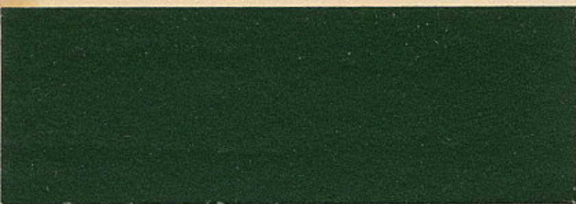
202-81327 Garden Green Metallic