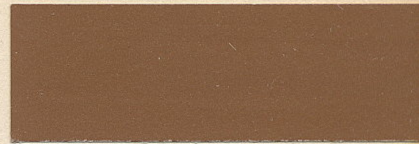
181-24095 Bermuda Tan Metallic

181-24096 Linden Green Metallic Supplied In DULUX Only No Mixing Formula Available