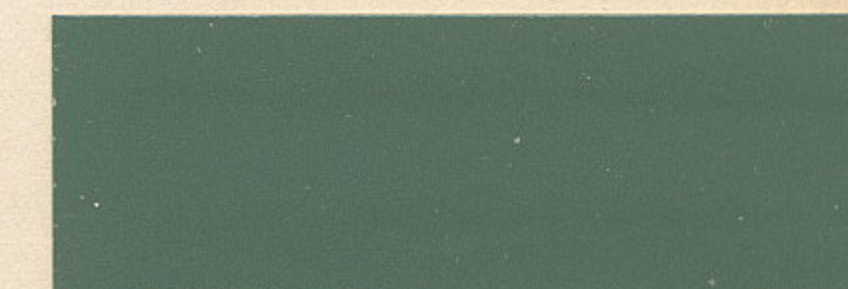
202-81206-G Green Spray Metallic