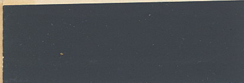
246-81311 Ranger Gray