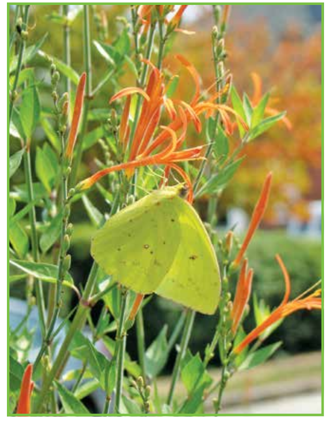
A male cloudless sulphur feeds at anisacanthus, a flower that is also a hummingbird favorite.

Knowing my fascination with rocks, my Aunt Frances bought me a collection of minerals during a motor trip through the West during the early 1970s. The minerals were glued to a piece of cardboard with each identified by name. One that I can still see to this day is sulfur. It was pure bright yellow. I had never seen a rock like it.