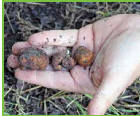
Truffle season in Georgia runs from July through October. It can take anywhere from half an hour to one week to find a pound of truffles.

truffles. So far they've been unsuccessful, and the pecan truffle remains a rare Georgia treat.