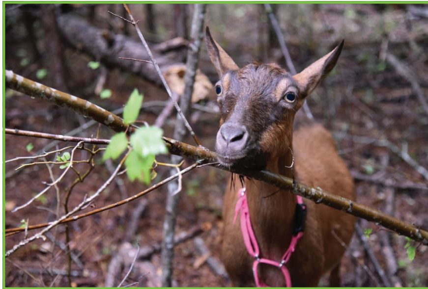
Members of Lu Flaherty's "chew crew" work for food.

Another component is herd size. The number of goats