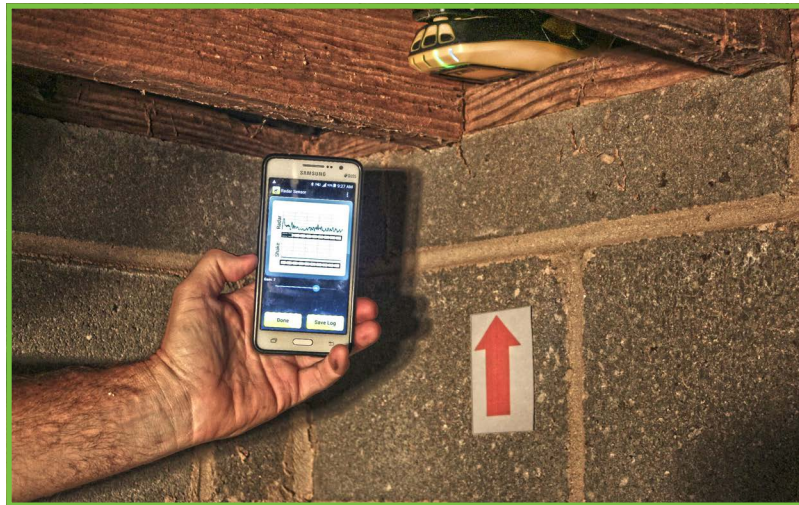
Termatrac's three-in-one sensor with radar, thermal and moisture detection abilities communicates through a smart phone app. Pest inspectors can print and record data to show homeowners their findings.

"There is a way you can apply foam and the termite company and the foam company can both have some variables that are very positive for the consumer," he said. "We're hoping we find a blend that works for everybody."