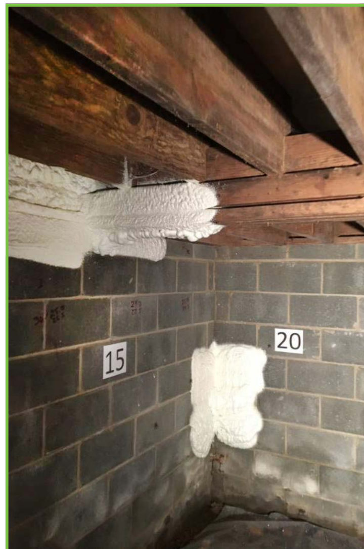
Spray foam insulation applied strategically in a crawl space beneath UGA's River Basin Center in Athens allowed pest control inspectors to test the latest technology for finding subterranean termites.