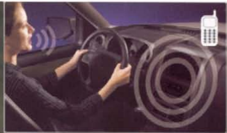
Mobile-Ease™ Hands-Free Communication System