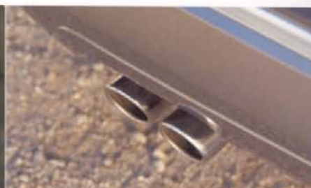
Chrome Exhaust Tips