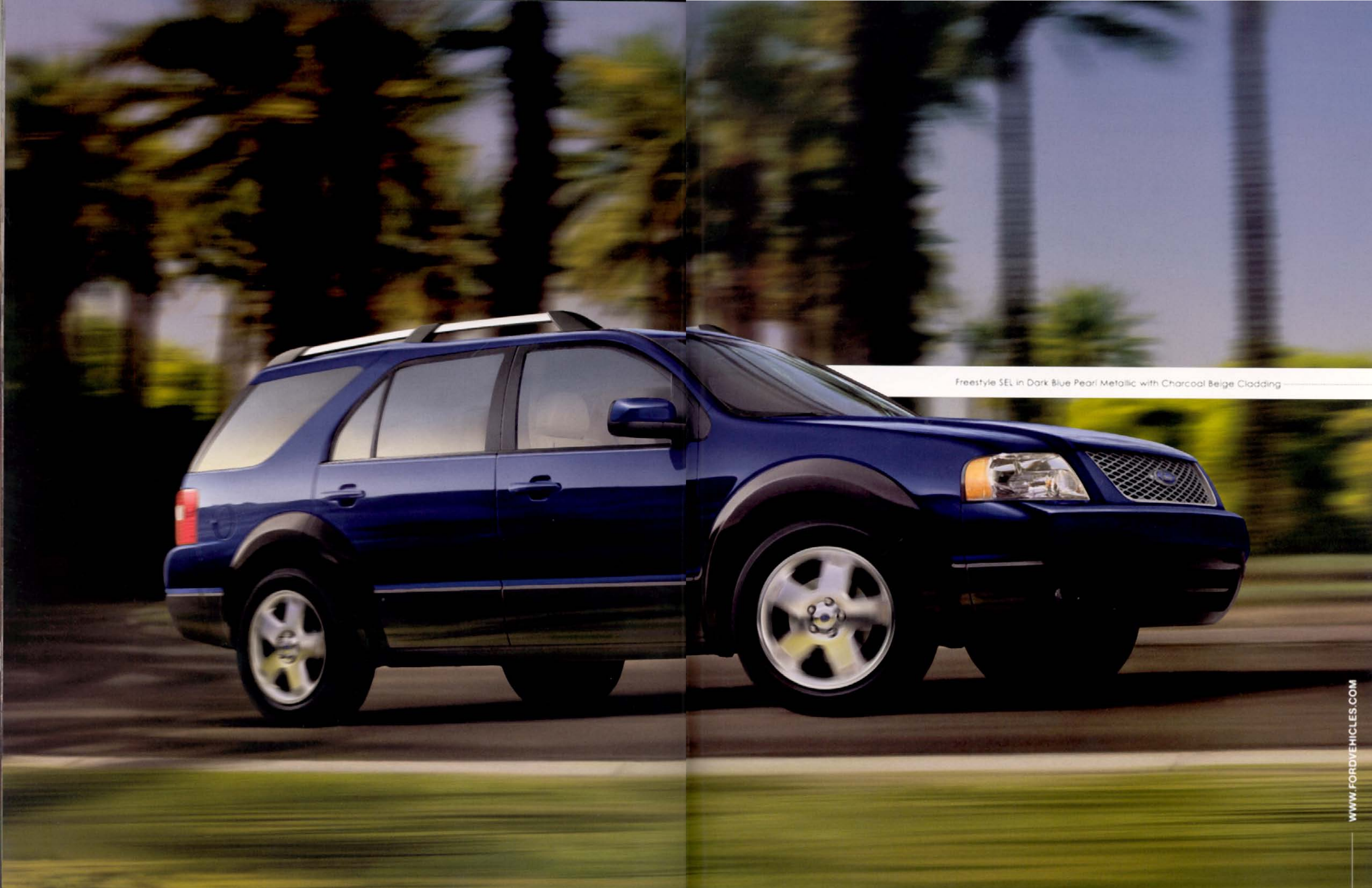
Freestyle SEL in Dark Blue Pearl Metallic with Charcoal Beige Cladding