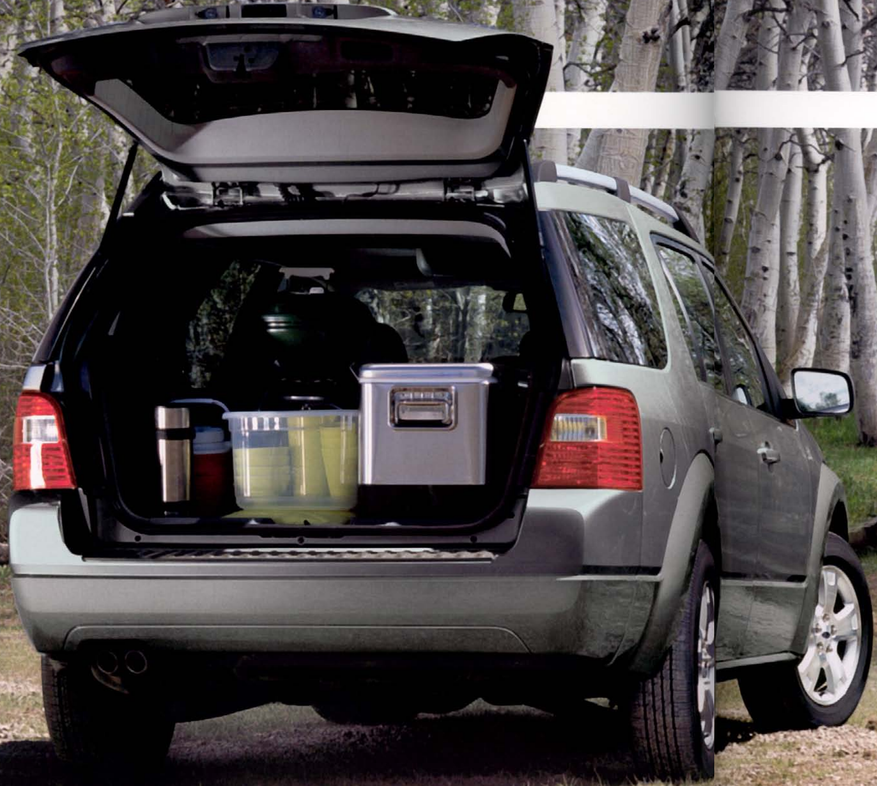
Freestyle SEL in Titanium Green Metallic with Graphite Metallic Cladding