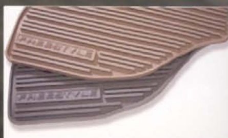
All-Weather Vinyl Floor Mats