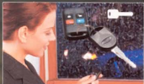
Remote Start System