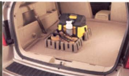
Cargo-Logic® Cargo Organizer