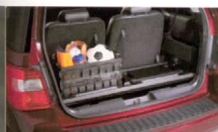
Rear Parcel Shelf