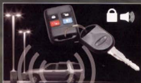
Vehicle Security System