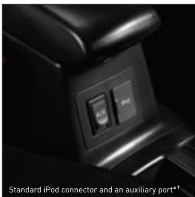
Standard iPod connector and an auxiliary port †

AM/FM/CD / maximum 160 watts of power / Six speakers (two tweets, four full-range) / Scion Sound Processing (SSP), tuned to the acoustic characteristics of the xB, xD, or tC / Sound Retouch (SRT) and Automatic Sound Levelizer (ASL) / Reads MP3, WMA, and AAC files / Programmable welcome messages / Both a standard iPod connector and an auxiliary port / Built-in pocket designed to hold a standard or nano iPod* / Satellite radio capability with accessory antenna**