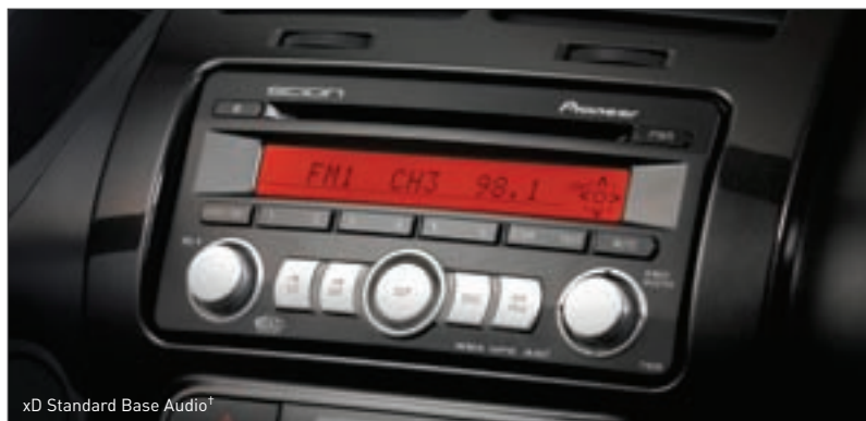
xD Standard Base Audio †

* iPod not included ** Satellite radio requires XM or Sirius compatible receiver and monthly service fee. See your Scion dealer for further details. Reception of the satellite signal may vary depending on location. All fees and programming subject to change. Subscriptions subject to the terms and conditions available at www.xmradio.com or www.sirius.com . Available only in the 48 contiguous United States. † Preliminary Interior Shown, Subject to Change