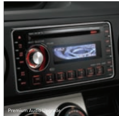
Premium Audio Upgrade

[See the xB, and xD sections for a complete listing of available accessories for each model]