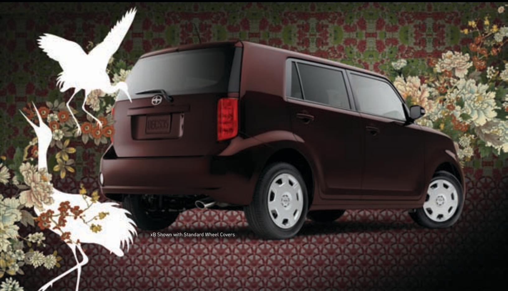
xB Shown with Standard Wheel Covers