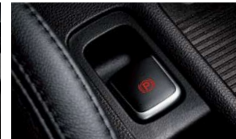
EPB (electronic parking brake) Engage the parking brake simply by pressing a button and take all of the guesswork out of knowing whether it's properly engaged or not.