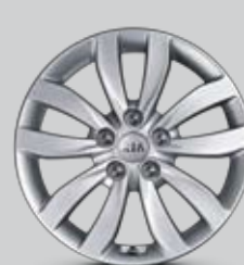
225/45R 17" Alloy Wheel