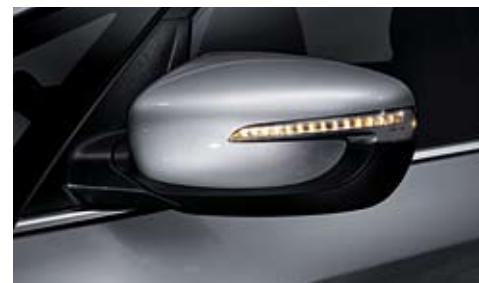
Side mirror Wing-type electric folding two-tone side mirrors feature LED turn signal lamps and puddle lamps for added safety and convenience.