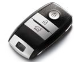
Remote keyless entry system The smart key unlocks the doors as soon as you touch the door handle so that you never have to worry about fumbling around for keys.