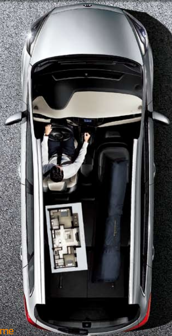
For me 1st row partial and 2nd & 3rd row full folding