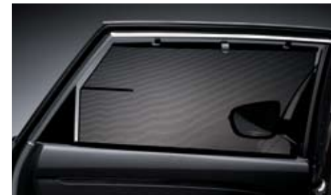
2 nd row sun blind The manually retractable sunshades for the 2 nd row windows provide protection from harsh sun glare and help to keep the cabin cool.