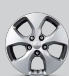
205/55R 16" Alloy Wheel