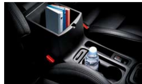
Center console Two drinks can be securely stored within easy reach while a center fascia undertray and large storage compartment under the center armrest provide plenty of space for storing personal items.