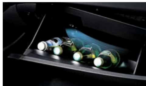
Cooled glove box The large 8L glove box has a cooling function that comes in handy when storing perishable items or cold drinks, especially on long journeys.