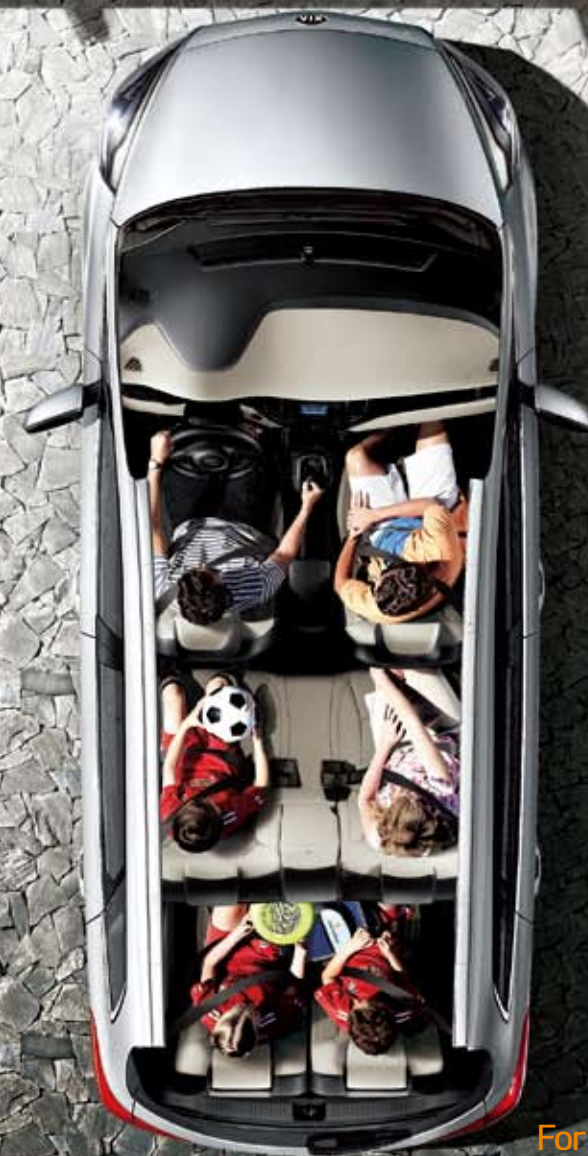
For the kids Seating for 7 people