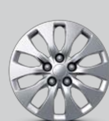
205/55R 16" Steel Wheel

A choice of four newly-designed wheels gives Carens maximum curb appeal.