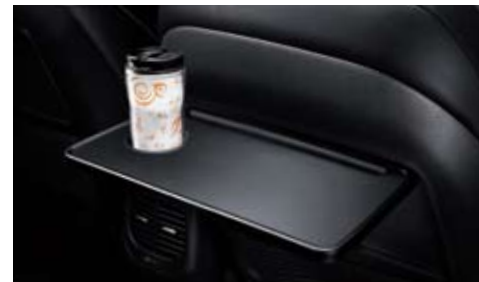
Fold-up tray The backs of both driver and front passenger seats are fitted with convenient trays that feature an additional cup holder for extra convenience of the 2 nd row seat occupants.