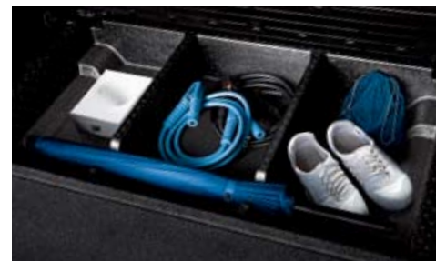
Cargo under storage compartment A spacious compartment located under the floor at the rear of the vehicle is the perfect place to store away emergency safety and cleaning supplies.