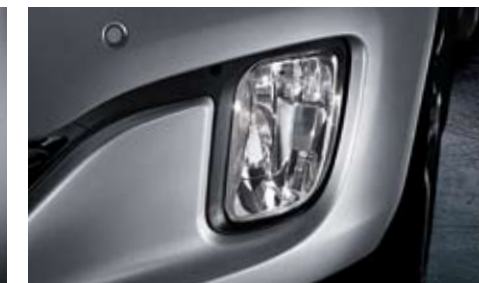
Fog lamps The fog lamps are stylishly integrated with the air intake holes of the front bumper using black housing to accentuate the car's athletic stance.