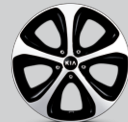
225/45R 18" Alloy Wheel * Not available in Gamma 1.6 GDI engine