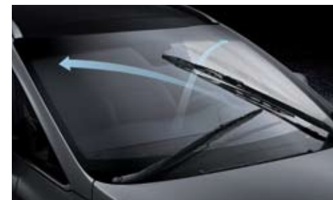
Opposed-type wiper system Unlike conventional wiper systems, the wiper blades are mounted on opposite sides of the windshield and move in the opposite direction for maximum visibility even in heavy rain and snow.