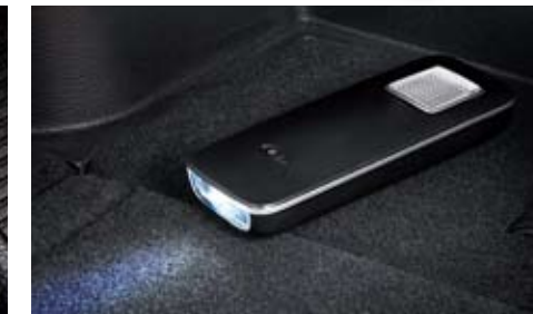
Portable flashlight When mounted on the wall socket, this handy detachable flashlight automatically recharges while also serving as an interior lamp for the cargo area.