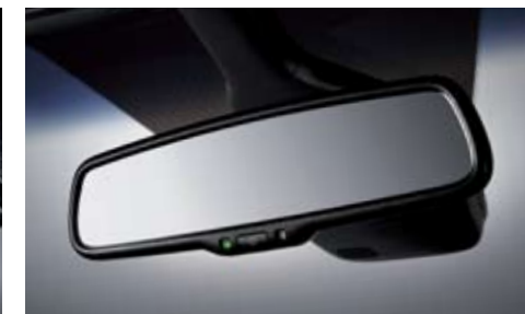
ECM mirror Distracting headlamps behind you are a thing of the past thanks to the auto-dimming, wide-angle electric chromatic mirror.