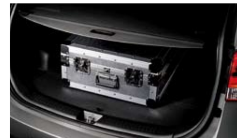
Cargo security screen Create a separate partitioned-off space at the rear of the vehicle to stow away any personally belongings that you want to hide from prying eyes.