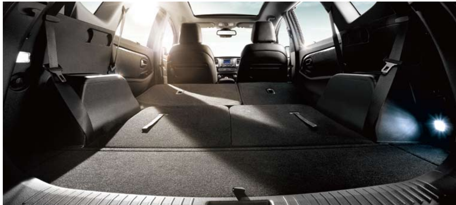
Spacious cargo room A walk-in sliding function on the outer 2 nd row seats enable occupants to easily access the 3 rd row seats with a light touch of a lever, while the luggage flat configuration for the 2 nd and 3 rd row seats provides expansive space for hauling all types of cargo.

We believe that the true measure of a groundbreaking car can be found in the details. And we're sure you'll be pleased to discover the numerous delightful surprises to found in every nook and cranny of new Carens.