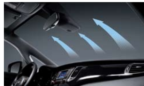
Auto defogging system A sensor automatically initiates a defogging process when condensation is detected on the windows to ensuring optimal visibility in humid climates.