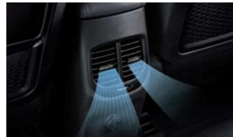
Rear air ventilation Back seat passengers can also enjoy warm or cool air circulation thanks to rear air vents positioned at the back of the center console.