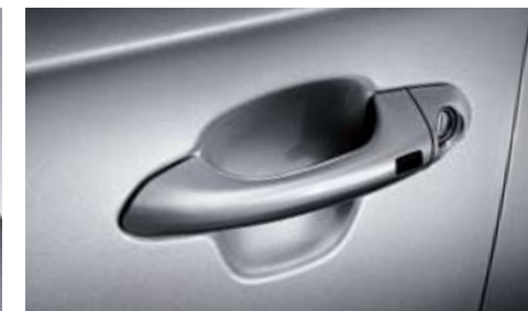
Outside door handle Body color grip-type handles come as standard, but for a more classic look you can also choose chrome-finished handles as an option.