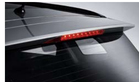
Rear spoiler / High-mounted stop lamp Standard on all models, the rear spoiler adds a sporty touch to the exterior design while a high-positioned stop lamp ensures that you are clearly visible to drivers behind.