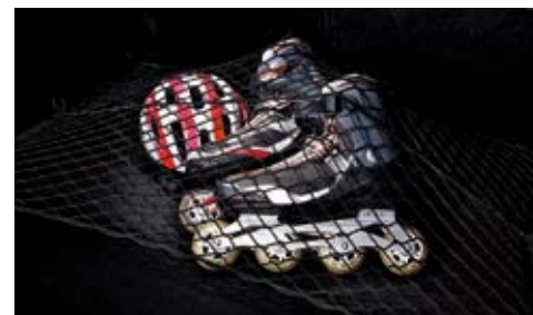
Cargo net A handy cargo net can be fastened using convenient hooks to prevent items such as sporting equipment from rolling around.