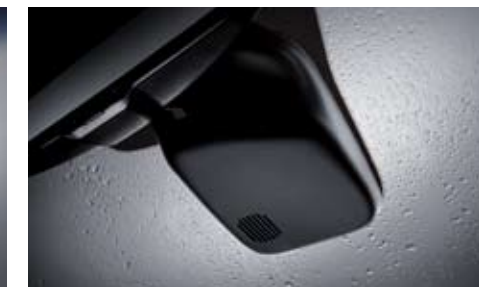
Rain sensor The windshield wipers are automatically activated as soon as moisture is detected for greater convenience and visibility.