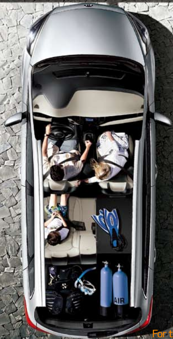
For the family 2nd row partial and 3rd row full folding

Live life to the fullest thanks to a level of cargo and passenger seating versatility that will push the limits of your imagination.