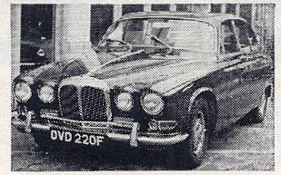
1968 DAIMLER Sovereign, maroon/beige, P.A.S., heated rear window, radio; beautifully kept by one owner..... £1,245

1967 ALFA ROMEO Giulia 1600 Sprint GTV Veloce coupe, red/black, new Cinturatos, heater, discs, Motolita wheel; absolute showpiece..... £995