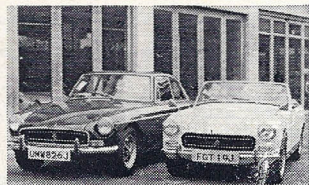
Left: 1971 (May 20th) M.G.-B GT, racing green/autumn leaf, o/d., heated rear window, Cinturatos; 715 miles only..... £1,495