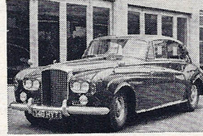
1963 (Aug.) BENTLEY S3, twin-head-lamp saloon, green/beige hide, automatic, P.A.S., radio. Luxurious appointments, four new tyres just fitted. Not many in this cond. £2,350