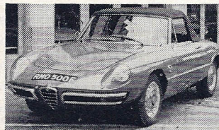
1968 ALFA ROMEO 1750 Spider Veloce drophead coupé, red/black; one doctor owner since new, 28,432 miles; radio, 5-speed box; quite unmarked. £1,445

1968 MORRIS Mini Minor, 998 c.c., Mk. II, super de luxe, almond green, heater; one owner..... £465