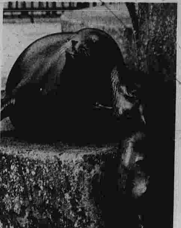
ONE'S LIPS ARE SEALED and the other is lippy in this scene at Central Park Zoo in New York.