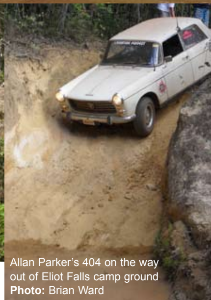
Allan Parker's 404 on the way out of Eliot Falls camp ground

our first serious water crossing. We all made it through with some 'exciting' moments. Headed along a very bumpy track to our bush camp then after erecting tents, rewarded ourselves in the very welcome falls.