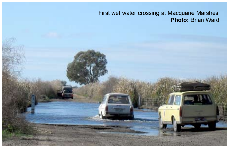
First wet water crossing at Macquarie Marshes