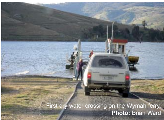
First dry water crossing on the Wymah ferry.

After a detailed talk on the history and operation of Willis Retreat we headed to the Big Terrigal Creek bird viewing hide and on the way we forded