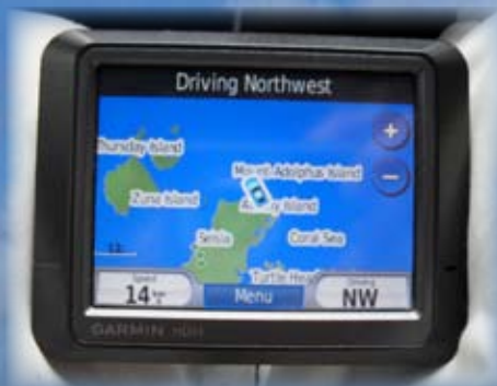
GPS proof that we had reached The Tip