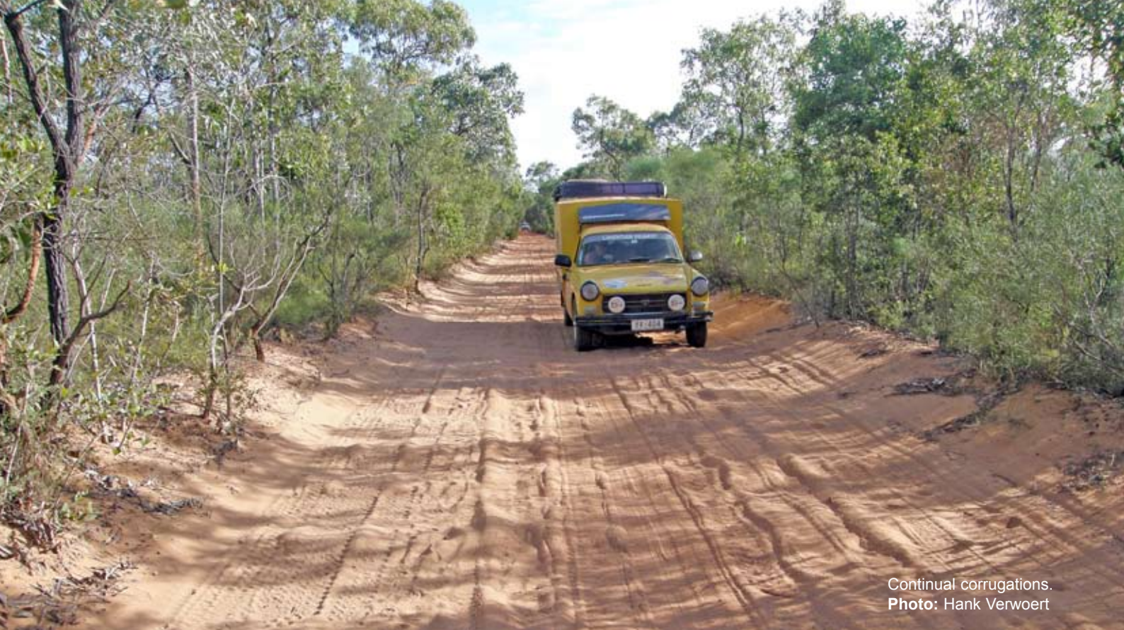
Continual corrugations.

our destination, the Hann River Roadhouse enjoying the remainder of the afternoon swimming, walking, reading and relaxing. Our first campfire of the trip concluded a great day.