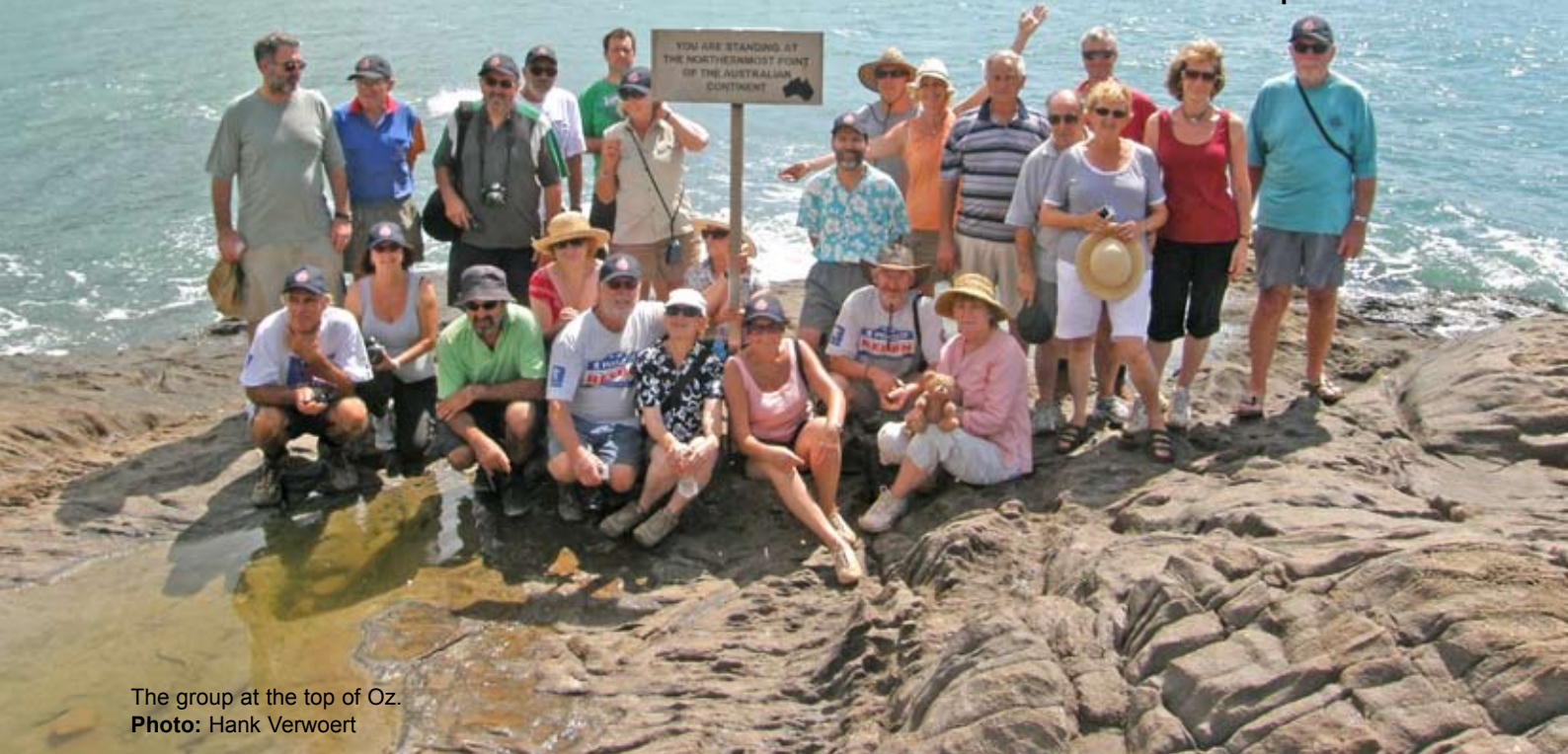
The group at the top of Oz.