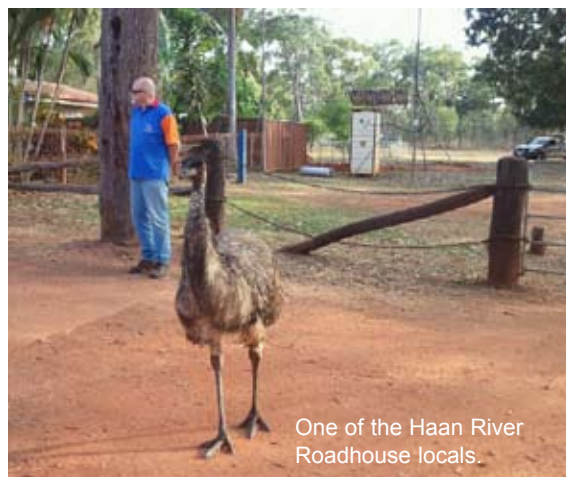
One of the Haan River Roadhouse locals.