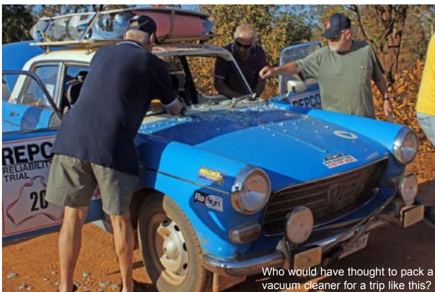
Who would have thought to pack a vacuum cleaner for a trip like this?