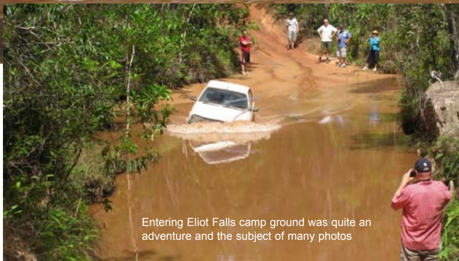
Entering Eliot Falls camp ground was quite an adventure and the subject of many photos