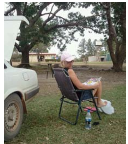
Relaxing at Archer River Roadhouse

bridge were highlights of this small bauxite mining town of Weipa.