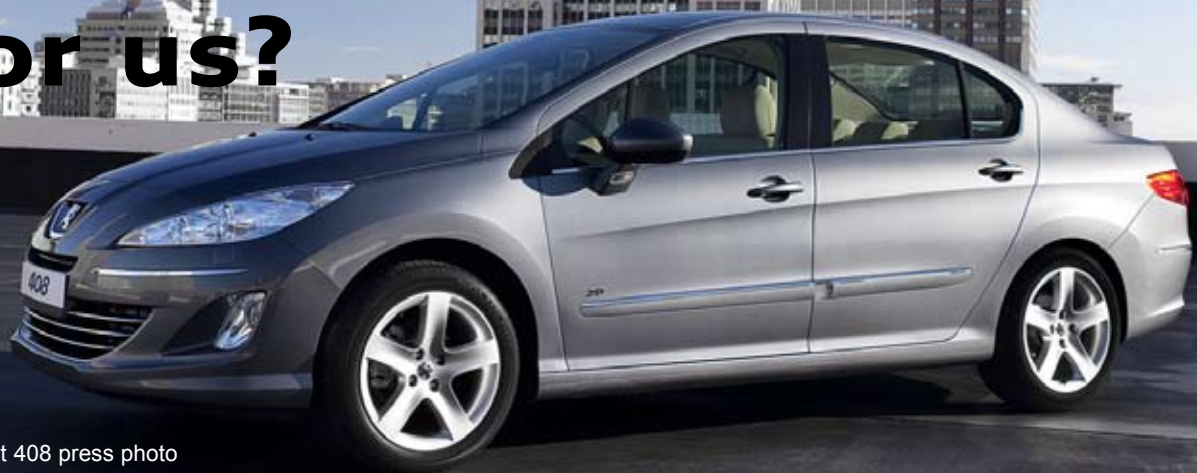
Peugeot 408 press photo

AS NEWS EMERGED that Peugeot was looking at producing the 408 sedan in right-hand drive form in Malaysia for export to Australia, a club member has tracked down and photographed the Chinese model.