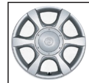
SLE V6 standard 16" aluminum alloy wheel