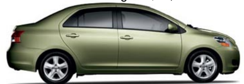
4-Door S Sedan 4-Speed Automatic (1452) MSRP** Starting At: $14,250.00