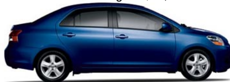
4-Door S Sedan 5-Speed Manual (1451) MSRP** Starting At: $13,525.00