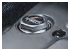
TRD Oil Filler Cap (S, LB) $57.00