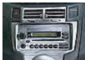
AM/FM/CD Player Base Grade (S, LB) $445.00