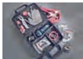
Emergency Assistance Kit (S, LB) $70.00