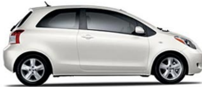
3-Door Liftback 5-Speed Manual (1421) MSRP** Starting At: $11,150.00