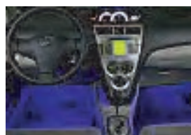
Interior Light Kit - Blue (S, LB) $275.00