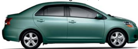
4-Door Sedan 4-Speed Automatic (1442) MSRP** Starting At: $12,750.00