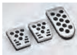
Sport Pedal Covers (S, LB) Automatic - $82.00 Manual - $92.00