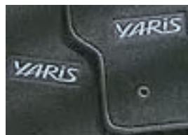
Carpet Floor Mats (S, LB) 5-piece set $150.00