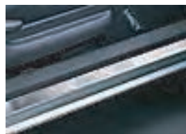
Door Sill Enhancement S - $95.00 LB - $159.00