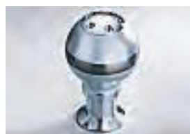
Sport Shifter Knob (S, LB) $65.00