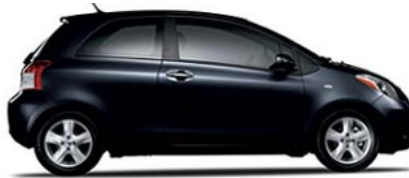
3-Door Liftback 4-Speed Automatic (1422) MSRP** Starting At: $12,050.00