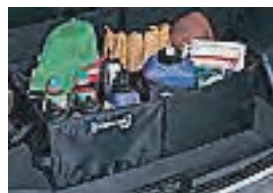
Cargo Tote (S, LB) $40.00