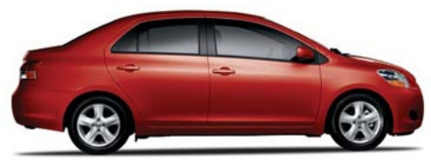
4-Door Sedan 5-Speed Manual (1441) MSRP** Starting At: $12,025.00