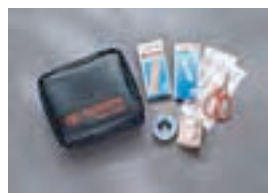
First Aid Kit (S, LB) $29.00