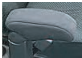
Center Arm Rest (LB) $129.00