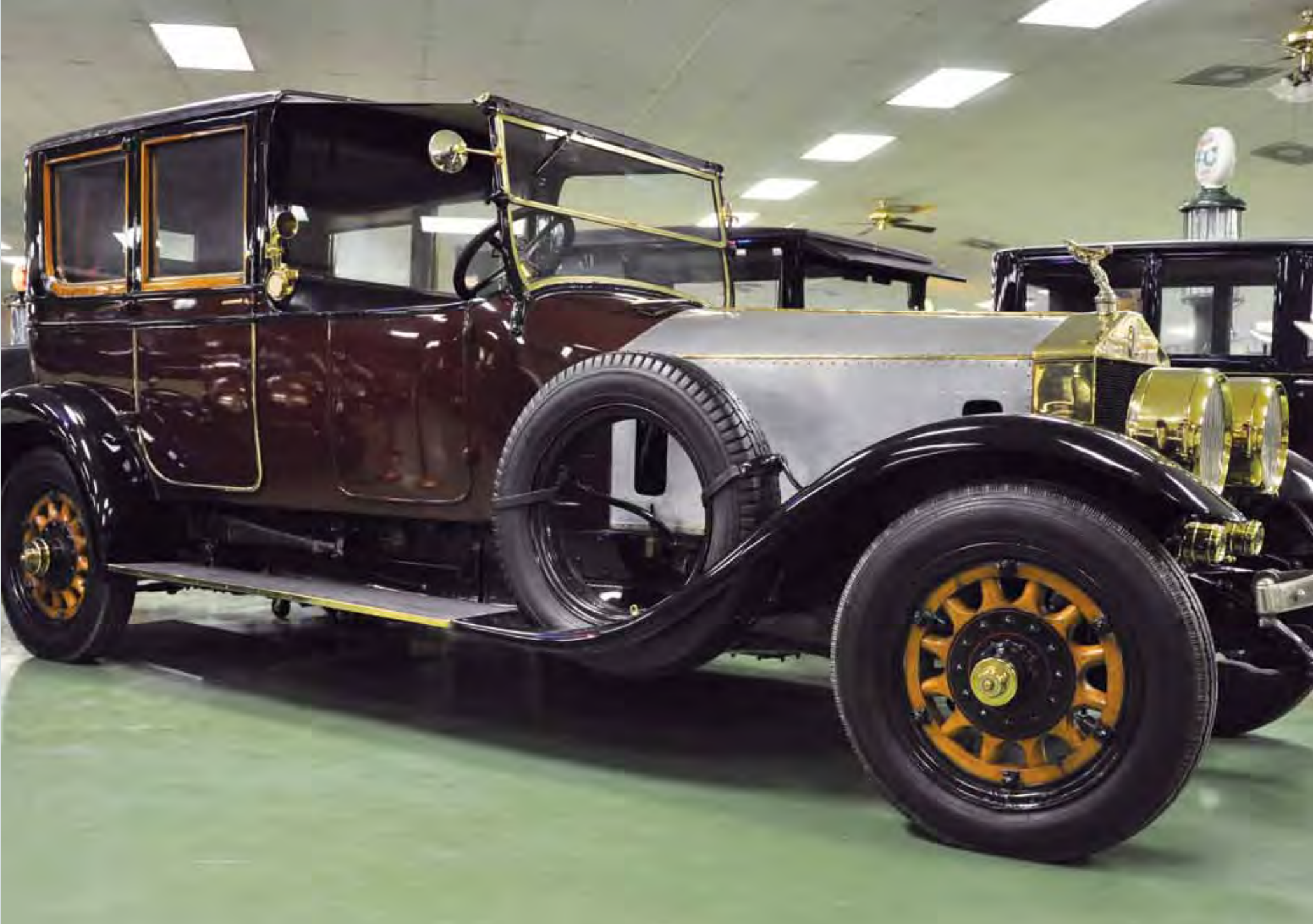
1913 Rolls-Royce Silver Ghost Town Car by Brewster