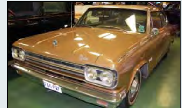
LOT NO. 93 1966 AMC Marlin Two-Door HT FB

17/32 HP, 144.6 cid L-Head In-Line 6, 3-Speed Transmission