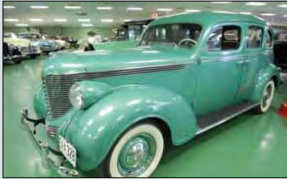
LOT NO. 89 1938 DeSoto Model S-5 Custom Four-Door Touring Sedan "The Unknown DeSoto"

93 HP, 228.1 cid, 2.1 Liter Side Valve In-Line 6-Cylinder Engine, 3-Speed Transmission · Engine No. S5-36487