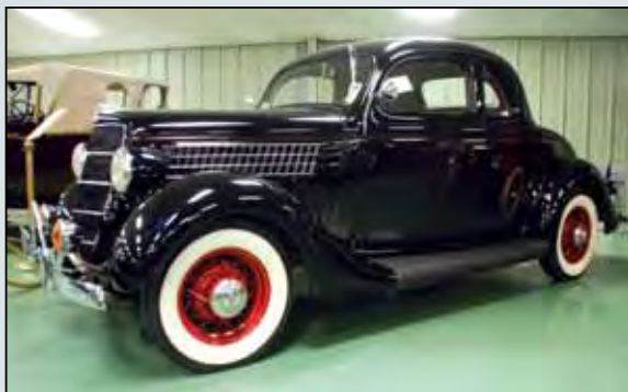
LOT NO. 41 1935 Ford Model 48 Two-Door 5-Window Coupe

85 HP, 221 cid, L-Head V-8 Engine, 3-Speed Transmission Chassis No. 18-2044063