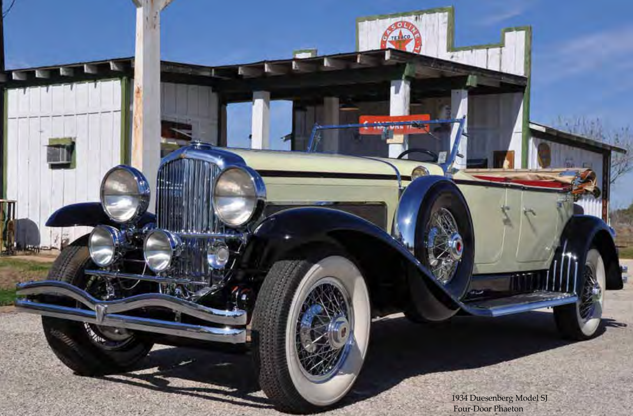
1934 Duesenberg Model SJ Four-Door Phaeton in the Style of Derham