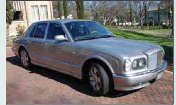
LOT NO. 91 2000 Bentley Arnage Four-Door Sedan

100 HP, 239.4 cid 1948 Mercury V-8 Engine, 3-Speed Transmission