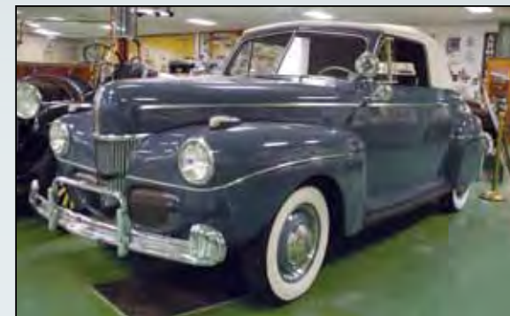
LOT NO. 43 1941 Ford Super Deluxe Two-Door Club Coupe

Finished in a deep rich Burgundy on the exterior, with dark Saddle brown seat covers and door panels while the dashboard plus garnish molding is done in a light bluish gray color scheme. Extras include vintage fog lights and a rare front bumper guard, bumper tips, and wide whitewall tires accented by bright trim rings and hubcaps. The big news on this rare car is what is under the hood. Vintage speed equipment had been applied to the original flathead V-8 including Weiand heads and intake manifold which is teamed up with a trio of Stromberg 97 carburetors. The electrical system has been up graded to 12 volts for easier starting and stronger light for evening drives. A rather interesting car to be sure, can you really remember one of these was offered at auction.