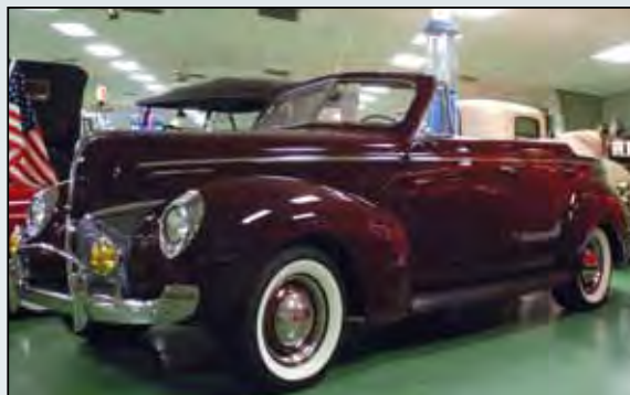
LOT NO. 42 1940 Mercury Eight Series 09A Four-Door Convertible Sedan

This smart little coupe is finished in gloss black with red wire spoke wheels that wear 8.00" x 16" tires. The interior is upholstered in tan mohair and there are a few accessories on this car. Bumper mounted fog lights start the show, with the enclosed rear mounted spare tire. The trunk is absolutely huge, just about big enough to hide an elephant. This coupe appears to have been given a cosmetic restoration a while but there is some patina of age found on some of the bright work and even the carpeting on the passenger cabin. One of the most sought after early V-8 Fords, this little coupe would look great in the collection of any fans of this marque.