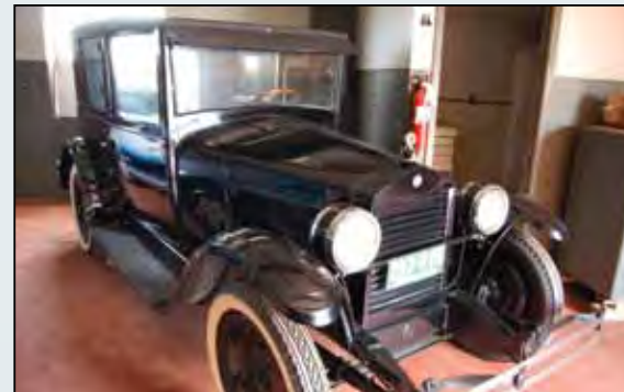
LOT NO. 92 1925 Essex Four Two-Door Coach

400 HP, 411.9 cid Turbocharged V-8 Engine, 5-Speed Automatic Transmission