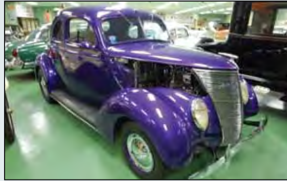
LOT NO. 90 1937 Ford Custom Coupe Street Rod

100 HP, 239.4 cid 1948 Mercury V-8 Engine, 3-Speed Transmission