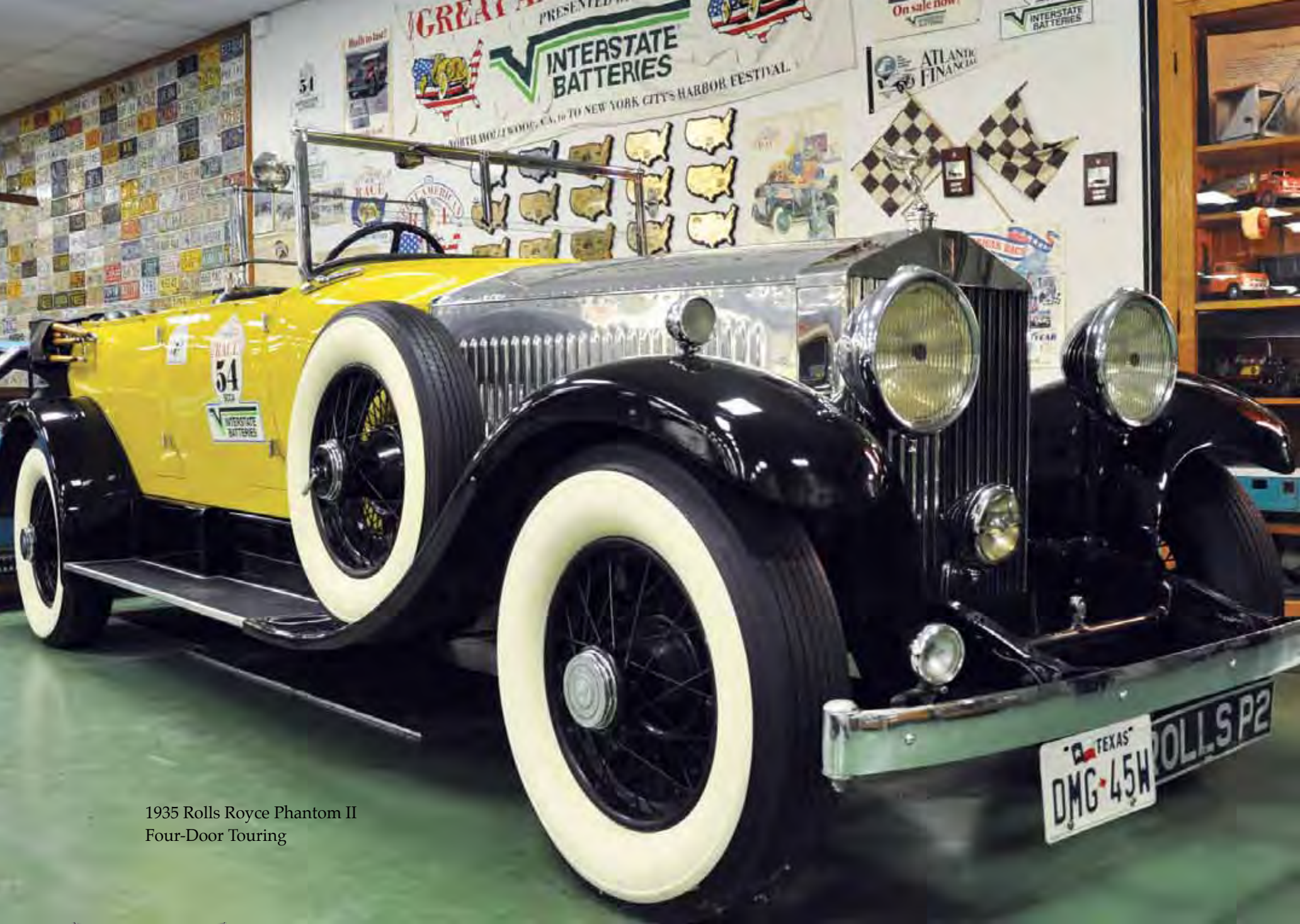
1935 Rolls Royce Phantom II Four-Door Touring