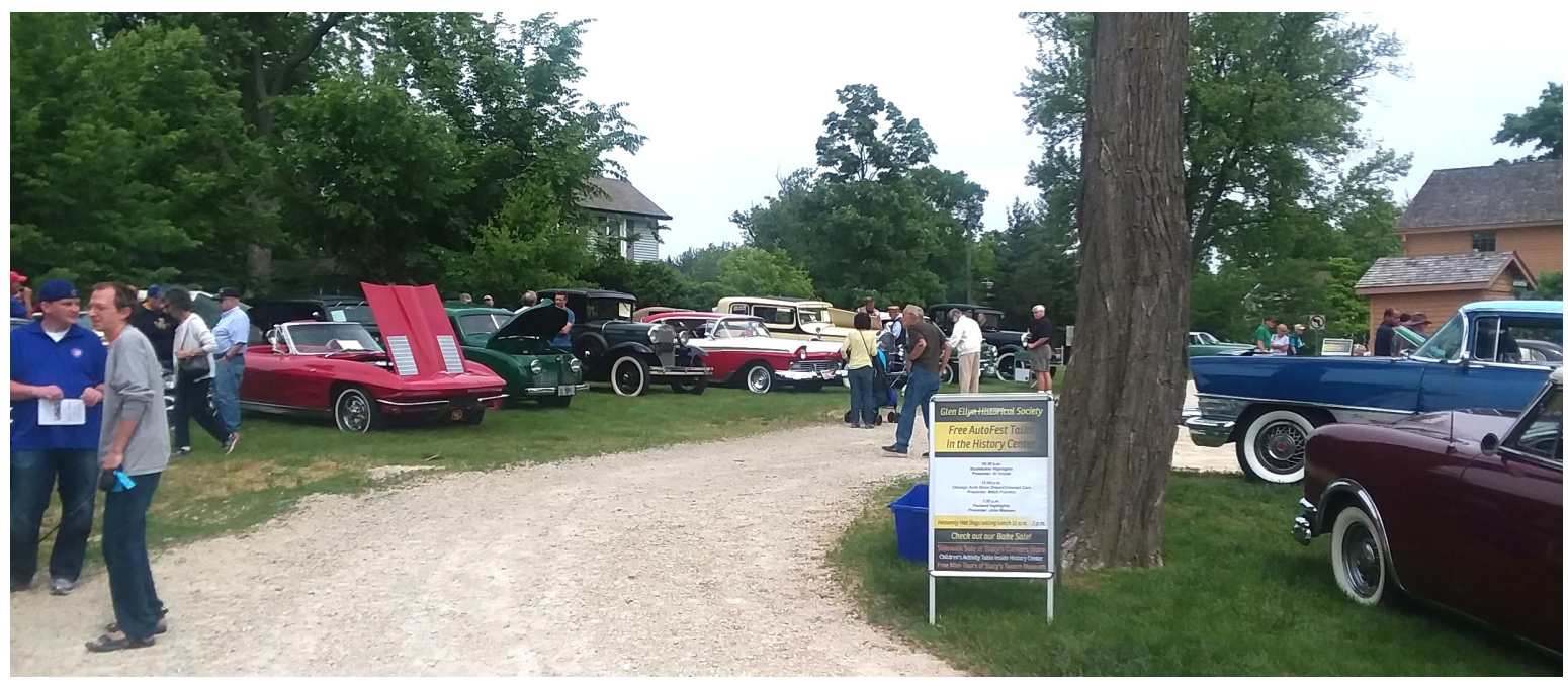
SDC Black Hawk Chapter Studebakers at the Glen Ellyn Vintage Auto Fest at the Glen Ellyn History Center