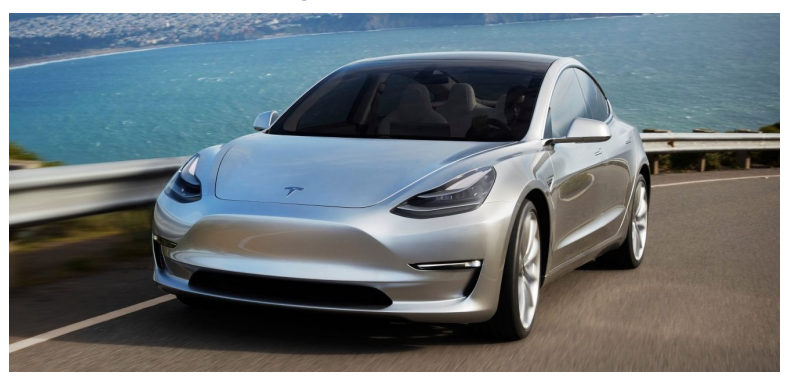
DIFFERENT BY DESIGN - The New "All Electric" 2018 Tesla Model 3 Sedan

rest. "Different By Design" so to speak. The Tesla couple (man & wife) we met have owned their Model S for the past 40,000 miles. They claimed the advantages primarily were low maintenance costs and every fill-up/charge costs them around 4 dollars give or take. They explained to us that there are many more charging stations than one can imagine and the Model S tells them where the charging stations are. Mostly they charge at home. I asked if I could take my family to Disney easily from Chicago in a Tesla and they commented that it would be a rather easy trip from a charging aspect. They have driven on some fairly long family trip's in their Tesla Model S.