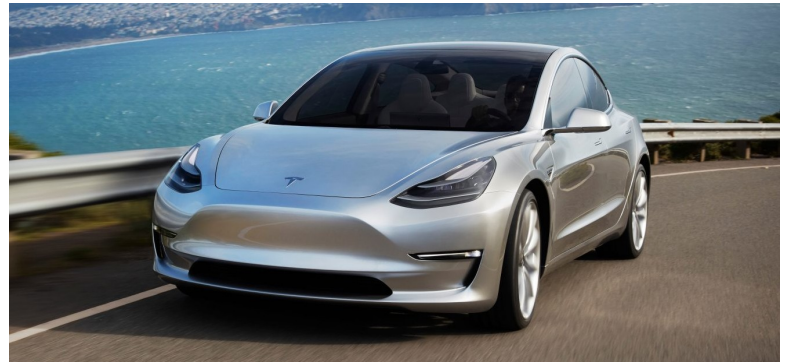
DIFFERENT BY DESIGN - The New "All Electric" 2018 Tesla Model 3 Sedan

rest. "Different By Design" so to speak. The Tesla couple (man & wife) we met have owned their Model S for the past 40,000 miles. They claimed the advantages primarily were low maintenance costs and every fill-up/charge costs them around 4 dollars give or take. They explained to us that there are many more charging stations than one can imagine and the Model S tells them where the charging stations are. Mostly they charge at home. I asked if I could take my family to Disney easily from Chicago in a Tesla and they commented that it would be a rather easy trip from a charging aspect. They have driven on some fairly long family trip's in their Tesla Model S.