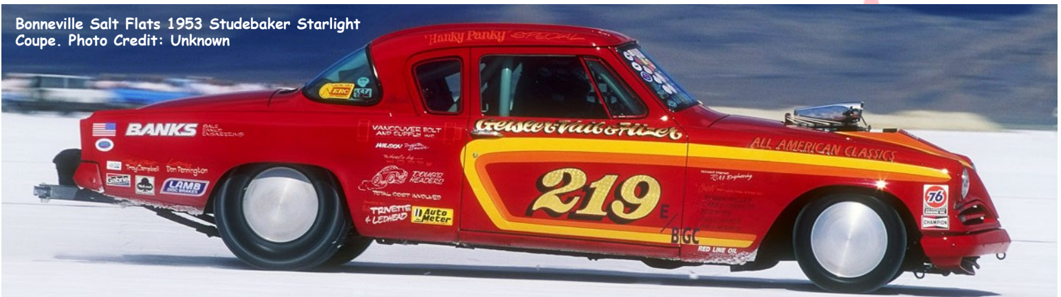
Bonneville Salt Flats 1953 Studebaker Starlight Coupe.

Motion to Adjourn: Don asked for a motion to adjourn. A motion was made and seconded and the meeting was adjourned.