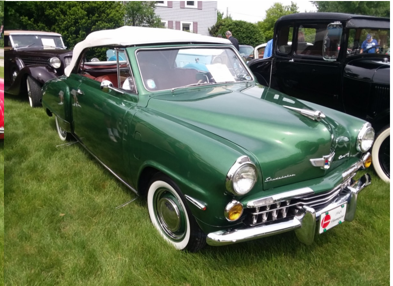
BHC - Jack VanEck's 1947 Champion Convertible