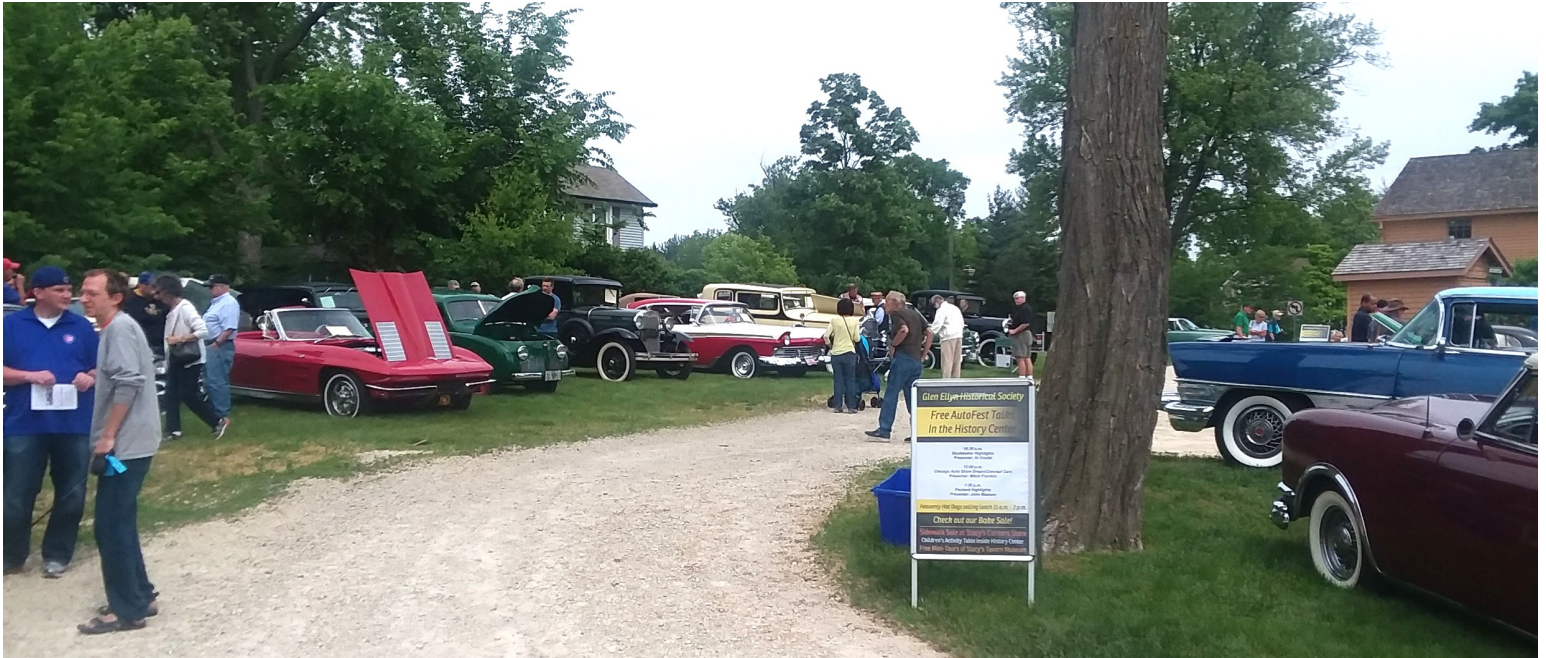
SDC Black Hawk Chapter Studebakers at the Glen Ellyn Vintage Auto Fest at the Glen Ellyn History Center