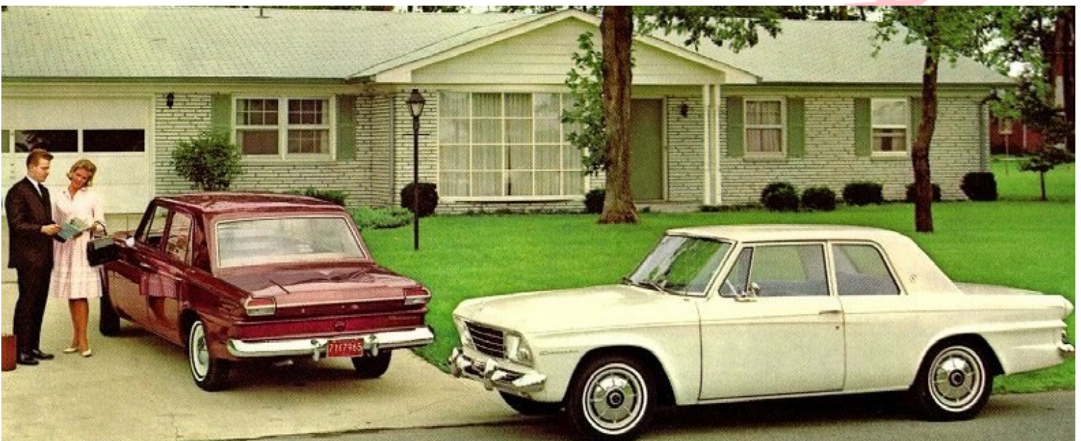
The Classic American Dream - Archetypal '60's Suburbia Replete With a Couple of 1965 Studebakers, a Young Couple & Ranch Style Home!