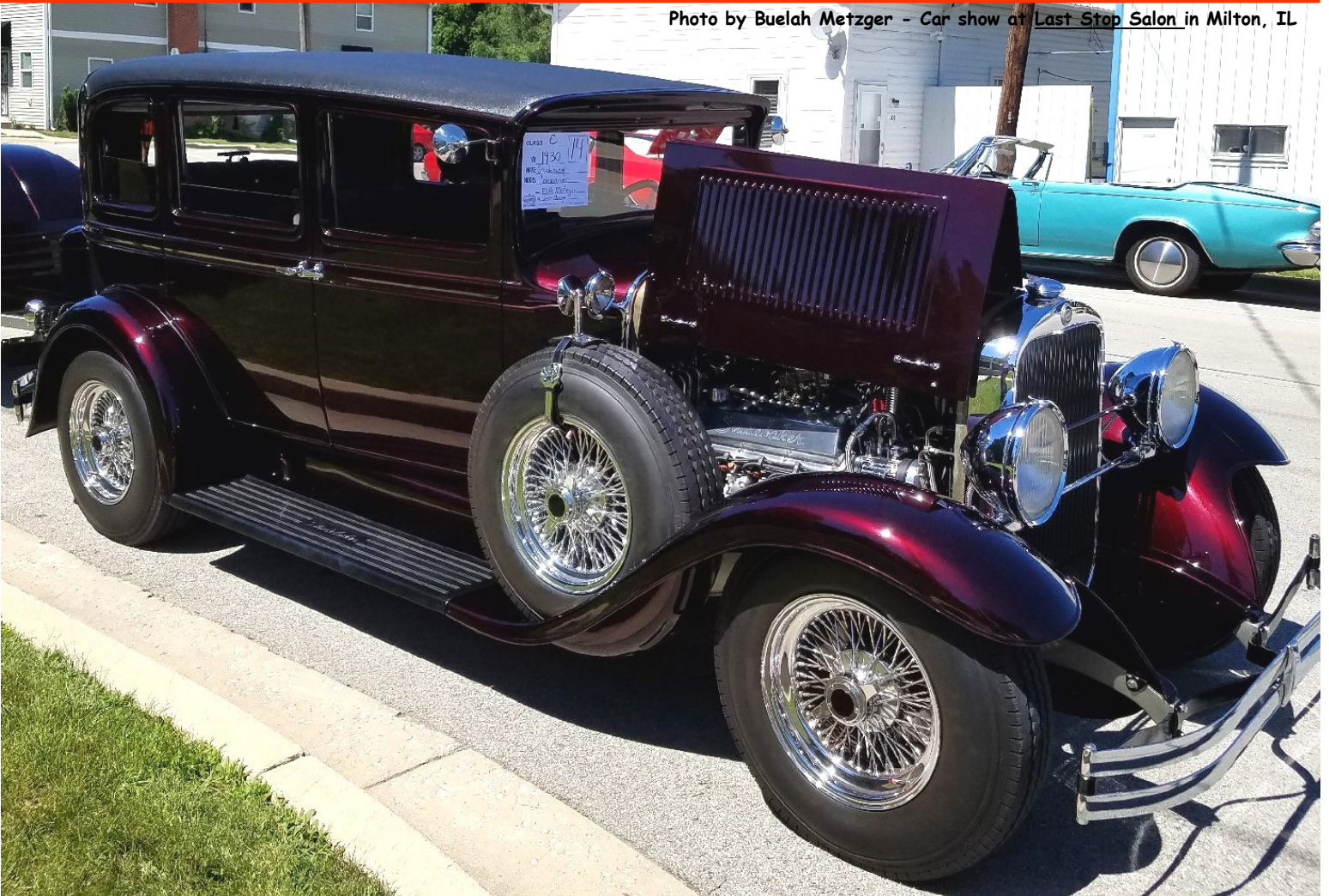
Car show at Last Stop Salon in Milton, IL

"WELCOME TO ALL OF OUR NEW BLACK HAWK CHAPTER OFFICERS"