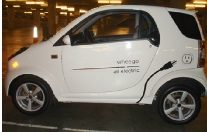
Wheego's LiFe capable of tackling L.A. roads, traffic.

By keeping the lines of communication open and educating Wheego customers, those same people “are going to become our best sales people.”