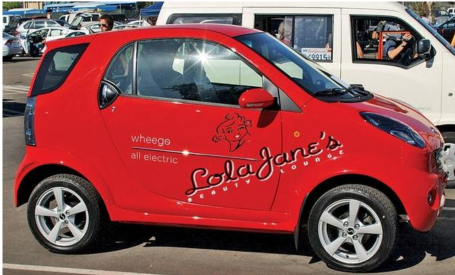
A St. Petersburg, Fla., beauty salon owner uses a Wheego Whip from Suncoast Electric Vehicles to promote her business.