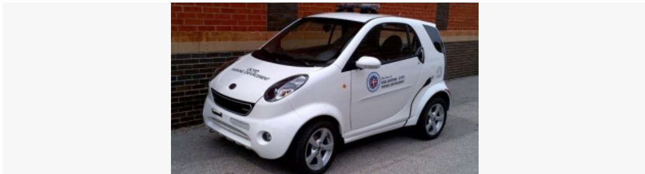
CALLING ALL ELECTRIC CARS: This Wheego LiFe is on parking ticket duty in Oklahoma City.

For the start-ups, selling unfamiliar electric cars to Americans means a lot of guerrilla marketing. That's why Coda and Tesla are opening stores in malls, and Wheego is co-sponsoring contests and selling into police fleets.