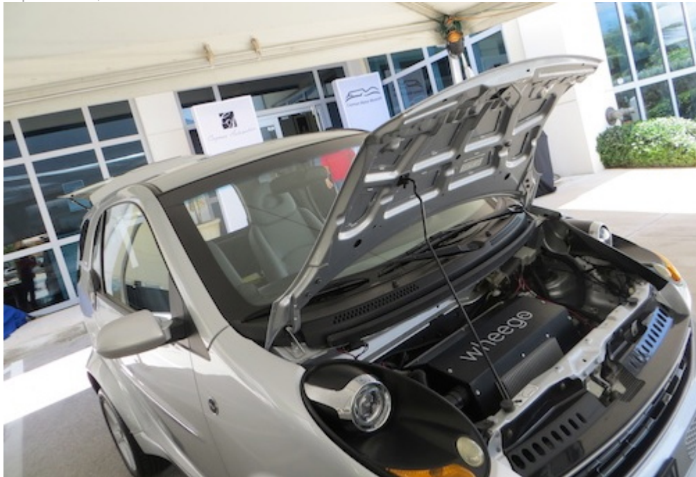
Above: the Wheego LiFe