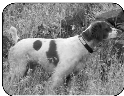
SPANISH CORRAL'S SUNDANCE KID