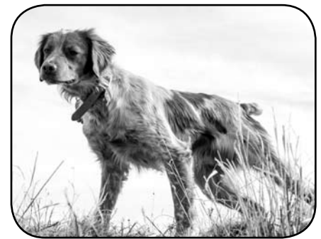
LEAVE EM IN THE DUST GUS