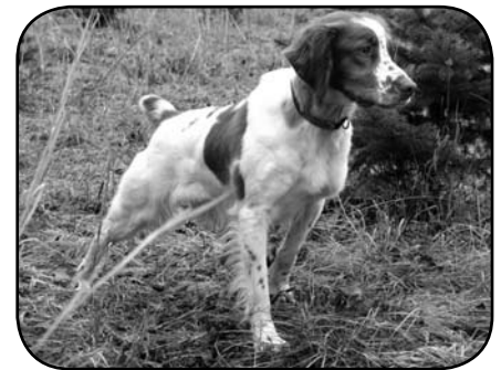
REIDYHILL'S CISCO JANE