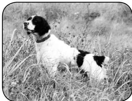
GROUSEWOOD REMADA OMBUDSMAN