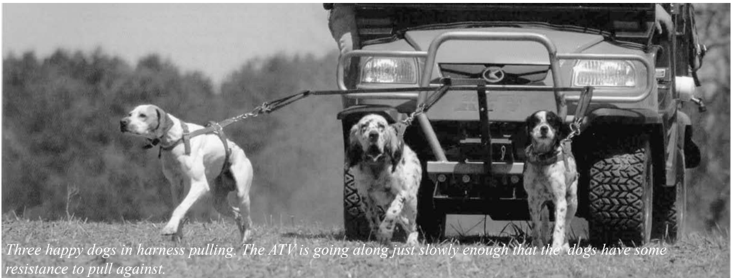
Three happy dogs in harness pulling. The ATV is going along just slowly enough that the dogs have some resistance to pull against.