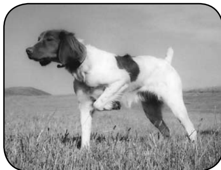
HIGH HOPES LITTLE ANN