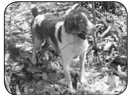
DOUBLE TRIGER JOSEY