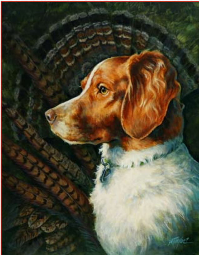
"Ready and Waiting", a head study of an alert Brittany, dreaming of Opening Day. The game bird feathers represent the visions in its mind... Original painting is acrylic on board; both the original and limited edition prints are available.