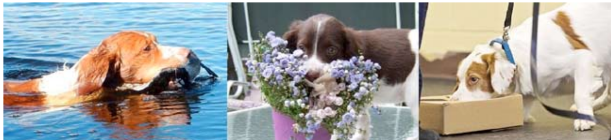
Left: Deef retrieving a duck. Centre: Vite smelling the flowers © Hunter's Heart Kennels. Right: Boo indicating target odor with a nose touch © Furever Reflections 2015.

Many Brittanys love to retrieve, but in canine nosework this can be problematic. One inspiration of Nosework is bomb detection training, where biting and retrieving are unsafe ways for a dog to indicate the presence of explosives. Accordingly, in nosework, “aggressive” behaviors such as biting and chewing are undesirable and may be faulted. Retrieving is not the best way for a dog to show the location of the target odor, especially when it’s in an inaccessible location such as 6 feet up on a light post, or inside a cabinet. I’m frequently asked how to prevent dogs from retrieving in nosework, and this article will offer some tips that have worked for many of my students.