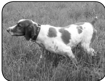
THE HOLIDAY KID