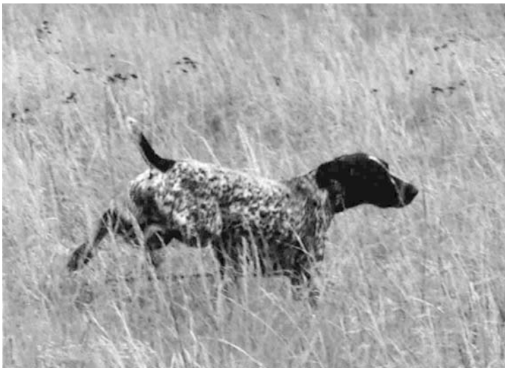
This young shorthair is running alongside an ATV in the field.

differentiate between pulling and leading. Sprints get the heart-rate up, and long, slow distance work increases stamina. Again, if you've got an ATV, just turn your dog loose to run with you as you ride it. A bicycle will also work well, and if your dog has to be on lead while you do this, with a little practice it can be accomplished. Whatever you do, though, never tie your dog hard and fast to you or to anything else while working at speed. The chances for injury should the dog stumble and get in the path of the ATV, pull you over sideways on your bike, as well as other potential injuries are there if the dog is firmly attached.