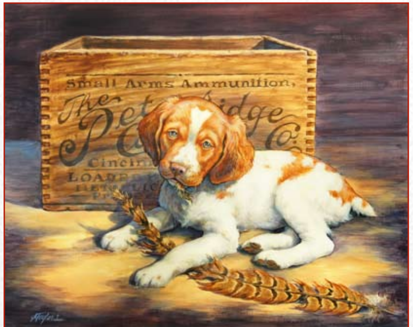
"Taste of the Future", depicting the guilty innocence of a Brittany puppy caught chewing up his master's pheasant feather. The background is a vintage Peters shotshell box. The original and prints are available.