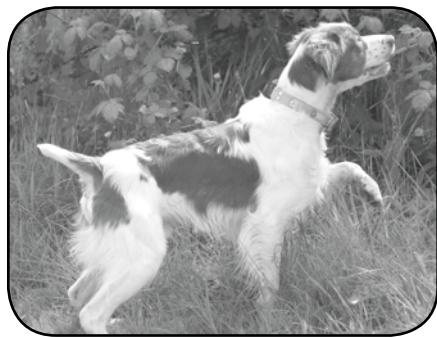
TIMBERLINE'S LONE RANGER