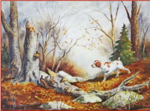
"October--Brittany and Grouse", limited edition print from my watercolor painting of 1982. It was the cover (in black and white) of both "American Brittany" and the "Ruffed Grouse Drummer" that year. Prints available.