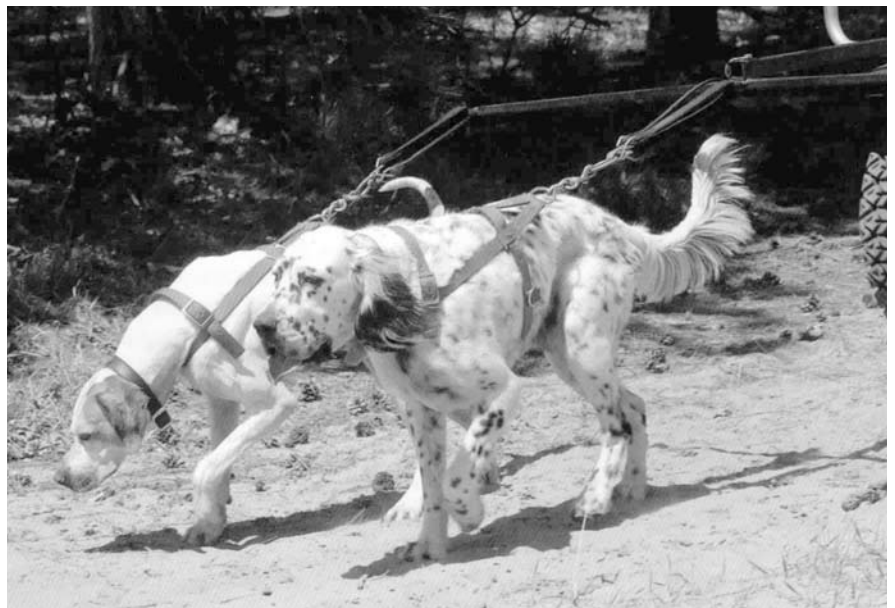
A close-up of the dogs in harness. Note the distance between the ATV and the dogs, for safety, and the rubber bungee cords attaching the harnesses to the ATV.

Now we can replay our scenario of opening day, and we have a dog that has the energy to hunt hard with much less fatigue. Our only hope is that we're fit enough to hunt as long as the dog is!