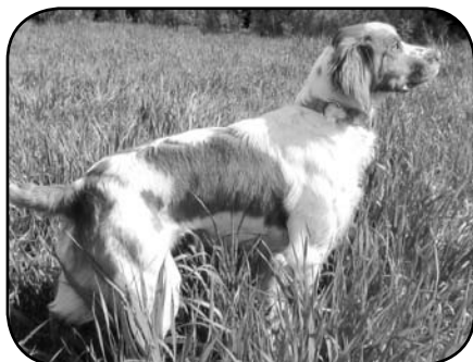
SWEETWATER MURPH'S A GAMBLER