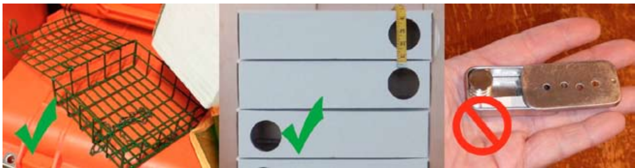
Left: DO use a metal suet container. Centre: DO use a box with a round hole. Right: DON’T use a small tin unless it’s firmly adhered. Use glue dots and 3 rare earth magnets.

Rather than correcting the dog in any way for putting his mouth on the target odor, a strategy that generally helps deal with this issue while maintaining enthusiasm is to package and position the target odor in a way that discourages retrieving. For example, avoid hiding odor in soft objects such as socks, cloth bags, pipes and cylinders, balls, and soft toys, and look for ways to hide odor such that it makes retrieving unappealing and less likely.