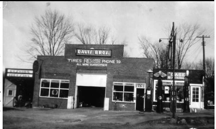
Davis Bros. — circa 1946 (Located two blocks south of the Ava Square on Jefferson St.)