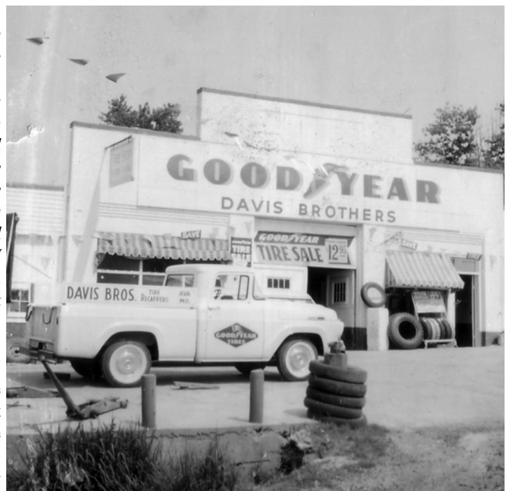
Davis Brothers Tire Company — Around 1959