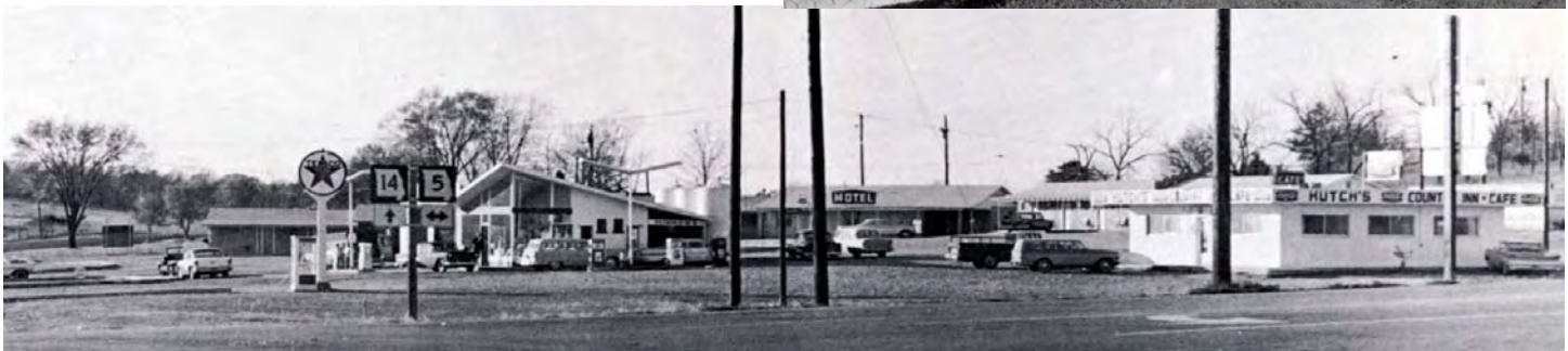
Davis Corners — Ava, MO — ca 1963

(Copied from a photo in the 1963 Annual Report of the Missouri State Highway Commission)