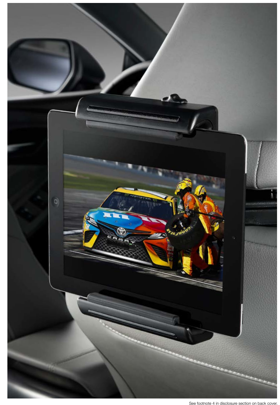
See footnote 4 in disclosure section on back cove