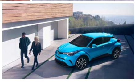
Genuine Toyota Accessories: Inspiration as limitless as all outdoors.