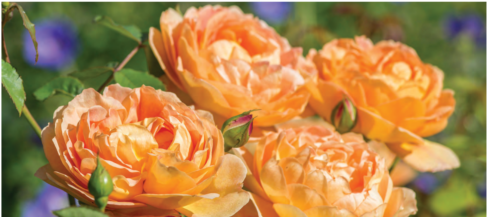
Lady of Shalott, located in David Austin English Rose section

HYBRID TEA GRANDIFLORA FLORIBUNDA SHRUB RUGOSA CLIMBING ENGLISH MINIFLORA MINIATURE PATIO TREE MINIATURE TREE