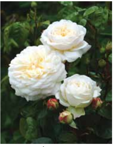
TRANQUILITY <sup>+</sup>, Hints of creamy yellow on buds that open to pure white in perfect rounded rosettes. Light apple fragrance. Very upright, disease resistant, and nearly thornless stems. Good for borders and hedges......$29.99

WOLLERTON OLD HALL <sup>↑</sup>, Climber. One of the most fragrant English roses, with distinct myrrh scent. Plump buds open to buttery-yellow blooms with tints of apricot, then pale to soft cream. Upright canes with few thorns, suitable as a short climber. ✓......$29.99