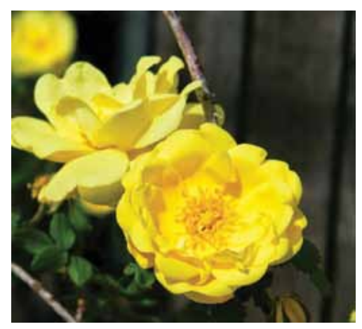
YELLOW BLAZE, Repeating clusters of showy, bright yellow flowers on polished, glossy green leaves. NEW...... $24.99