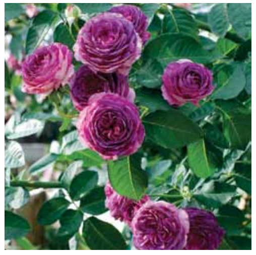
LAVENDER CRUSH™, Lavender w/ cream reverse. Classic roses on arching branches.Strong Citrus Fragrance. Heat Tolerant. Good Disease Resistance. Ht. 5-7' ➤ NEW $24.99