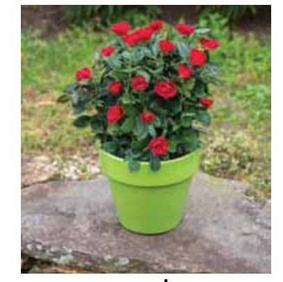
PETITE KNOCK OUT® , The Petite Knock Out® Rose is the first-ever miniature Knock Out® Rose! It has the same flower power and easy care as other in the family, but in an adorable, petite size! Plant in decorative containers for your porch or patio, or in mass for a dramatic pop of color. Fire-engine red bloom on dark, glossy foliage. NEW 2021 . . . . . . $24.99

LEMON DROP <sup>+</sup>, This sweet piece of lemony eye-candy looks much like its parent, Gingerbread Man—loads of old-fashioned formed flowers, lots of bright green clean leaves, long-lasting color, good vigor and attractive habit. The clear lemon yellow blossoms come in showy clusters. Color intensifies in cooler weather .......$24.99