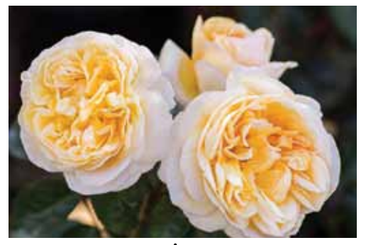
MOONLIGHT ROMANTICA® †, Hybrid Tea. This rose displays large light yellow fully double fragrant blooms. ₩.........$24.99

MIDAS TOUCH<sup>TM</sup> , Hybrid Tea. Long-lasting, stunning neon yellow color. Vigorous, productive with fruity fragrance. 1994 AARS winner..... $24.99