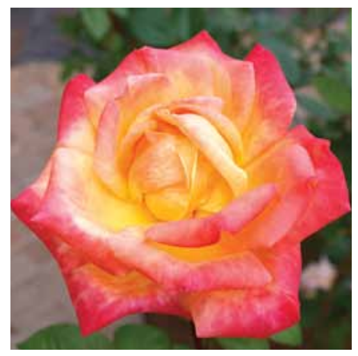
ARIZONA, Grandiflora. With all the colors of a sunset seen while driving across Arizona. Perfect blooms whose coloring is a blend of striking orange, bronze and rich gold. A strong upright bush with glossy, rich green leaves. Strong sweet fragrance. ↓ NEW. $24.99

ANNA'S PROMISE®, Grandiflora. The first in the "Downton Abbey" Collection. Double blooms in a golden-tan with pink blush and a copper-orange reverse. Fruit and spice scent........$27.99