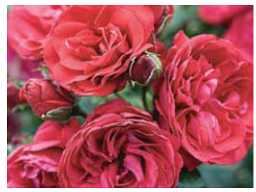
CRIMSON SKY <sup>TM</sup> <sup>+</sup>, This fire engine red climber will make a vibrant statement in the garden. Its abundant flowers do not fade. Crimson Sky is a sister seedling of the widely planted Red Eden. It blooms earlier and is quicker to establish than its famous sibling. NEW...... $27.99

COLETTETM <sup>+</sup>, An old-fashioned, heavenly damask scented, pink bloomer. Extremely disease resistant. W .......$24.99