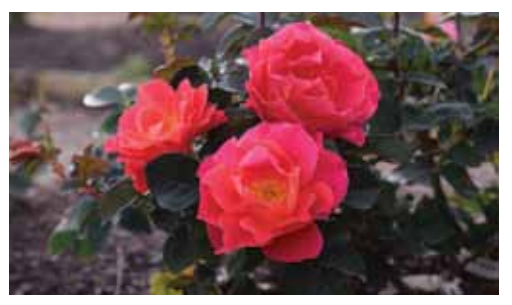
CORAL MIRACLE™ Shrub. Salmon pink double blossoms are the cat's meow on this coral-colored cousin to the shrub rose star, Miracle on the Hudson. The bushy rounded plant is the perfect planting complement to its velvet-red cousin. An abundance of dark green leaves make the clusters of coral colors sing in the garden. NEW 2021.......$24.99

BONICA® <sup>+</sup>, Shrub. Clusters of beautiful shell-pink flowers from late spring to frost. Tough & vigorous. 1987 AARS winner..... $24.99