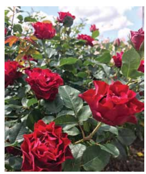
DANCING IN THE DARK™, Floribunda. Intense deep red blooms developing to almost black with a bushy upright habit. A head-turner in any garden......$24.99

FIRE MEIDILAND® † , Shrub. Bright red color. Excellent for mass planting and erosion control on slopes and banks with it's low, spreading habit......$24.99