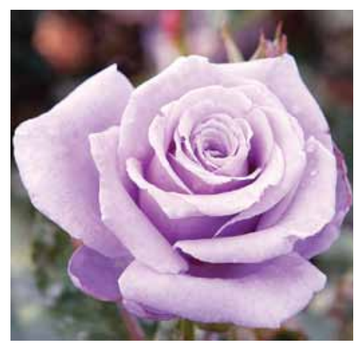
STERLING SILVER, Hybrid Tea. Lavender blooms with silver undertones. Strong citrus scent and nearly thornless plants are an added bonus. ♥......$24.99