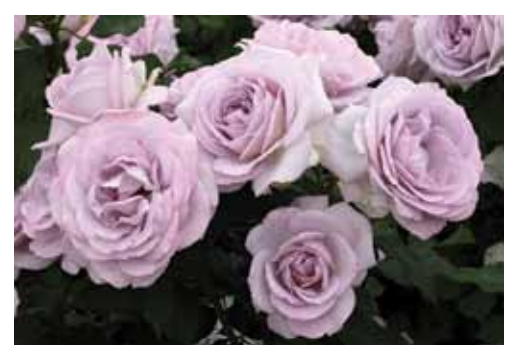
SILVER LINING<sup>TM</sup>, Floribunda. Lighter in color than Love Song, silvery-lavender buds appear in clusters and spiral open to reveal a full, classic form that is sure to please. Deep, glossy green foliage provides the perfect foil for these bounteous beauties and good disease resistance keeps the leaves looking great all season, through flush after flush of blooms. Soft tea scent. NEW...... $27.99