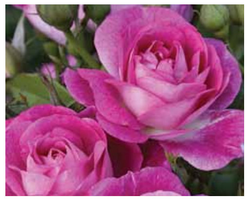
EASY TO PLEASE<sup>™</sup>, Floribunda. This pink floribunda will please everyone. Disease resistant and moderate clove scent. ₩. . $27.99

DEJA BLU™ , Miniflora. Flowers are a deep mauve with magenta highlights. Extremely fragrant and nearly thorn-less! ♥......$24.99