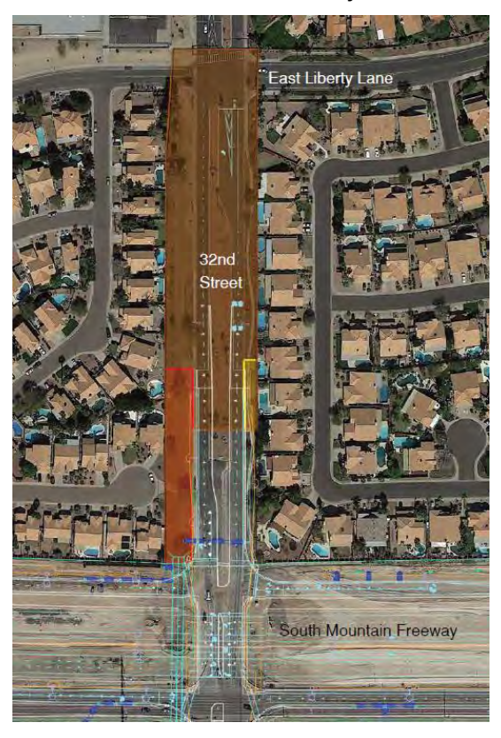
Figure 1: Site Map

The additional work area is located between the SMF and East Liberty Lane. The Project Area is shown on the next page. The red, yellow, and brown boxes indicate a drainage easement, temporary construction easement, and Project Area, respectively.