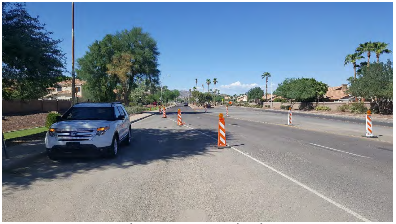
Photo 1-32nd Street, view to the north from South Mountain Freeway edge of right-of-way.