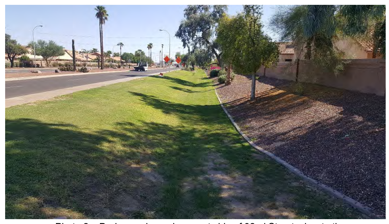
Photo 2 – Drainage channel on west side of 32nd Street, view to the south from East Liberty Lane