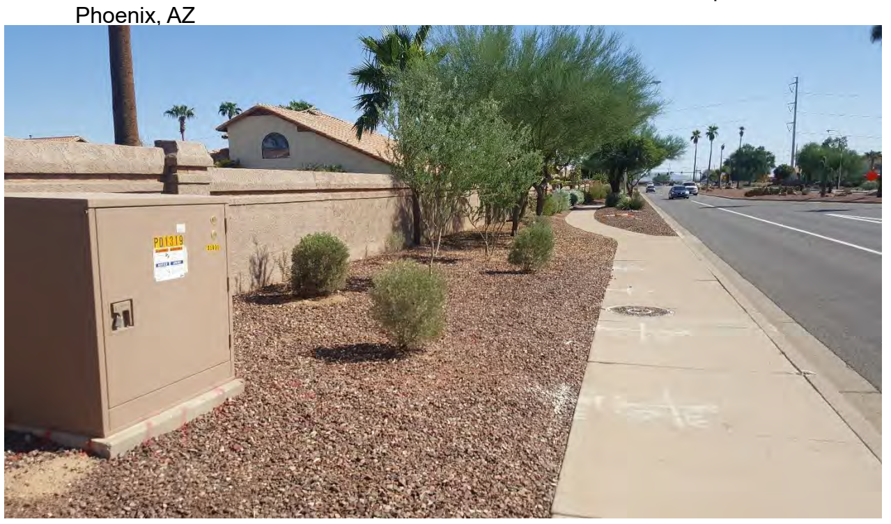
Photo 3 – Pad-mounted transformer at southeast order of East Liberty Land and 32nd Street, view to the south