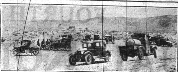
A view of Weepah, Nevada, the settlement that sprang out of the sagebrush virtually overnight after two boys had uncovered a promising vein of gold and started the west's latest gold rush. A heavy water tank truck is shown in the foreground.