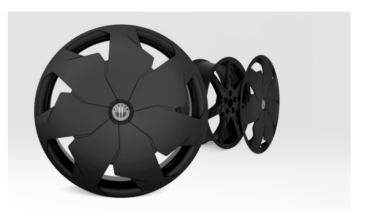
20" F7 AeroStealth The air won't notice them. Everyone else will.

Optional at no cost on Fisker Ocean One. Optional on Extreme, Ultra, Sport trims.