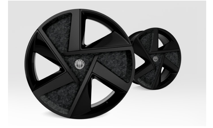
Standard on Fisker Ocean One. Optional on Extreme, Ultra, Sport trims.

Wheel: Black Gloss Cover: Upcycled Marbled Carbon Matte Accent Trim: Silver Paint (F3a) / Black Matte (F3b)