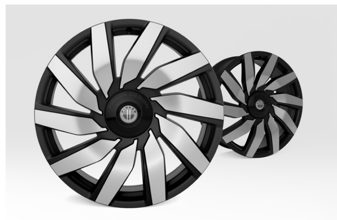
22" F6 Vortex A Beautiful Whirlwind.

Wheel: Two-tone Black + Bright Machined/Diamond Cut Coating: Tinted Matte Clear