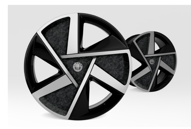
22" F3a SlipStream / F3b SlipStream Black Slippery Smooth Style.

The sculptural shapes of the Fisker Ocean are designed to slip through the wind. The Ocean sits powerfully atop bold and aerodynamic Fisker wheels—works of art that glide like the breeze and deliver all-electric power to the road.