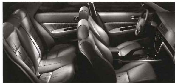
The interior of the TL is appointed with hand-selected leather and enhanced with the warm look of wood-grain accents.

Additional Exterior Colors: Cayman White Pearl, Pacific Blue Pearl, Juniper Green Pearl, Granite Silver Pearl and Flamenco Black Pearl