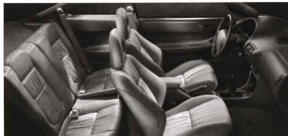
Selected Integra Sports Coupes and Sports Sedans are available with an interior appointed in supple, hand-selected leather.

*Integra Type-R available in spring 1998. †Not available on RS.