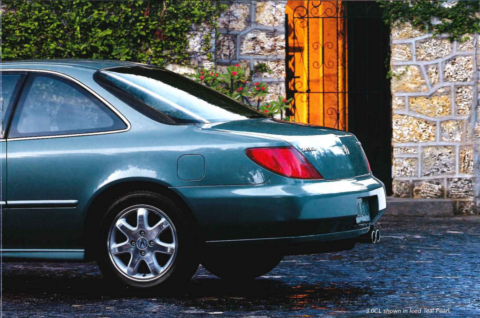
3.0CL shown in Iced Teal Pearl.

2.3CL: 2.3-liter, 16-valve, SOHC, in-line 4-cylinder engine with Variable Valve Timing and Lift Electronic Control (VTEC); 150 hp @ 5700 rpm with 152 lbs-ft torque @ 4800 rpm