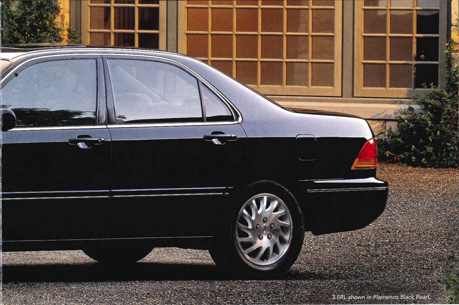
3.5RL shown in Flamenco Black Pearl.

3.5-liter, 24-valve, SOHC, V-6, all-aluminum engine with Programmed Fuel Injection (PGM-FI) and 3-stage Variable Induction System; 210 hp @ 5200 rpm