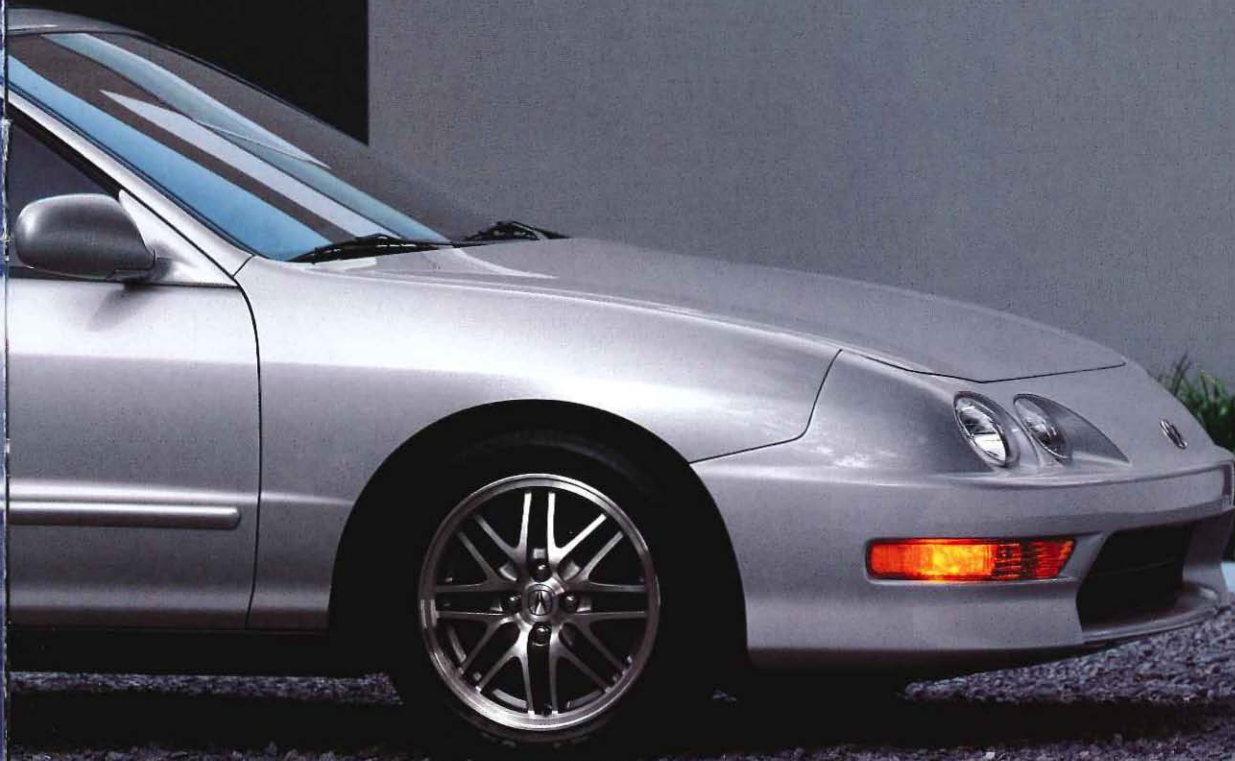
Integra GS Sports Coupe shown in Vogue Silver Metallic.

RS, LS, GS: 1.8-liter, all-aluminum, 4-cylinder, 16-valve DOHC engine, 140 hp @ 6300 rpm