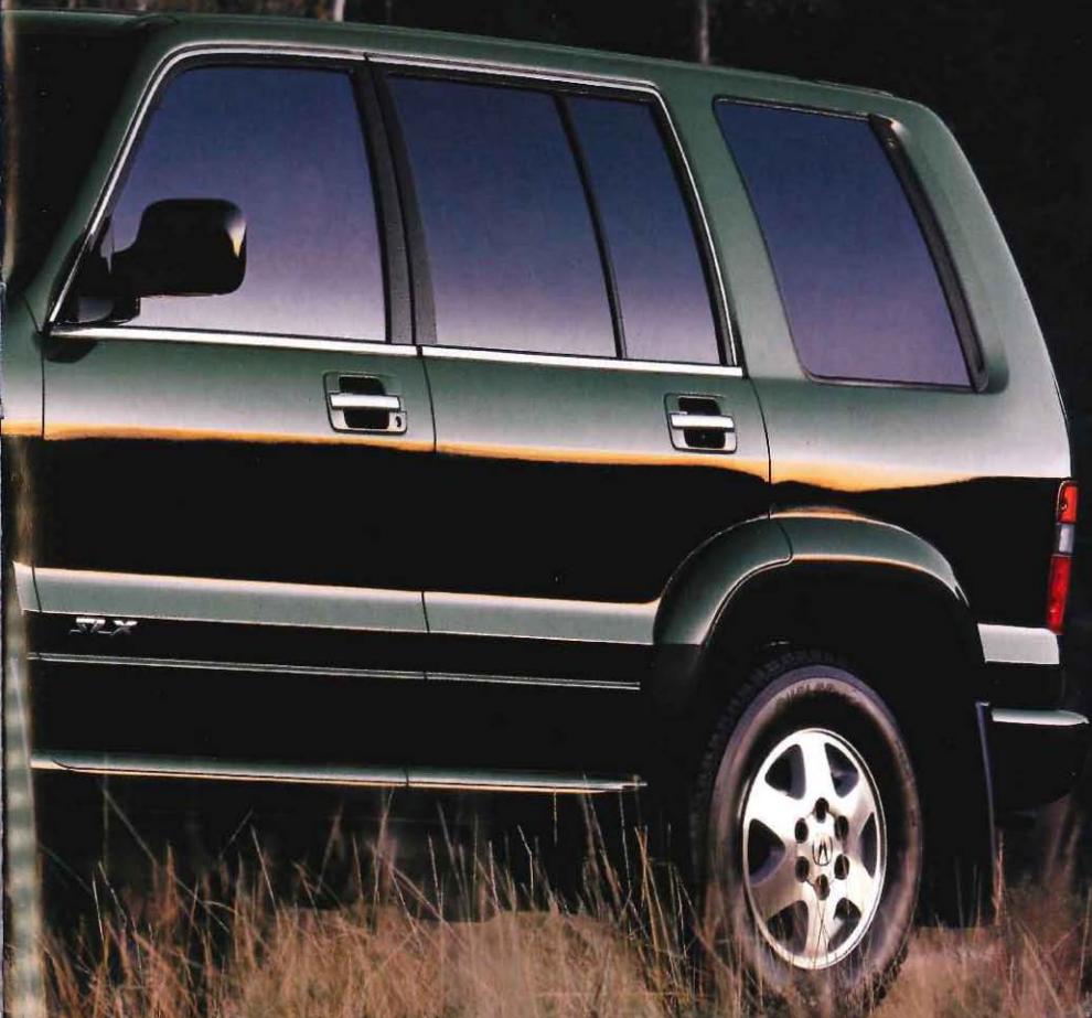
SLX shown in Fir Green Mica.

3.5-liter, DOHC, 24-valve, V-6 engine with 215 hp @ 5400 rpm and 230 lbs-ft torque @ 3000 rpm