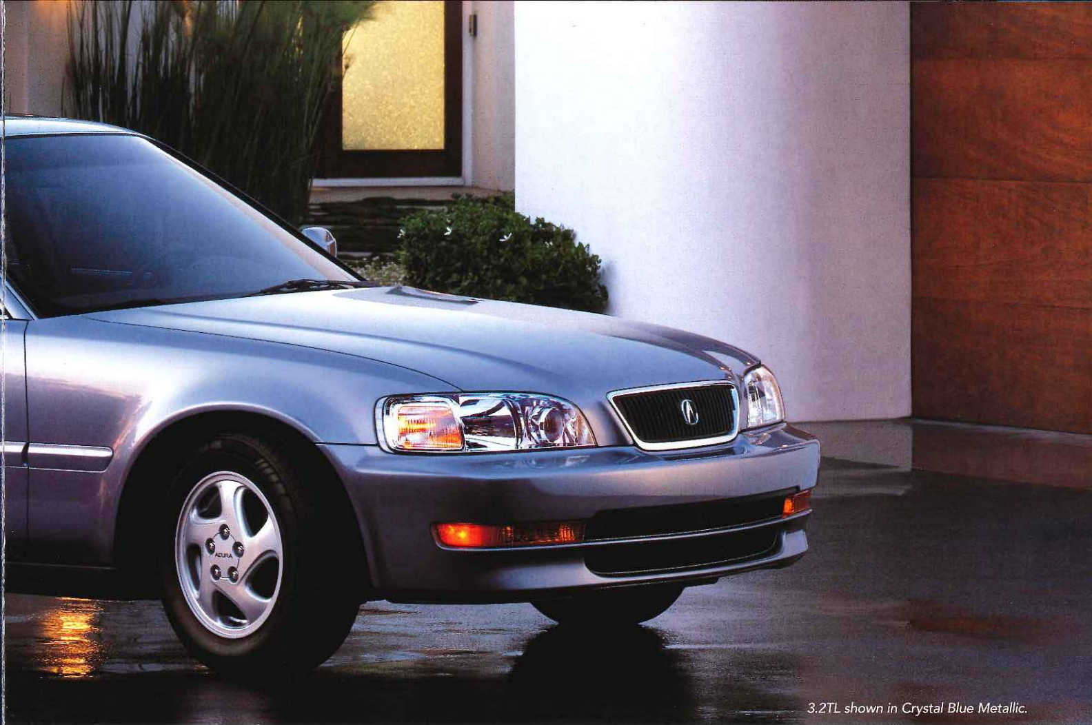
3.2TL shown in Crystal Blue Metallic.

2.5TL: 2.5-liter, 20-valve, SOHC, in-line 5-cylinder engine with 176 hp @ 6300rpm