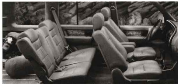
The roomy, leather-appointed interior of the Acura SLX would not look out of place in a world-class luxury sedan.

Additional Exterior Colors: Cream White, Light Silver Metallic, Ebony Black and Baltic Blue