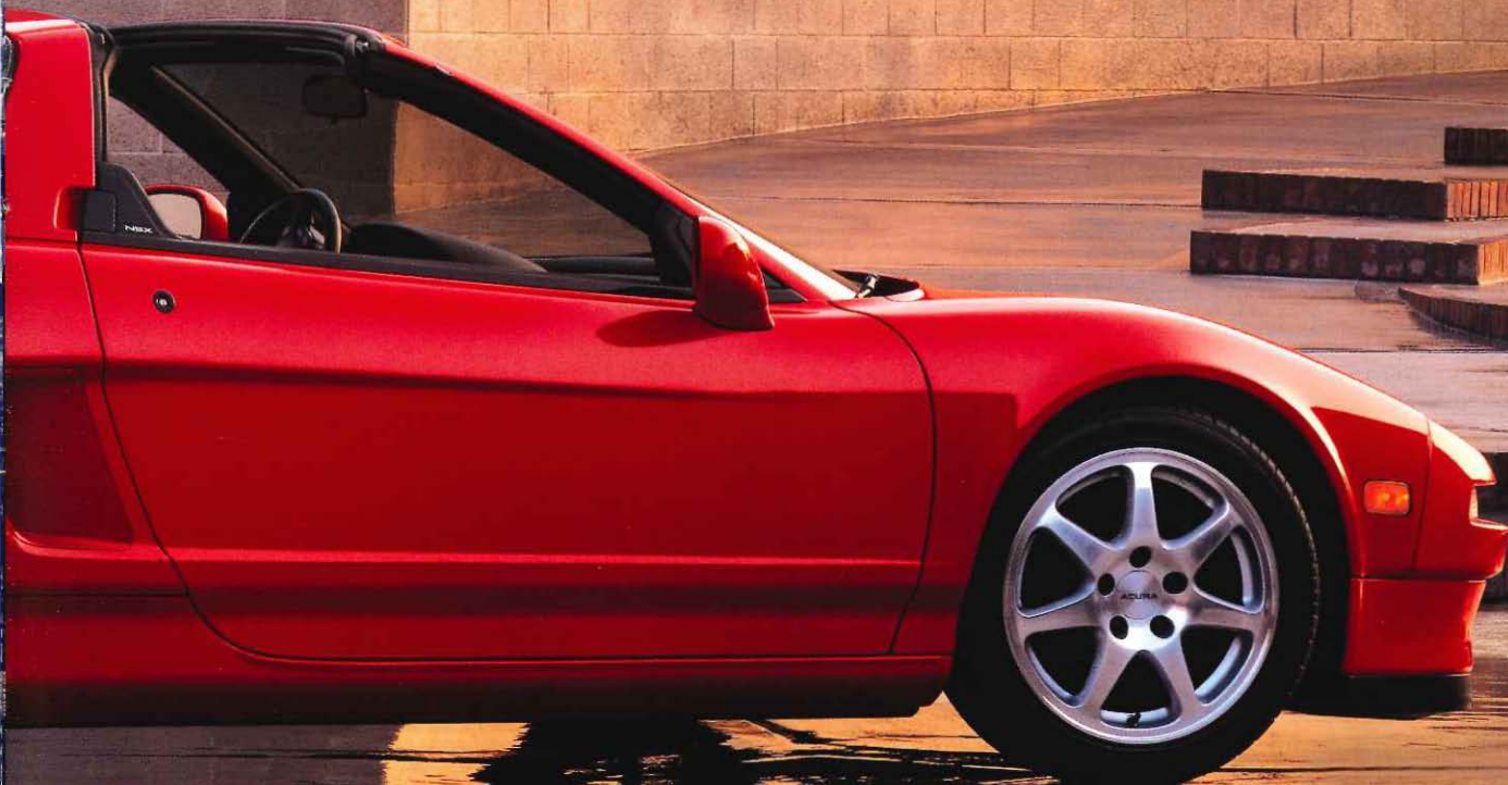
NSX-T shown in Formula Red.

3.2-liter (manual) and 3.0-liter (automatic), DOHC, 24-valve V-6 with Variable Valve Timing and Lift Electronic Control (VTEC)