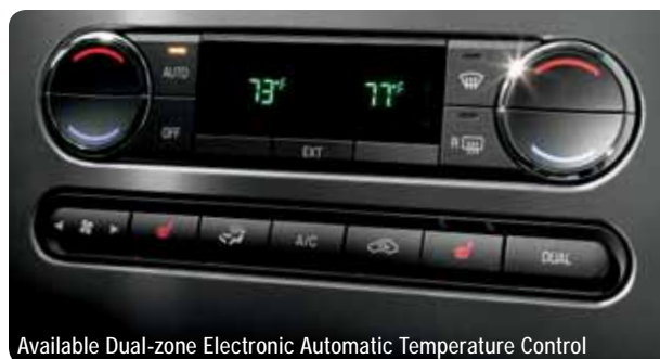
Available Dual-zone Electronic Automatic Temperature Control