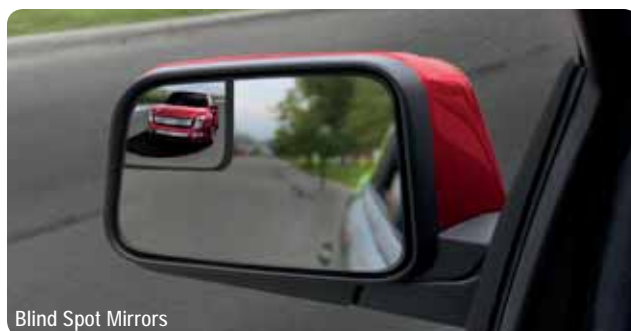
Blind Spot Mirrors