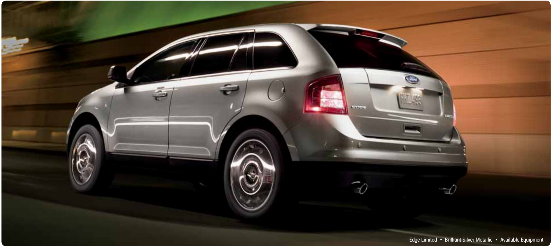
Edge Limited • Brilliant Silver Metallic • Available Equipment