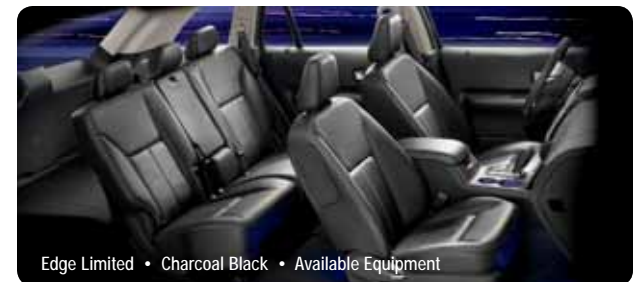
Edge Limited • Charcoal Black • Available Equipment

There's something inherently enchanting about open-air driving. It's invigorating, yet soothing, all at once. Vista Roof is your ticket to this horizon-expanding ride. Encompassing almost 40% of the total roof area on Edge, the panoramic Vista Roof creates a daylight opening that's over 3 times larger than the average traditional moonroof. And for those rare moments when you'd rather not look skyward, dual power sunshades help keep the cabin cool and protected from the sun. A wind diffuser and thick roof glass help maintain the peace. Vista Roof is optional on SEL, Sport and Limited.