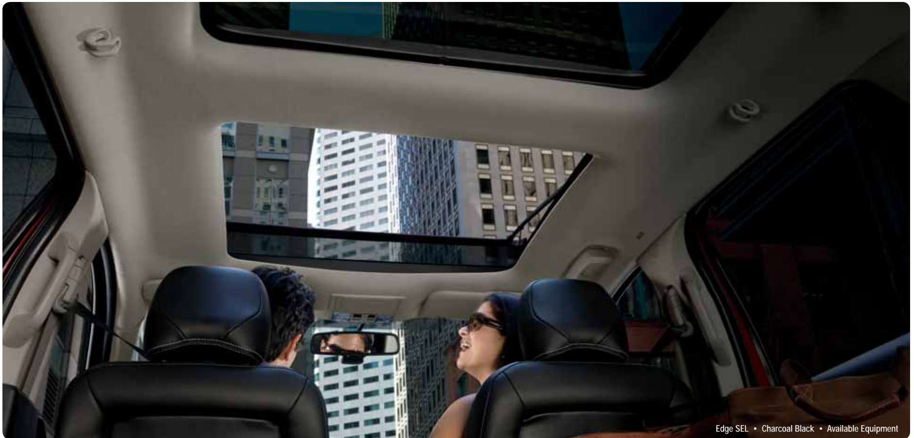
Edge SEL • Charcoal Black • Available Equipment