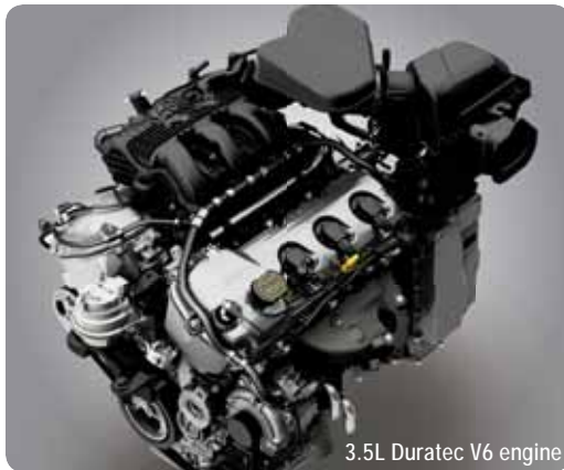
3.5L Duratec V6 engine