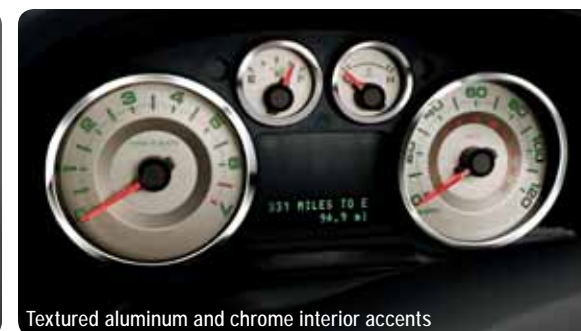
Textured aluminum and chrome interior accents