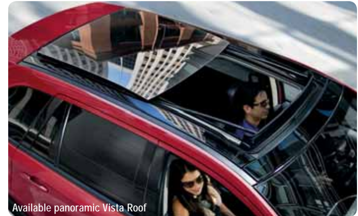
Available panoramic Vista Roof

Alcantara is a registered trademark of Alcantara S.p.A., Italy.