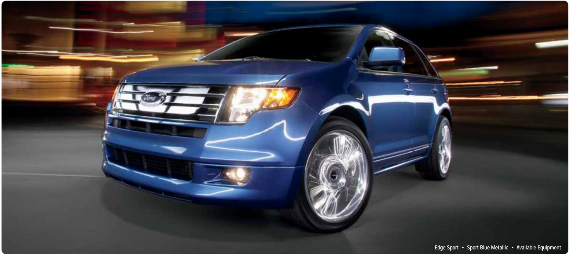
Edge Sport • Sport Blue Metallic • Available Equipment