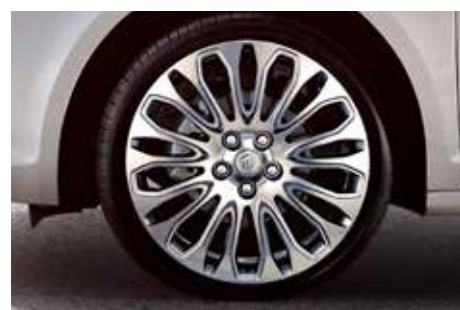
20" MACHINE-FACED SILVER PAINTED ALLOY