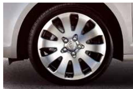
19" SILVER PAINTED ALLOY