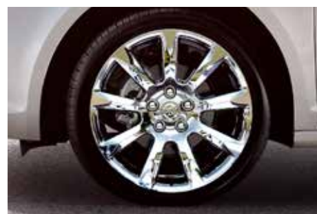
19" CHROME ALLOY