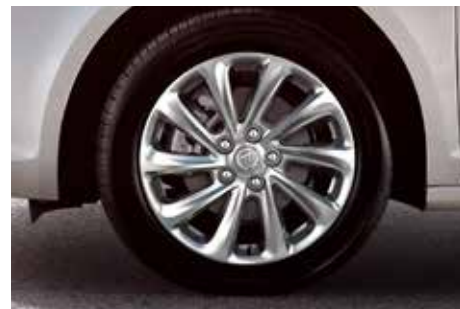
18" STERLING SILVER PAINTED ALLOY