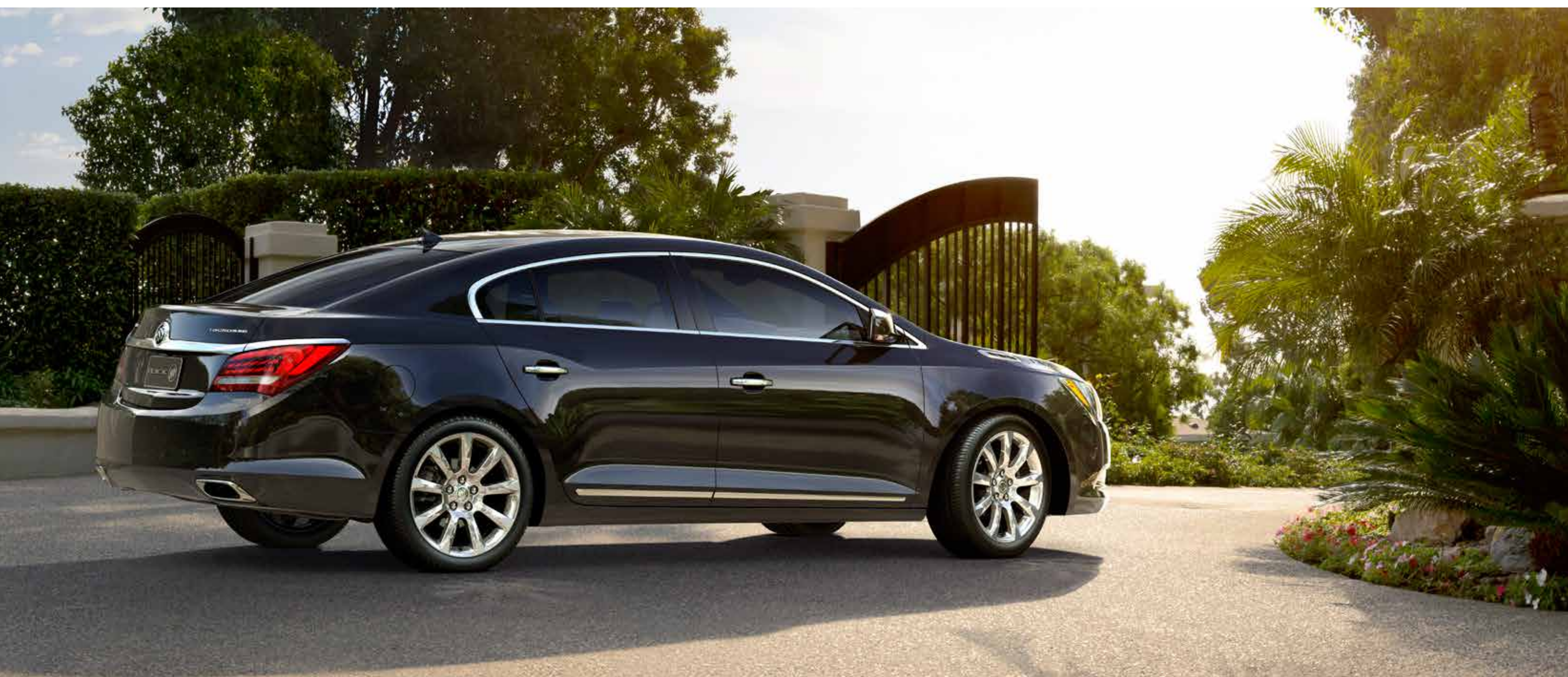
MIDNIGHT AMETHYST METALLIC