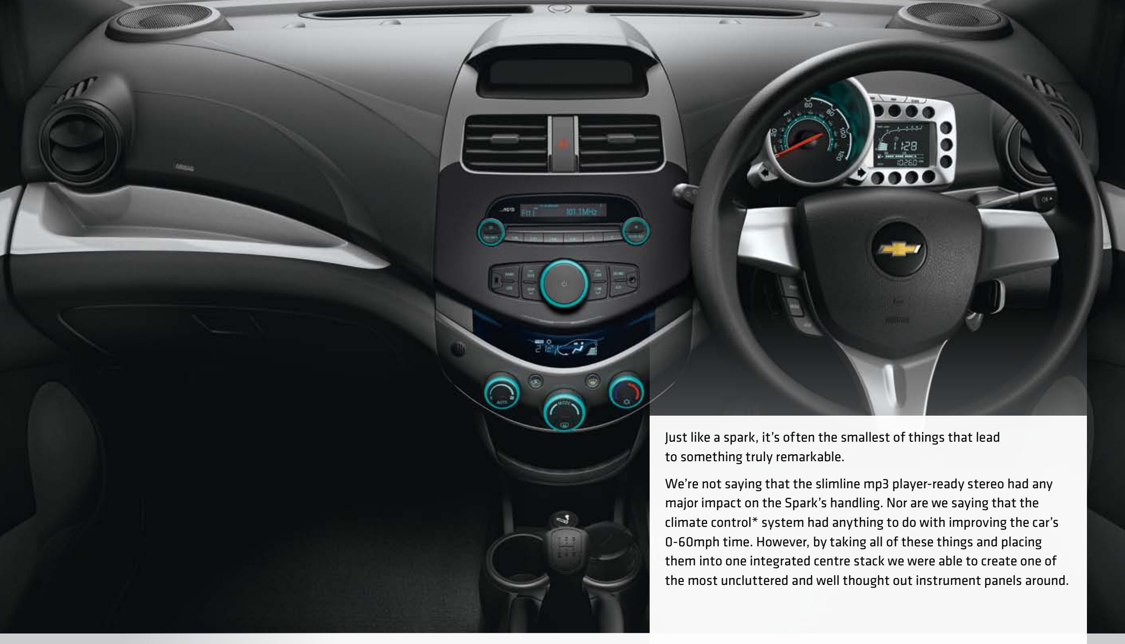
IT'S ALL IN THE DETAILS