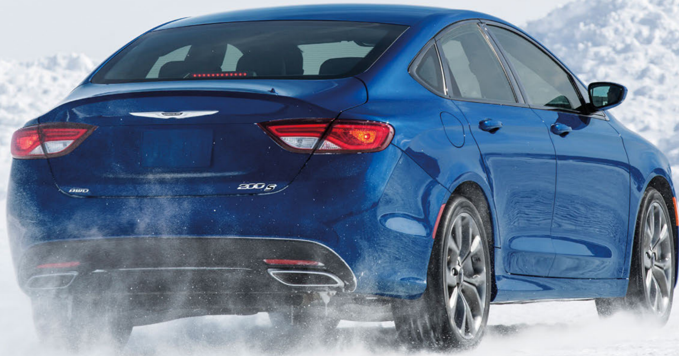
200S shown in Vivid Blue Pearl.