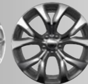
AVAILABLE (FWD/AWD) 19-INCH POLISHED ALUMINUM WITH GREY PAINTED POCKETS