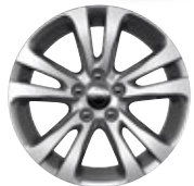
STANDARD 17-INCH TECH SILVER ALUMINUM