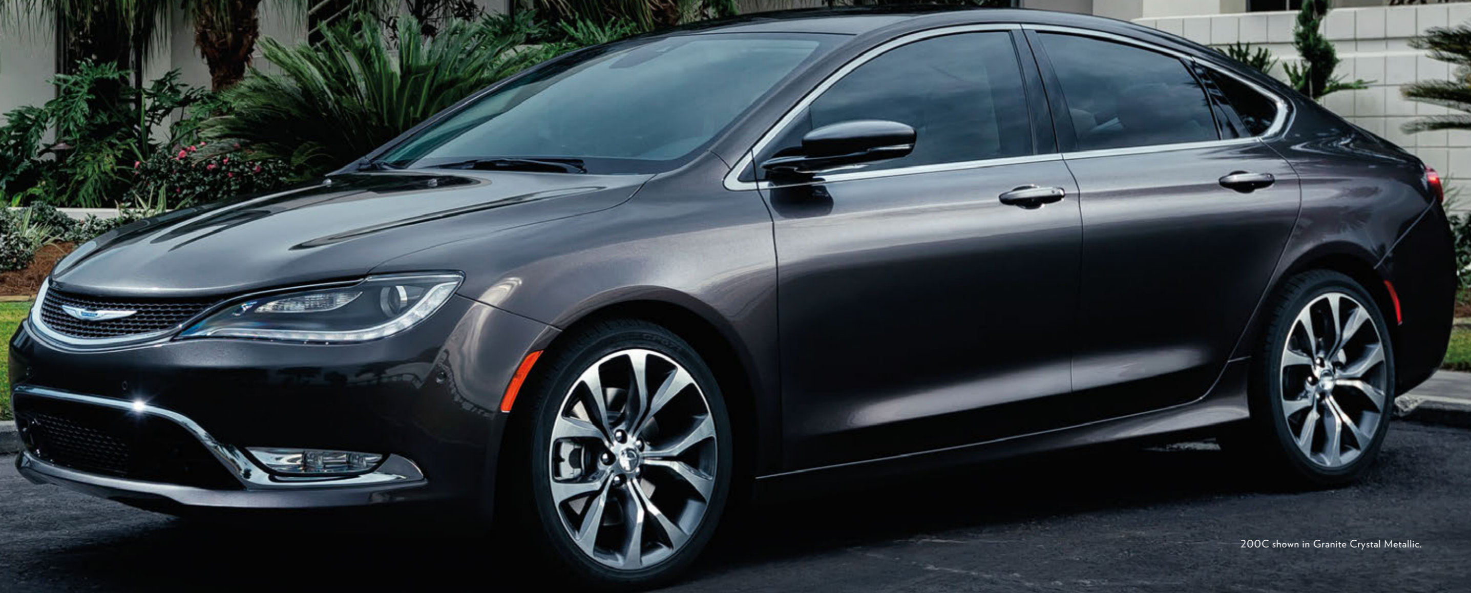
200C shown in Granite Crystal Metallic.