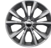
STANDARD (FWD/AWD) 18-INCH SATIN CARBON ALUMINUM