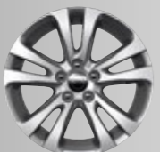
STANDARD 17-INCH TECH SILVER ALUMINUM