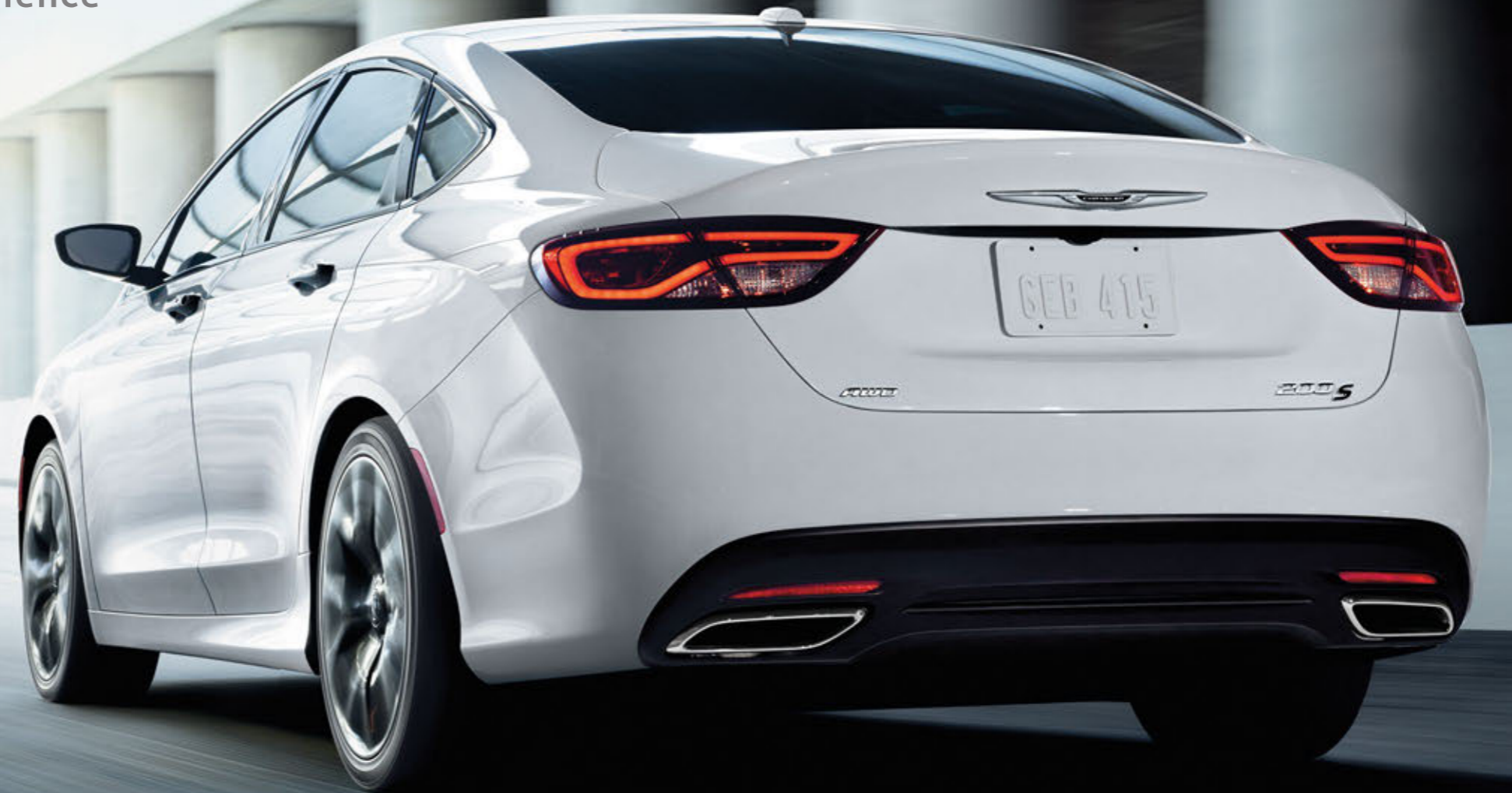
200S shown in Bright White.