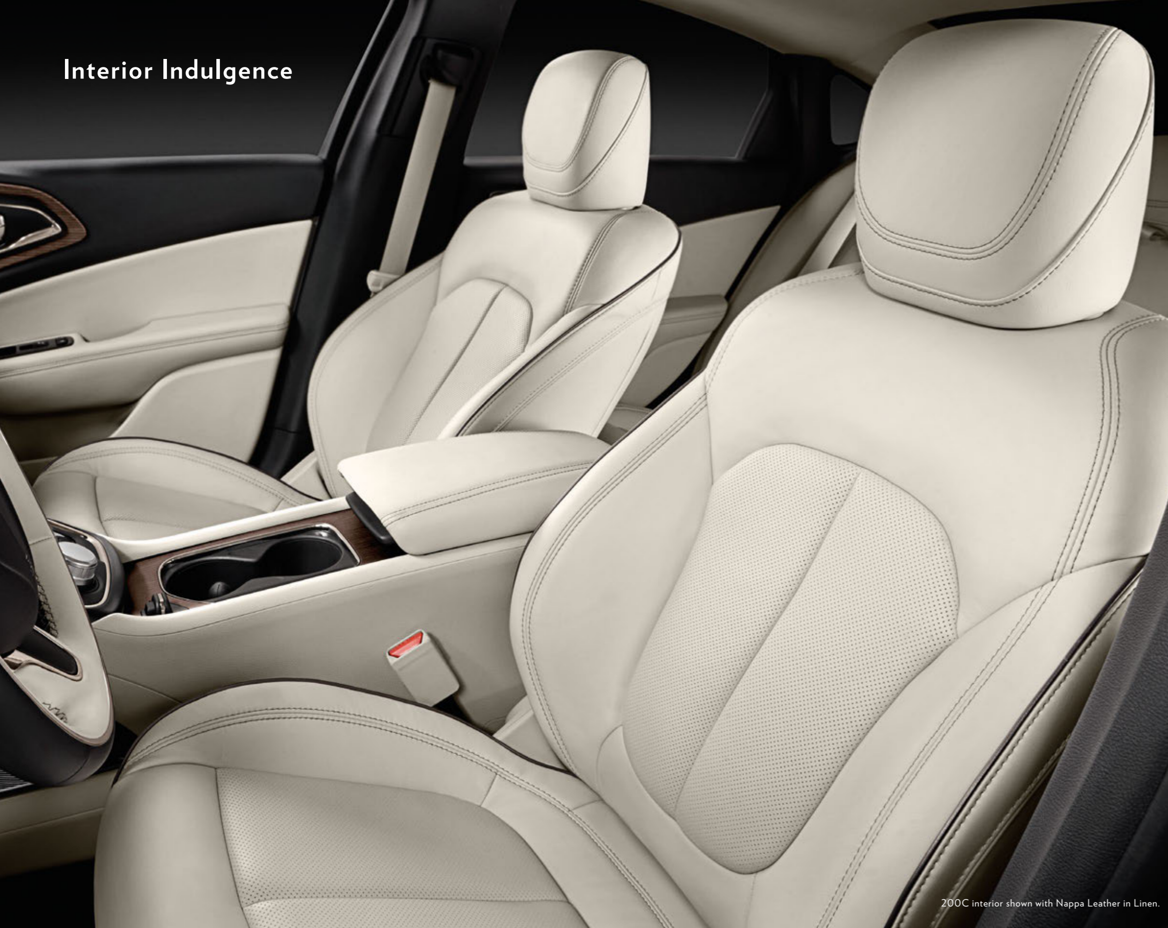
200C interior shown with Nappa Leather in Linen.