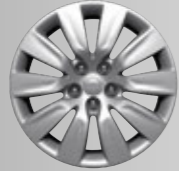
STANDARD 17-INCH WHEEL COVERS