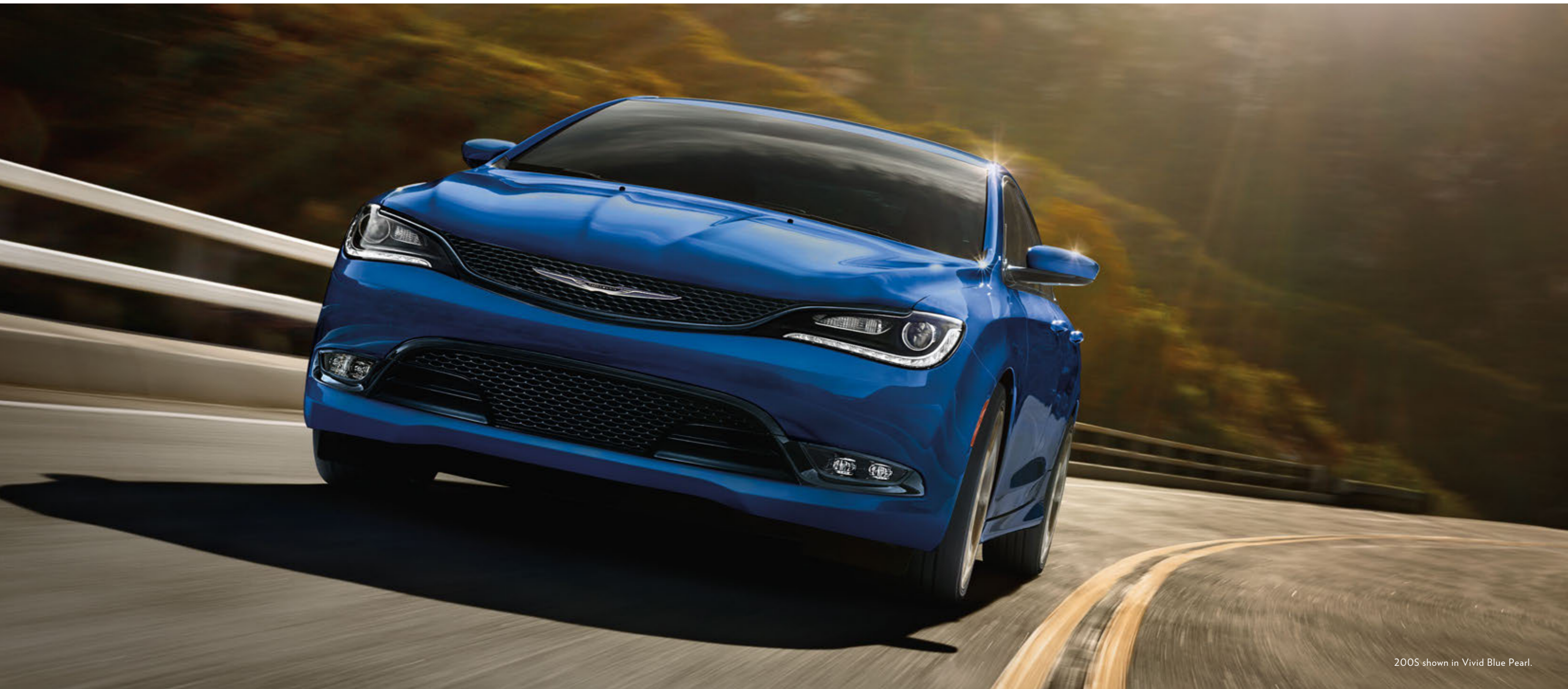
200S shown in Vivid Blue Pearl.

A Ward's "10 Best Engine" for three years 3 – available on the Limited, 200S and 200C models – it applies some of the most advanced engine technologies and is one of the lightest and quietest of its kind. Ninety percent of the class-leading 2 295 horsepower and exceptional 262 lb-ft of torque is delivered between 1600 and 2400 rpm, resulting in a smooth, responsive driving experience that also delivers impressive fuel efficiency of 7.5 L/100 km (38 mpg) highway.*