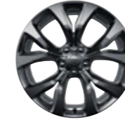
AVAILABLE (FWD/AWD) 19-INCH HYPER BLACK ALUMINUM