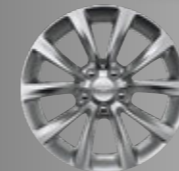
STANDARD (FWD) 17-INCH SATIN SILVER ALUMINUM