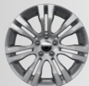
AVAILABLE 18-INCH SATIN SILVER ALUMINUM