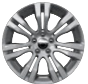
AVAILABLE 18-INCH SATIN SILVER ALUMINUM