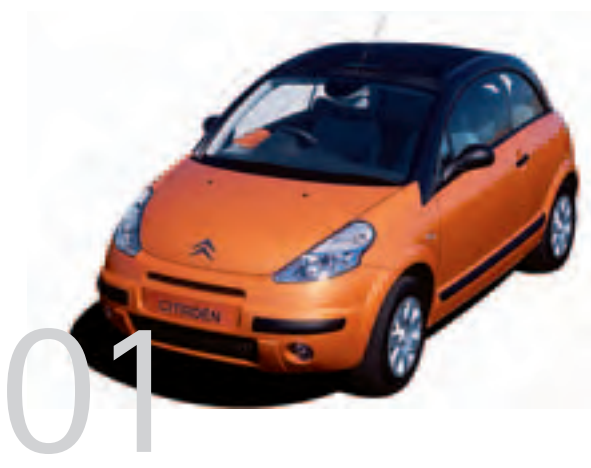
C3 Pluriel Hatch - Take off for the weekend, rain or shine

C3 Pluriel Panoramic - Reveal new possibilities