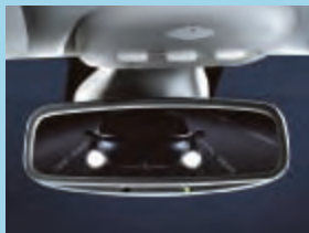
To avoid any risk of being dazzled the electrochromic rear view mirror becomes tinted if the light level decreases. It is featured on the 3.0L V6.