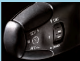
A speed limiter coupled with the cruise control prevents you from going beyond your set speed unless you deliberately "kick-down" the throttle or cancel it.