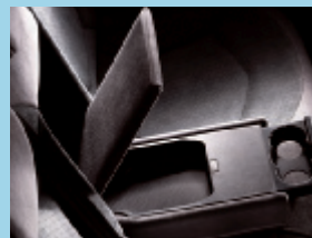
Multiple storage units and spaces help keep everything to hand: pictured above is the rear central armrest with storage area and cupholders.