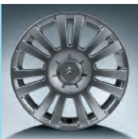
Hungaro 16" Alloy Wheels