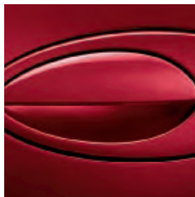
Rouge Profund (Pearlescent)