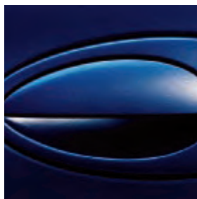
Bleu Mauritius (Pearlescent)