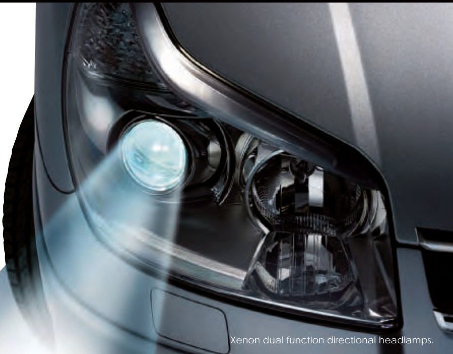
Xenon dual function directional headlamps.

*Optional by factory order on other versions.