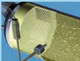
As part of the exhaust system, a state-of-the-art Particulate Filter periodically burns off the carbon particles that remain, virtually eliminating diesel smoke, thereby exceeding current EU environmental standards.