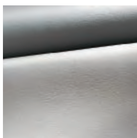
Luxury 'Matinal' Leather