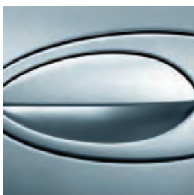
Gris Iceland (Metallic)