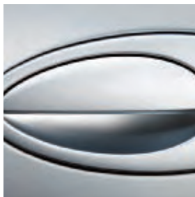
Gris Aluminium (Metallic)