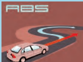
Antilock Brake System (ABS). Electronic Stability Programme (ESP) with traction control is standard across the range, as is Emergency Brake Assist (EBA) and Electronic Brakeforce Distribution (EBD).