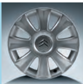
Suzuka 16" Alloy Wheels (3.0L V6 Exclusive)