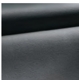
Luxury 'Tramontane' Leather