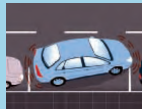
On the 3.0L V6 Exclusive, the front and rear electronic parking sensors, have both an audible and visual directional alert feature.