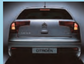
Automatic illumination of hazard warning lights on rapid deceleration.