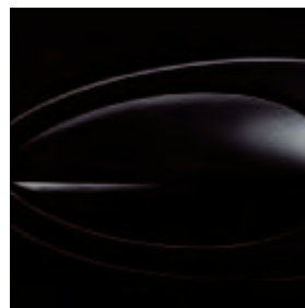
Noir Obsidien (Pearlescent)