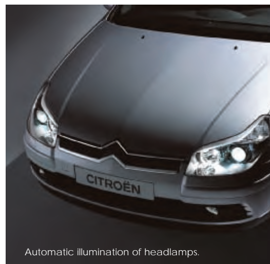
Automatic illumination of headlamps.

EuroNCAP. The Citroën C5 achieved 36 from a maximum possible 37 points in the tough EuroNCAP independent crash tests, including full marks for the front impact test.