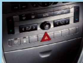
The heat-reflecting windscreen limits the effects of the sun's rays and helps the automatic air conditioning maintain a comfortable cabin temperature. There is an area around the rear vision mirror for e-tag use.

Citroën C5 has a truly luxurious and comfortable cabin that can easily be transformed into a music room with its standard RDS Stereo radio/CD player that automatically adjusts the volume setting according to the speed of the car. The 3.0L V6 Exclusive adds MP3 and 6 stack CD player.