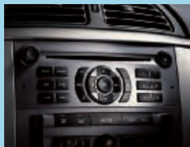
The audio volume adjusts itself automatically, to provide you with a consistent level of sound, irrespective of the speed at which you are driving.