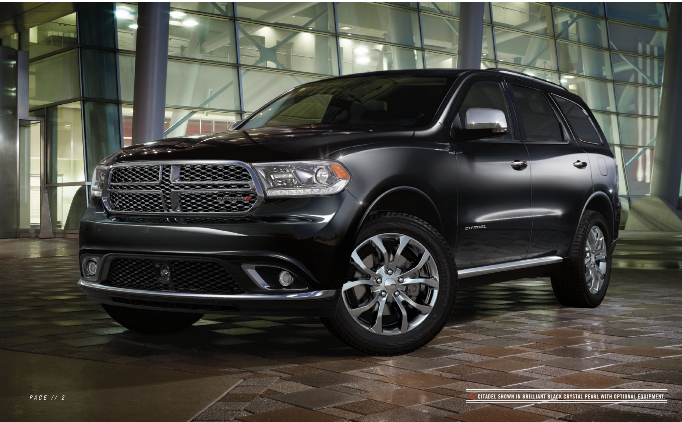
//// CITADEL SHOWN IN BRILLIANT BLACK CRYSTAL PEARL WITH OPTIONAL EQUIPMENT.