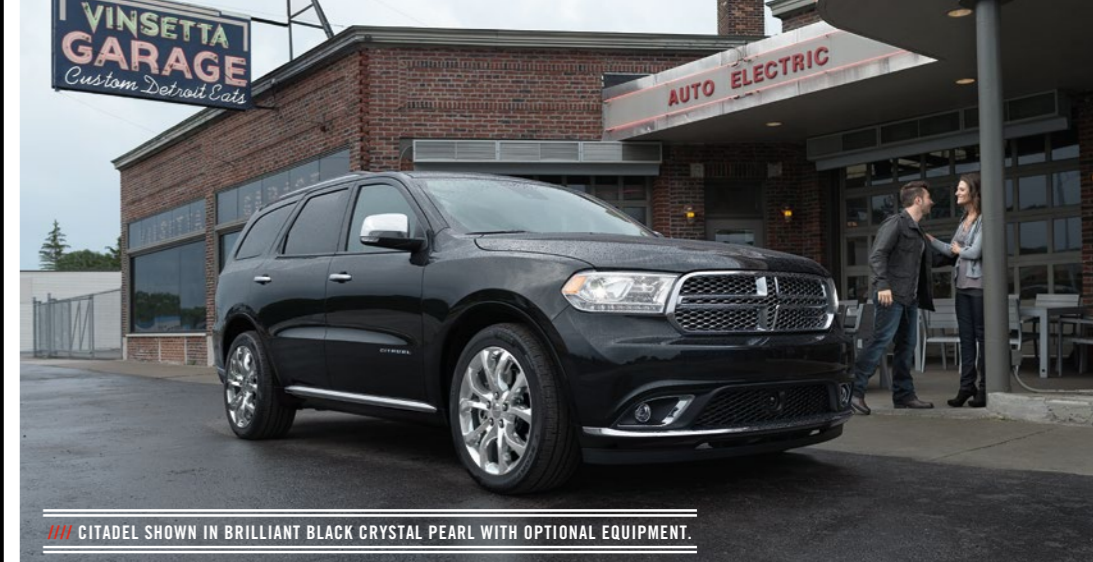
//// CITADEL SHOWN IN BRILLIANT BLACK CRYSTAL PEARL WITH OPTIONAL EQUIPMENT.