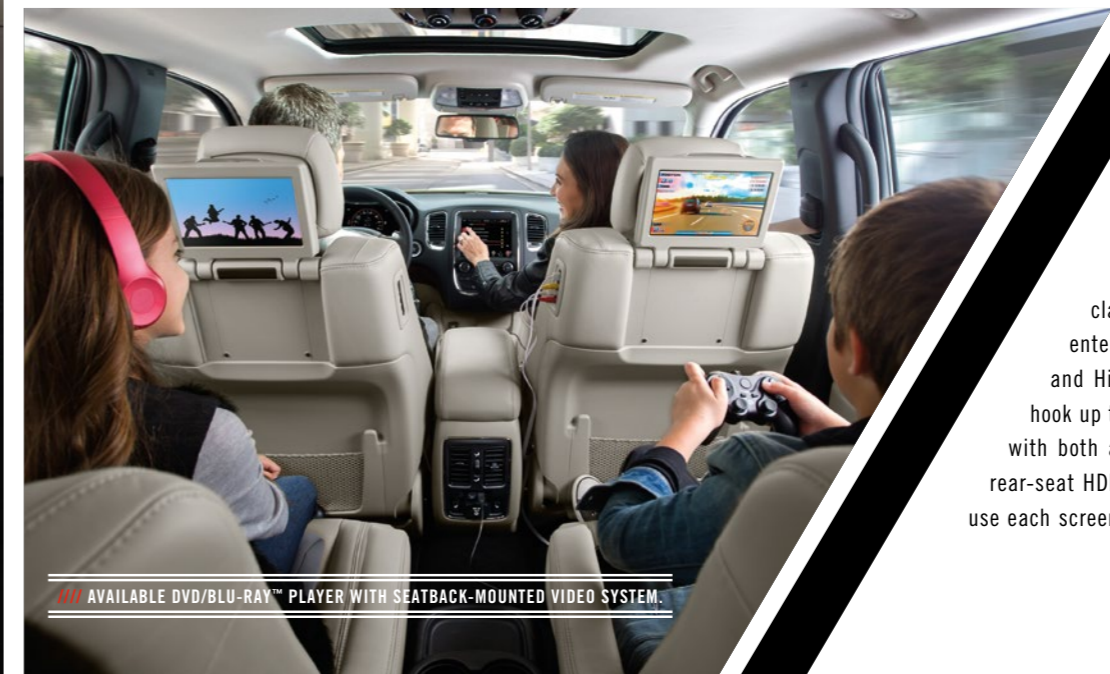
//// AVAILABLE DVD/BLU-RAY™ PLAYER WITH SEATBACK-MOUNTED VIDEO SYSTEM.

THERE'S NO DOUBT that Durango is a passenger powerhouse. Standard seven-passenger seating includes a fold-flat front-passenger seat, 60/40 split-fold-flat second-row reclining bench seat with integrated padded centre armrest with cup holders, and 50/50 split-folding third-row seats. Opt for cloth or heated leather-faced fold-and-tumble second-row Captain's Chairs with soft-touch armrests and a floor-mounted mini console with cup holders for six-passenger seating.