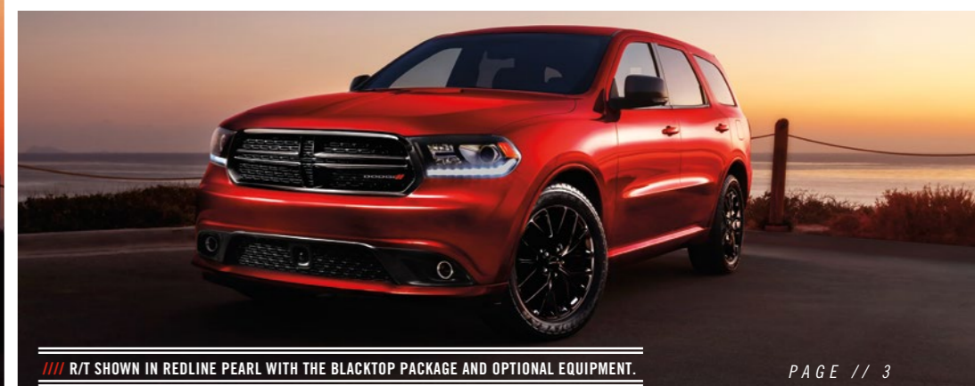
//// R/T SHOWN IN REDLINE PEARL WITH THE BLACKTOP PACKAGE AND OPTIONAL EQUIPMENT.