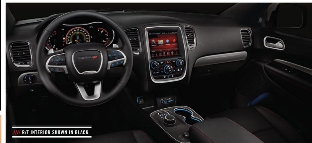
//// R/T INTERIOR SHOWN IN BLACK.