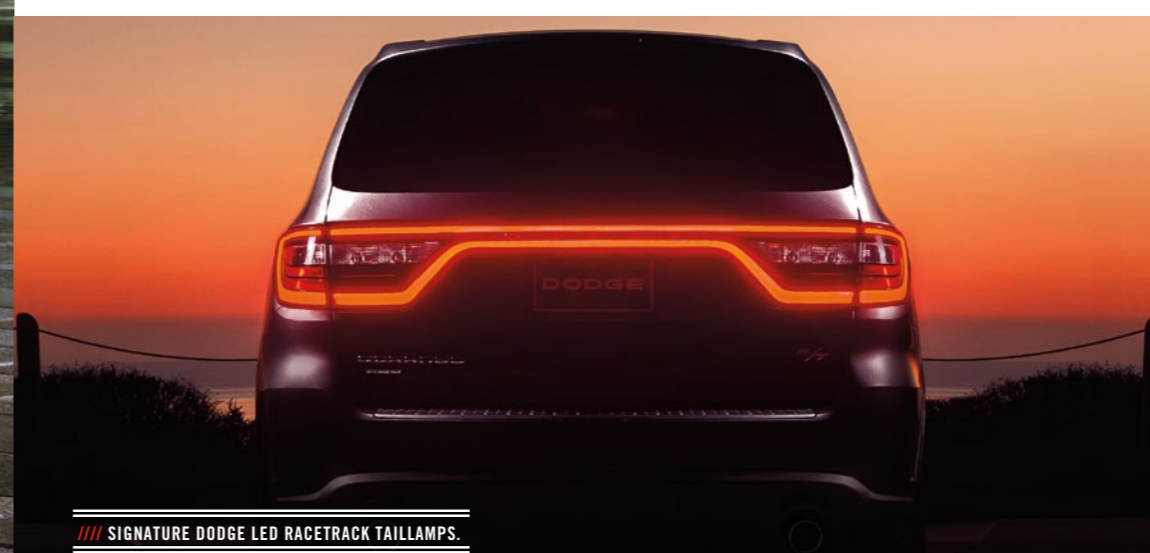
//// SIGNATURE DODGE LED RACETRACK TAILLAMPS.

*All disclaimers and disclosures can be found on the back cover.