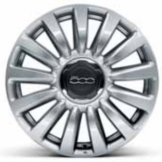
433 16" SILVER ALLOY WHEELS

5EQ 17" TREKKING ALLOY WHEELS GLOSSY BLACK DIAMOND FINISHED AND M+S (MUD&SNOW) ALL-SEASON TYRES